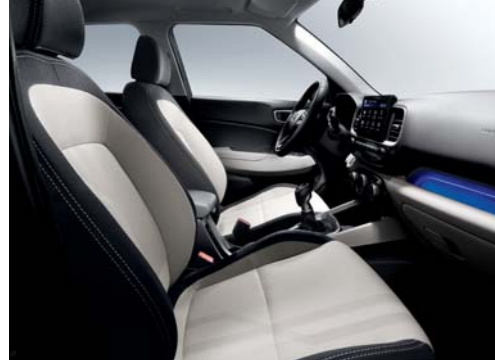
Grey two-tone (Woven + Point(Woven))