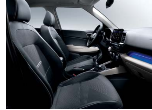
Denim two-tone (Woven, Patch + Emboss)