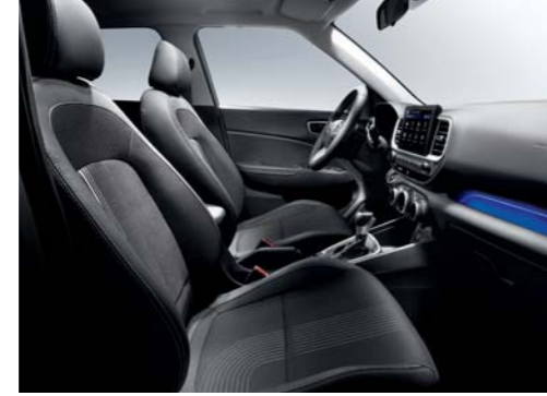
Black one-tone (Woven, Patch + Emboss)