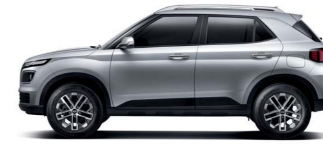
Overall Length 3,995 Wheel Base 2,500