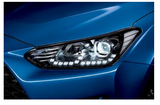
LED headlamps with LED DRL