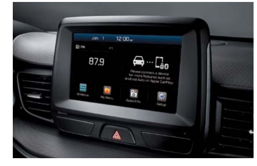
7" touch screen display