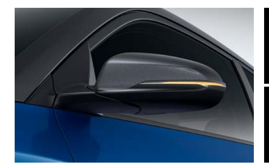
Exterior mirrors with LED indicator