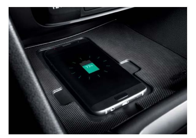
Smartphone wireless charging system