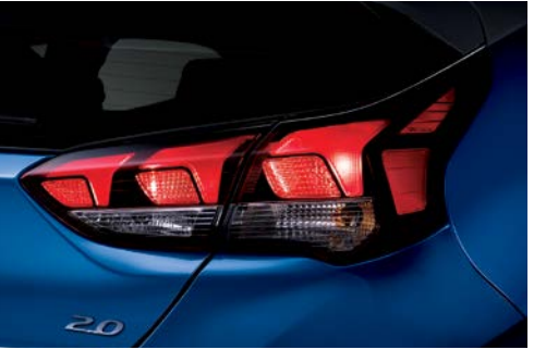
Rear combination lamps (bulb type)