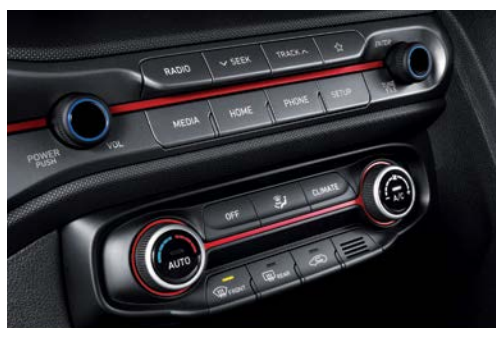
Full auto air conditioning with auto defog