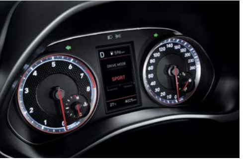
4.2" supervision cluster (1.6 Turbo)