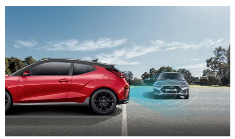
Rear Cross-Traffic Collision Warning (RCCW)