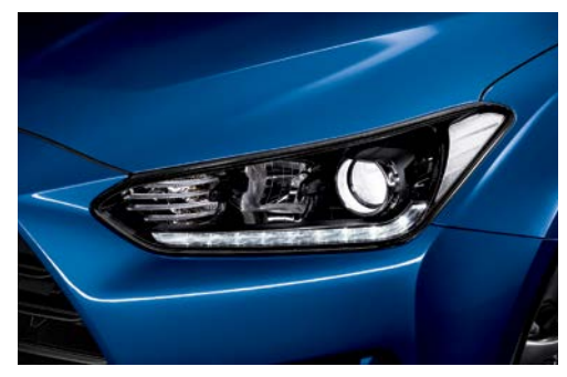
Projection headlamps with LED DRL