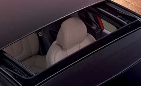
Wide type sunroof