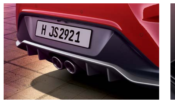
Center twin tip muffler (for 1.6 Turbo only)