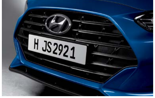
Cascading grille (horizontal bar type, 2.0 Engine only)