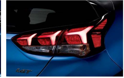
Rear LED lamps