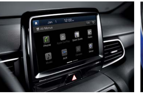
8" touch screen display