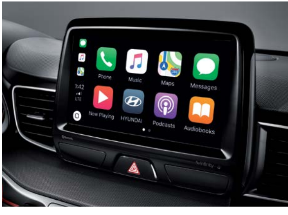
Smartphone connectivity (Apple CarPlay, Android Auto)