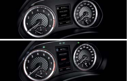
3.5" cluster / 4.2" supervision cluster (2.0 MPI)