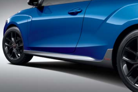
Side sill molding