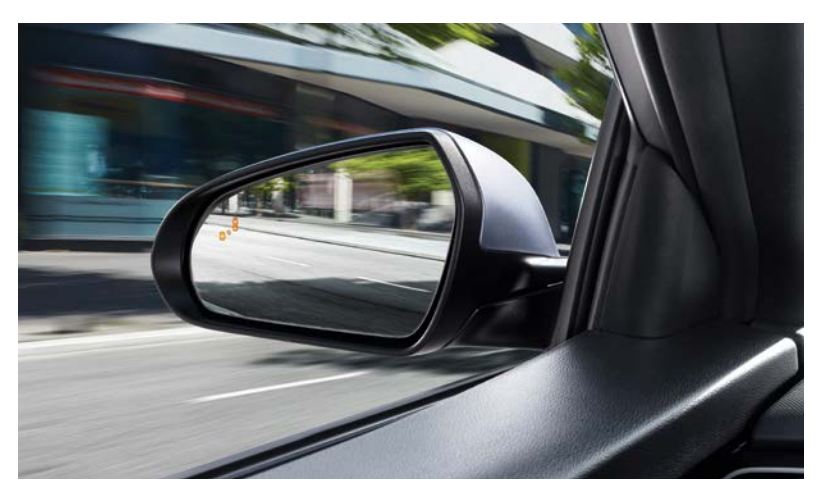
Blind-Spot Collision Warning (BCW)

This car won't just get you all the gazes-it also looks out for you. Equipped with Blind-Spot Collision Warning (BCW) and Rear Cross-Traffic Collision Warning (RCCW) it will always keep you safe and sound in your own motorized realm.