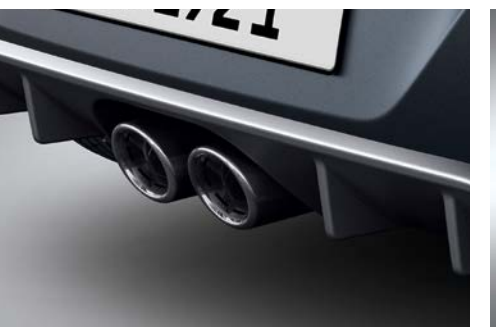
Center twin tip muffler