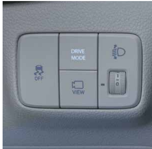
Drive mode select