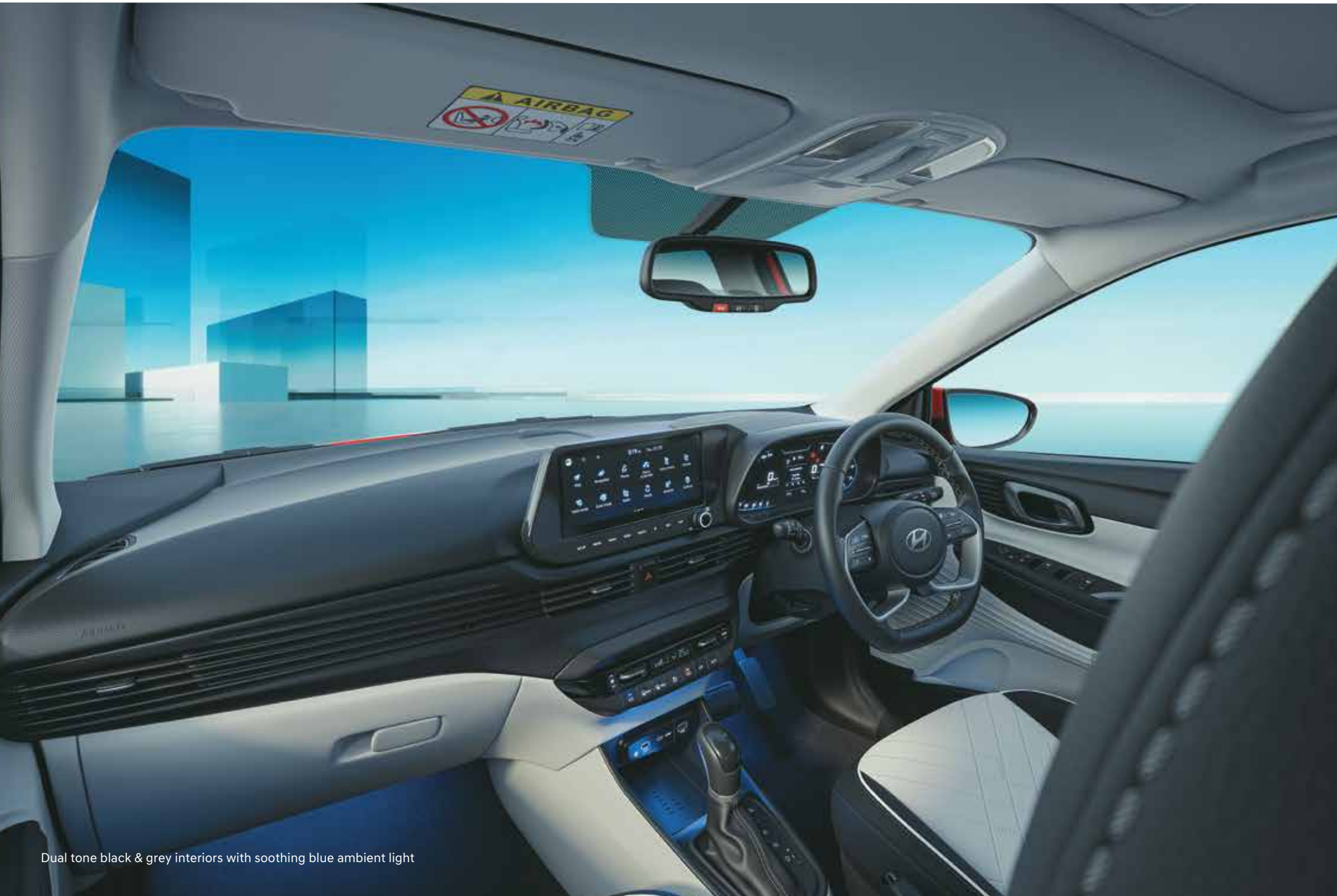
Dual tone black & grey interiors with soothing blue ambient light