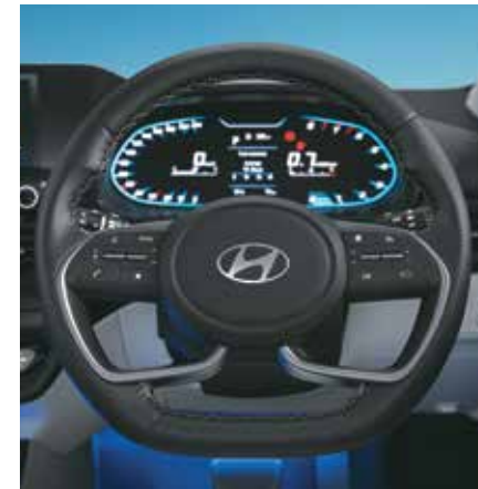
Leather wrapped D-cut steering