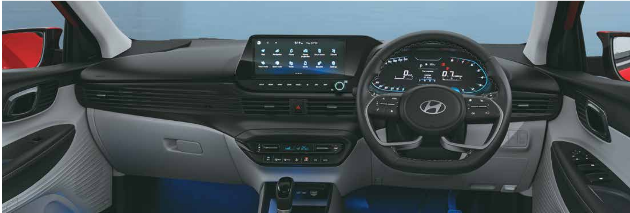
Dual tone black & grey interiors