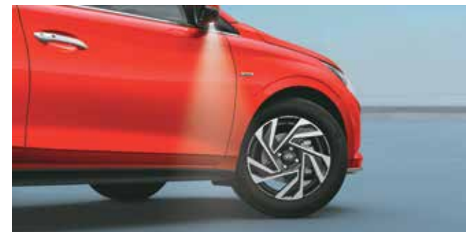
Puddle lamps with welcome function

Other features: Chrome outside door handles | Turn indicators on outside mirrors Painted black finish side sill garnish with i20 branding | Shark fin antenna