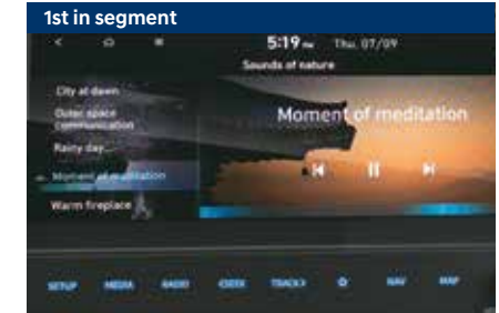
Ambient sound of nature (7 nos.)