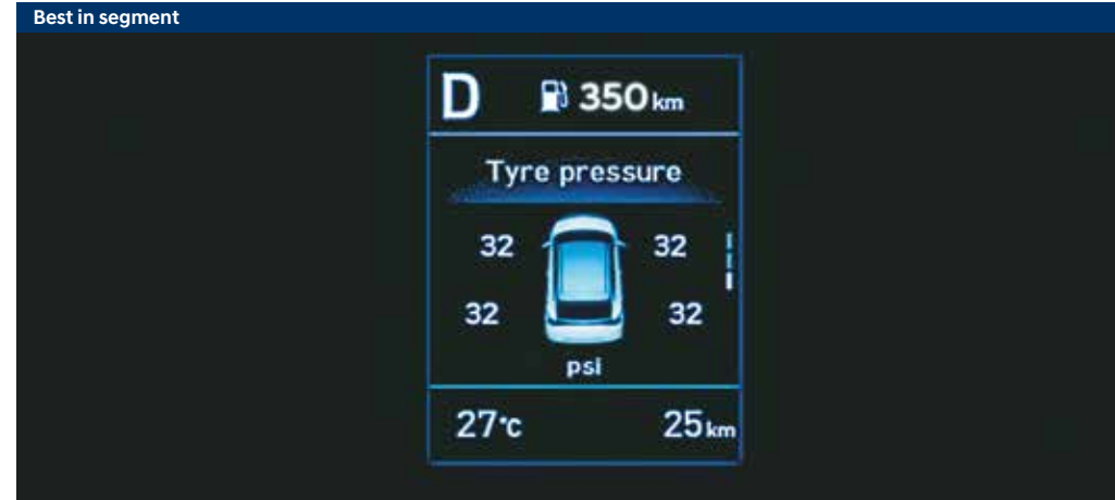
Best in segment Tyre pressure monitoring system (highline) with display on MID