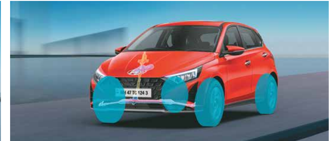
Electronic stability control (ESC) with vehicle stability management (VSM)

Other features: Impact sensing auto door unlock | Speed sensing auto door lock | Automatic headlamps | Burglar alarm | Driver rear view monitor (DRVM) | Emergency stop signal (1 st in segment) 3-point seat belt & seat belt reminder (all seats) | Rear camera with dynamic guidelines | ISOFIX (standard)