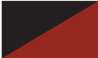
Fiery red with abyss black roof