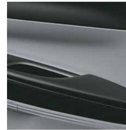
Door armrest covering (artificial leather)