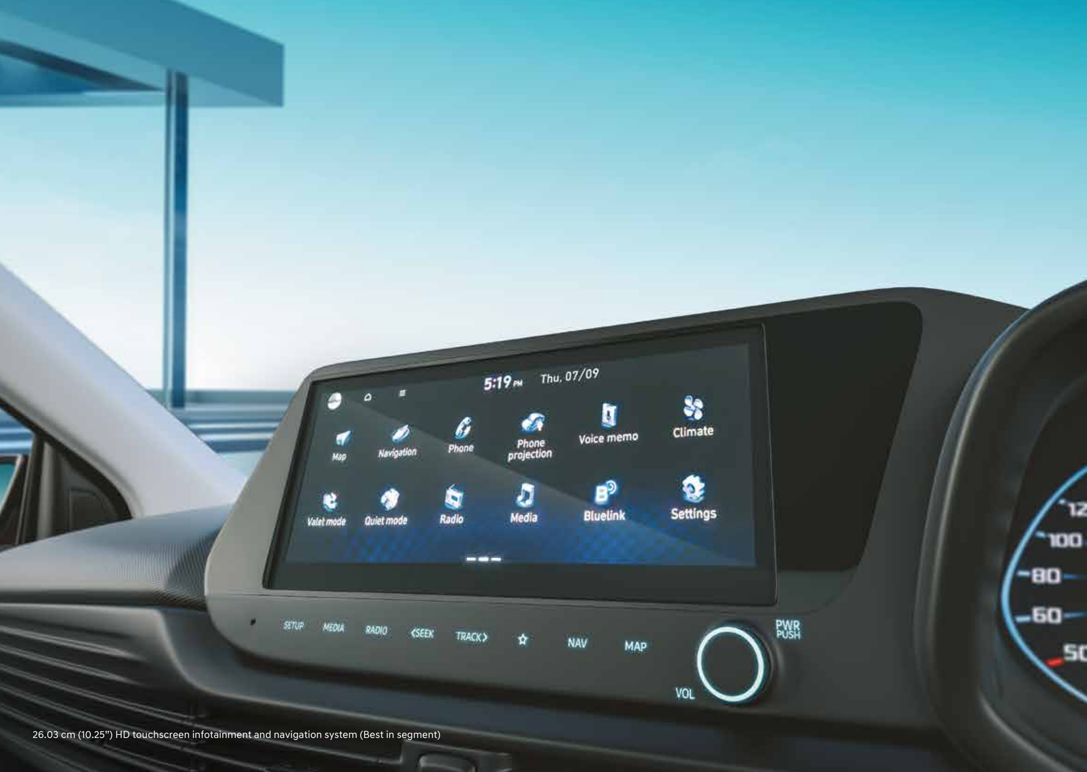
26.03 cm (10.25") HD touchscreen infotainment and navigation system (Best in segment)