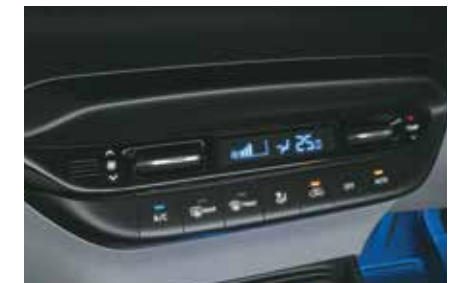
Fully automatic temperature control (FATC)