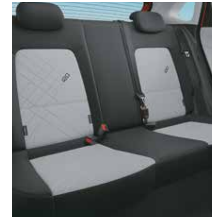
Spacious interiors with ample headroom, legroom and shoulder room