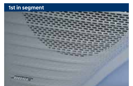
Bose premium 7 speaker system

Other features: 60+ Bluelink connected features (Best in segment) | Multi-language UI support (12 nos.) (1 st in segment) | OTA updates for infotainment and map (1 st in segment) | Home to car (H2C) with Alexa (English & Hindi) | Cruise control | Rear AC vents | Multi phone bluetooth connectivity (1 st in segment)