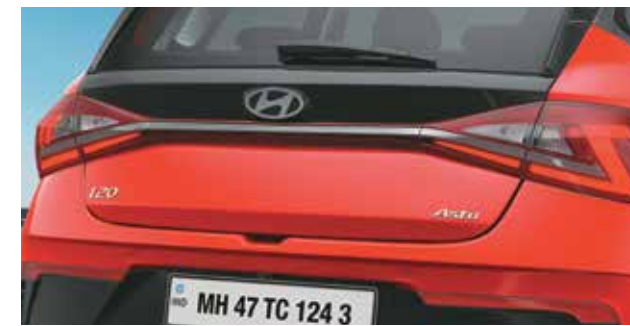
Stylish Z-shaped LED tail lamps