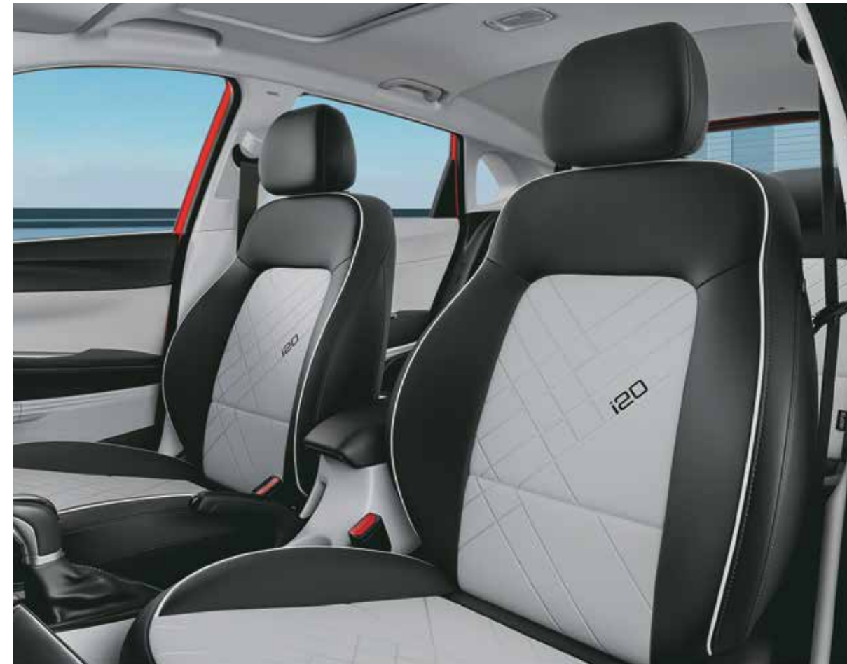
Dual tone seats with i20 branding

The interiors of the new Hyundai i20 mesmerize. Dual tone seats that look fabulous and enough space to lounge out in comfort. Ambient lighting that uplifts your mood and sliding front armrest that provides a more convenient way to relax.