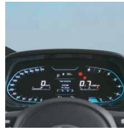
Digital cluster with TFT multi information display

Other features: Superior leg room and thigh support | Sliding front armrest | Leather wrapped steering wheel and gear knob | Metal finish inside door handles