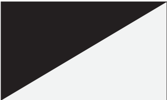
Atlas white with abyss black roof