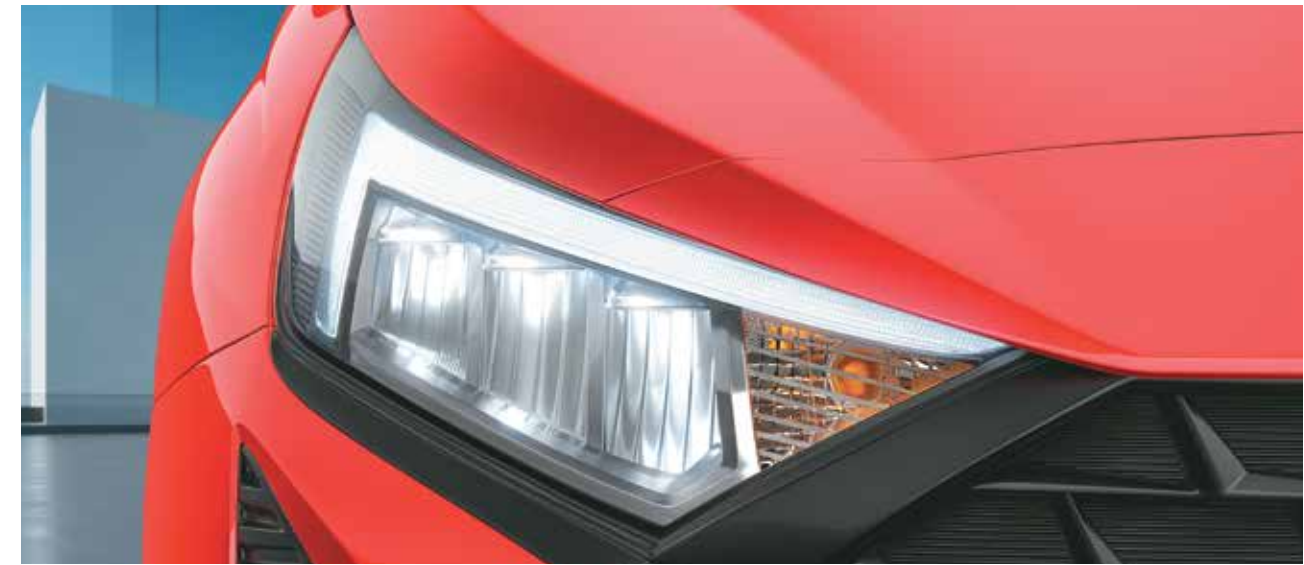
LED headlamps with signature DRLs

The new Hyundai i20 has it all. A sensuous sporty design, a majestic new grille and lights that are a showstopper. Turn heads as you whizz by on those alloy wheels and make an impression with the chrome lines. It's simply stunning from tip to toe.