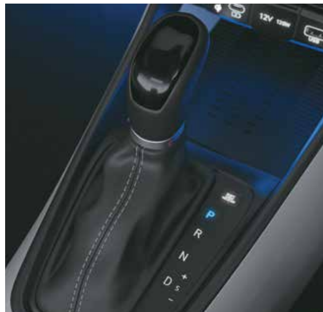
Intelligent variable transmission (IVT)