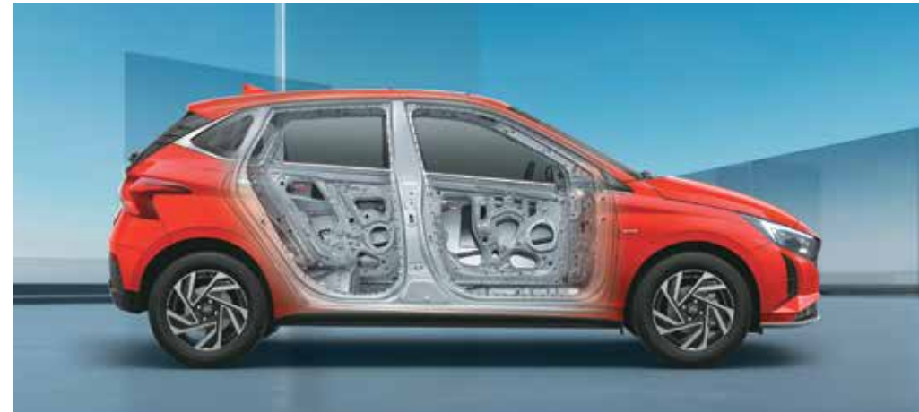
Strong body structure (with AHSS and HSS)