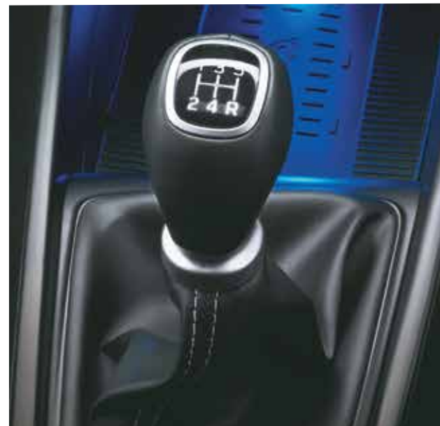
5 speed manual transmission