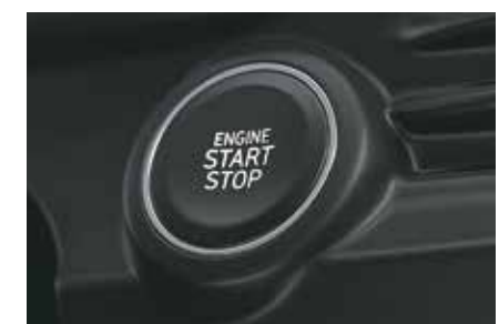
Push button start/stop