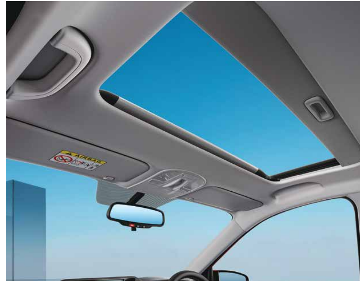
Voice enabled electric sunroof