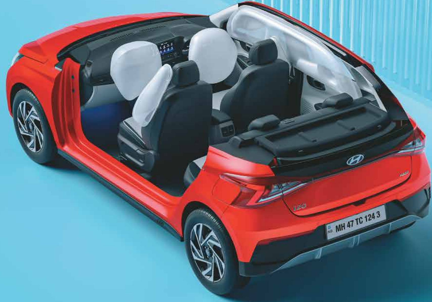
6 airbags standard (Best in segment)