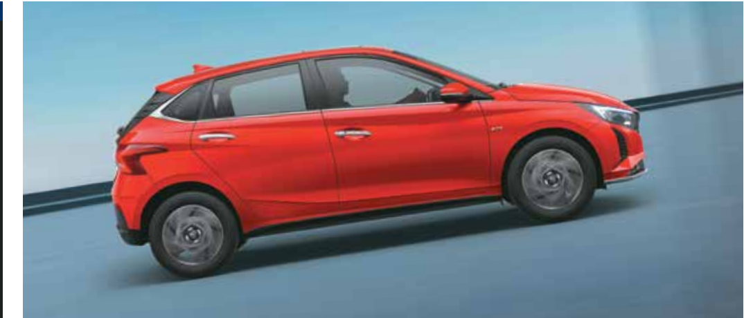
Hill-start assist control (HAC)