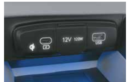
Fast USB charging (Type C)