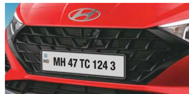
Parametric jewel pattern grille