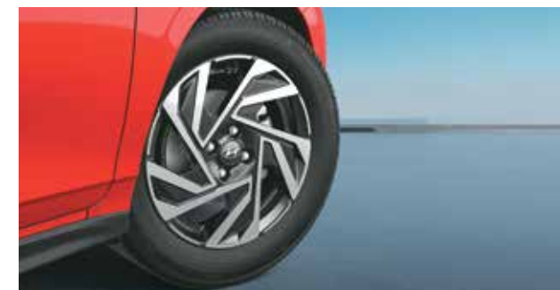
R16 (D=405.6 mm) diamond cut alloy wheels