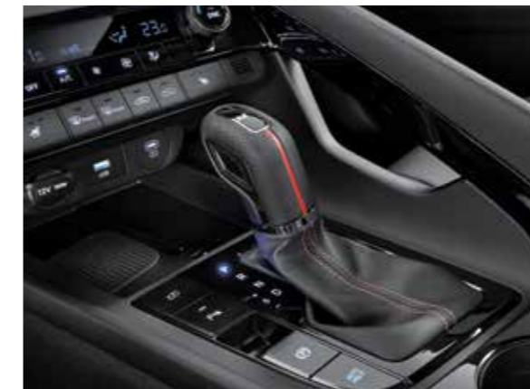
N Line Exclusive Sports Steering Wheel with Extended Paddle Shifters N Line Exclusive Leather Gear Knob