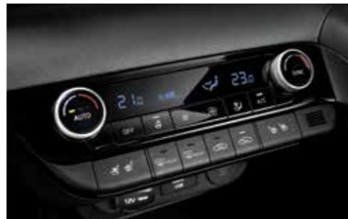
Dual Full Auto Air Conditioner