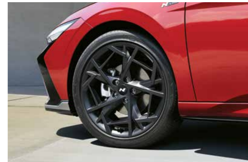
N Line Exclusive 18-inch Alloy Wheels and Tires