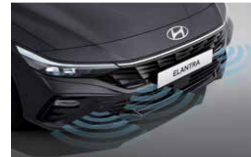
Parking Distance Warning (Forward/Reverse)