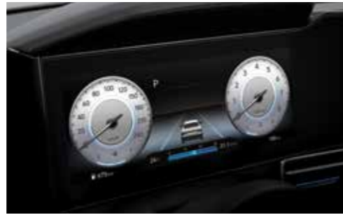
Cluster (10.25-inch color LCD)