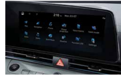
10.25-inch Navigation Display