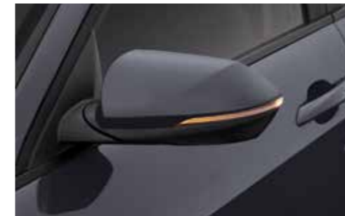
Exterior Sideview Mirrors (heated, power folding, LED turn signal indicators)