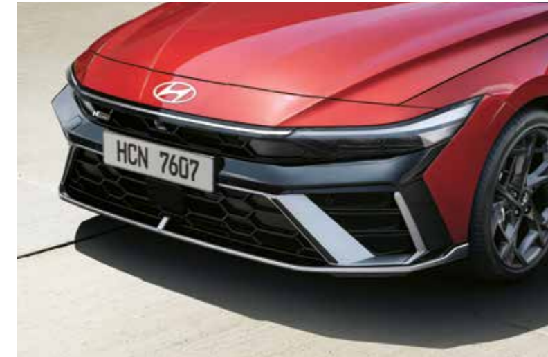
N Line Exclusive Front Bumper