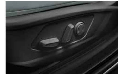
Power Driver's Seat (8-way, lumbar support)