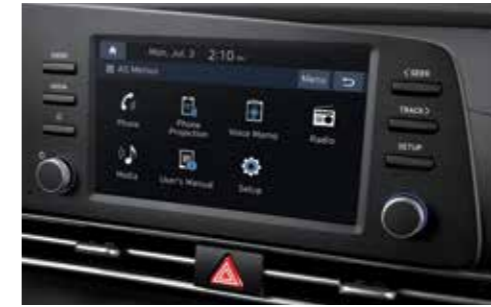
8" Display Audio System (matt, when selecting 4.2" color LCD cluster display)