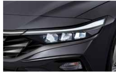
Full LED Headlamps (MFR type)