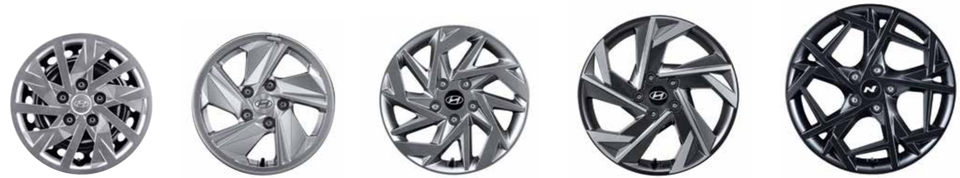
15" Steel Wheel & Wheel Cover 15" Alloy Wheel 16" Alloy Wheel 17" Alloy Wheel 18" Alloy Wheel(N Line)