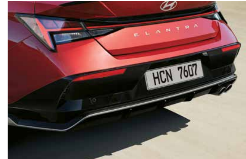
N Line Exclusive Rear Bumper