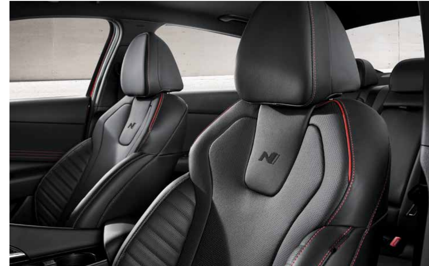
N Line Exclusive Authentic Leather Seats