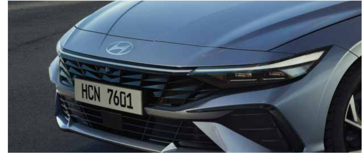
Thin-type Full LED Headlamp