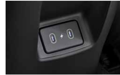
USB-C type Charger (2nd Row)