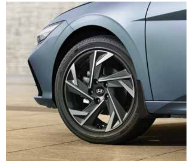
17" alloy wheels & tires