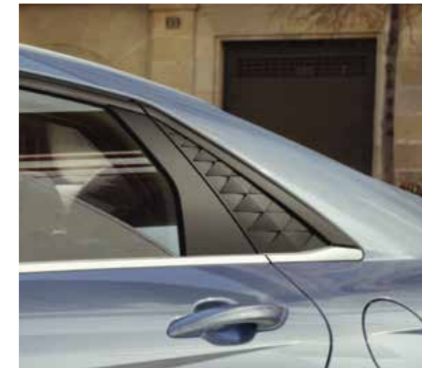
Quarter Glass Cover