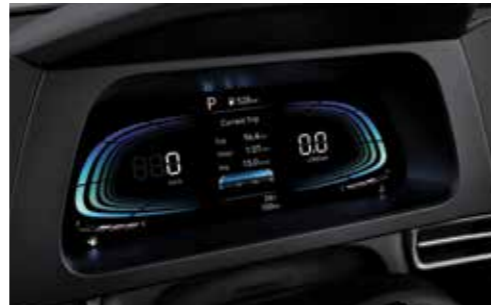
Cluster (4.2-inch color LCD)