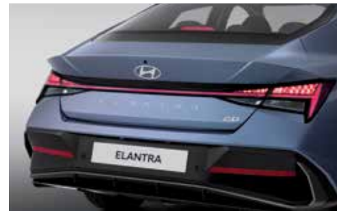
LED Rear Combination Lamps