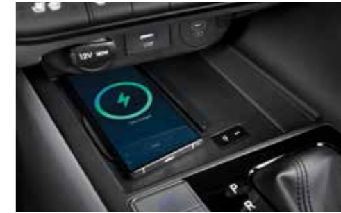
Wireless Smartphone Charger