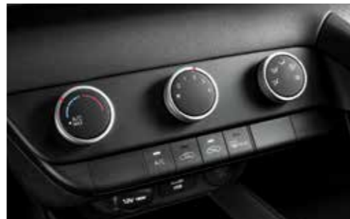
Manual Air Conditioner