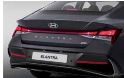
Bulb Rear Combination Lamp