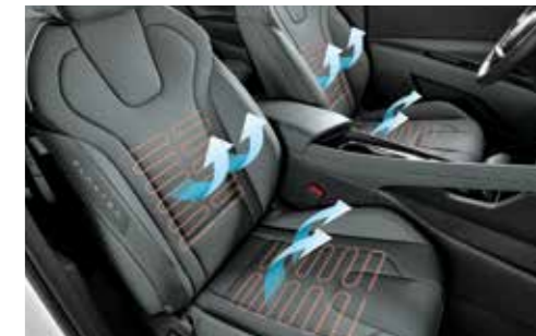
Heated & Ventilated Seats (1st Row)