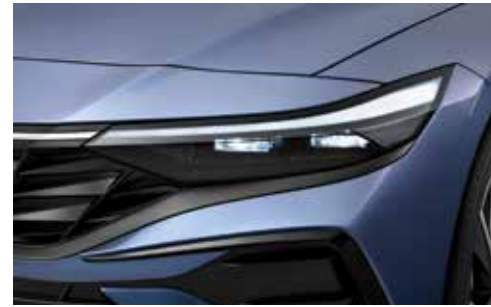
Thin-type Full LED Headlamps