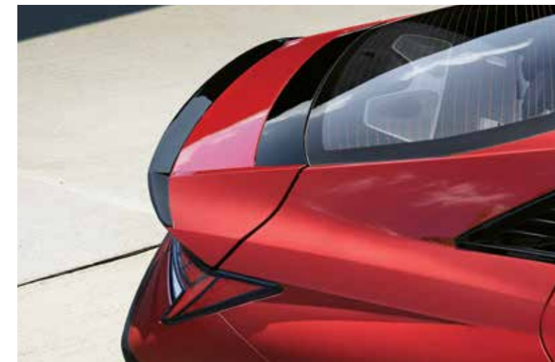
N Line Exclusive Lip-type Rear Spoiler