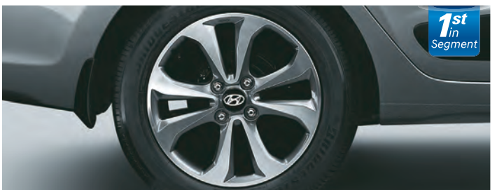
R15 Diamond Cut Alloy Wheels