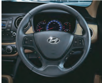
Steering Mounted Controls