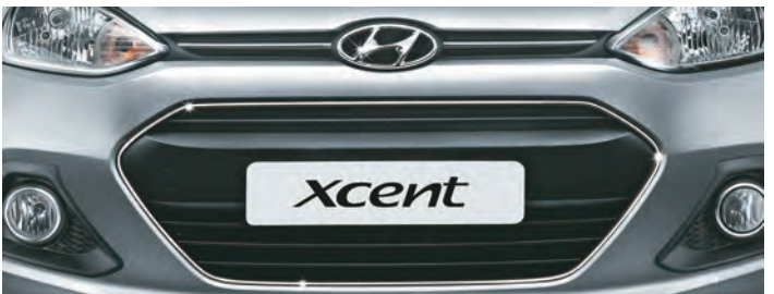
Chrome Radiator Grille and Air Dam