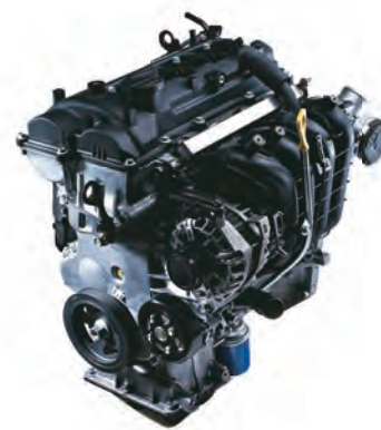
1.1L 2nd Gen U2 CRDi Diesel Engine