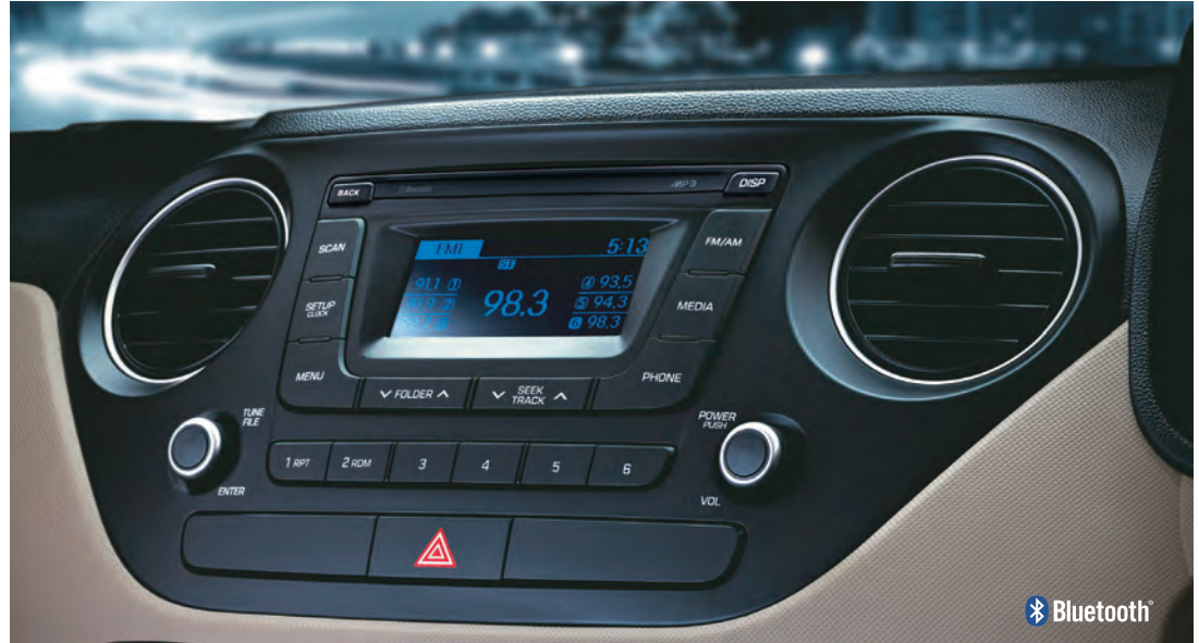
2 DIN Audio With 1st In Segment 1 GB Internal Memory

When it comes to comfort and convenience, expect the unexpected. Stuffed with features unique to its segment, Xcent makes your journeys more enjoyable and unforgettable.