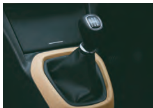
5-speed Manual Transmission

The Hyundai Xcent offers an exciting blend of performance and efficiency with the 1.1 U2 diesel engine and the highly acclaimed 1.2 Kappa Dual VVT petrol engine with 5-speed manual gear boxes. The 1.2 Kappa petrol engine also offers the option of a 4-speed automatic transmission.