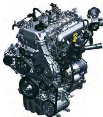
1.2L Kappa Dual VVT Petrol Engine