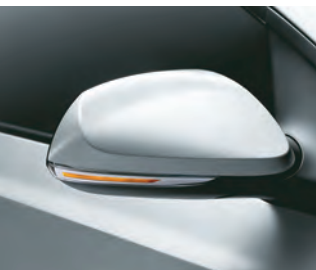
Outside Mirror With Turn Indicator