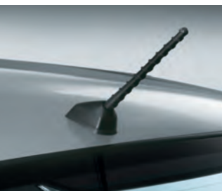
Micro Roof Antenna