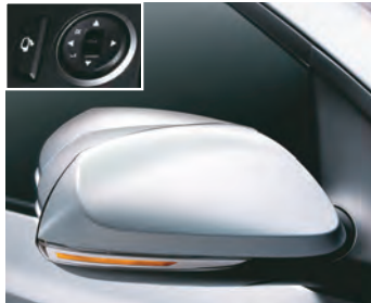
Electrically Foldable Outside Mirrors