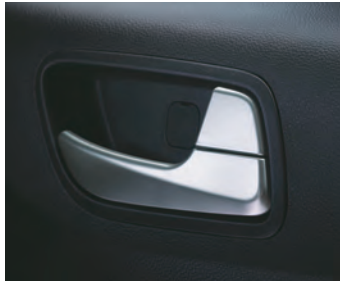
Impact Sensing Auto Door Unlock