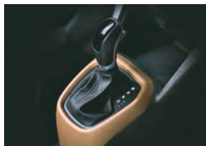
4-speed Automatic Transmission