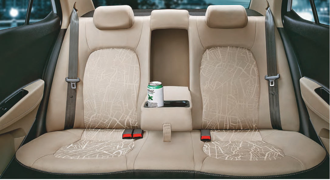
Rear Seating With Centre Arm Rest

Xcent is a perfect blend of style and practicality. Multiple storage options, best-in-segment boot space and optimum seating arrangement make it the real family sedan. Its ergonomically positioned controls, generous legroom and headroom provide unmatched comfort.