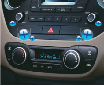
Fully Automatic Temperature Control (FATC) With Cluster Ionizer