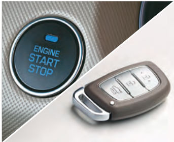
Smart Key With Push Button Start/Stop