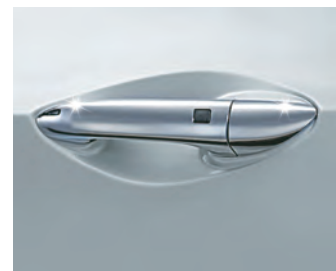
Chrome Door Handle