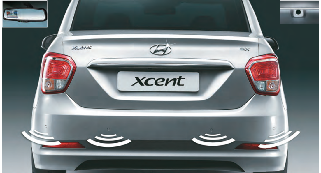
Rear Parking Assist System (Rear Parking Camera and Reverse Sensors)