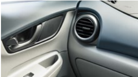
Two-tone interior 8