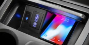
Wireless charging pad 7