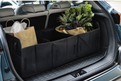
Cargo organiser 5

From roof racks to cargo liners, there's a suite of practical, and stylish Hyundai Genuine Accessories 1 to match.