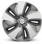
17" alloy wheels