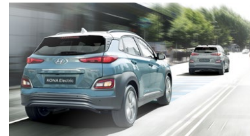
Forward Collision-Avoidance Assist (FCA)

When driving at a speed of above 30km/h the BCW function will alert the driver to vehicles that enter the blind spot, including during lane changes. If the driver proceeds to activate the corresponding indicator lights, a flashing visual warning is provided and an audible alert is sounded.