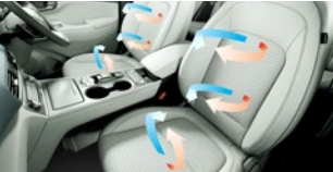
Heated and air ventilated front seats