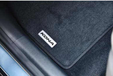
Tailored carpet floor mats