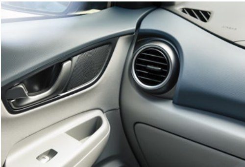
Top: Bridge-type centre console 3 Bottom: Two-tone interior (stone-grey/blue) 4