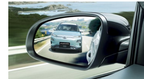
Blind-Spot Collision Warning (BCW)

Maintains the speed set by the driver while keeping a safe distance from the car in front. After stopping, if the car in front departs within 3 seconds, it automatically continues to control the speed and distance.