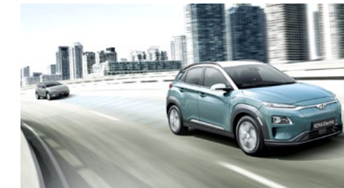
Smart Cruise Control with Stop & Go (SCC)

Detects reckless or fatigued driving to help prevent potential accidents. If the system detects inattentive driving patterns, an audible sound and message on the display panel will bring this to the driver's attention.