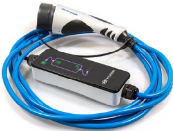
Emergency Charging Cable

Charging speed: Normal Connection to car: Type 2 Estimated charge times: Approx. 9 hours 35 minutes (full 100% charge) 1