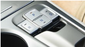
Shift By Wire (SBW)