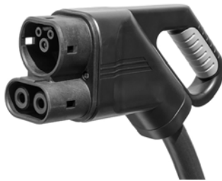
DC Charger (CCS Combo 2)

The multimedia touchscreen includes a scheduled charging function so you can capitalise on off-peak electricity rates. It gives you complete control over when you charge and for how long. This way, you can manage your own time and budget. There's also the option to disable the function temporarily if needed.