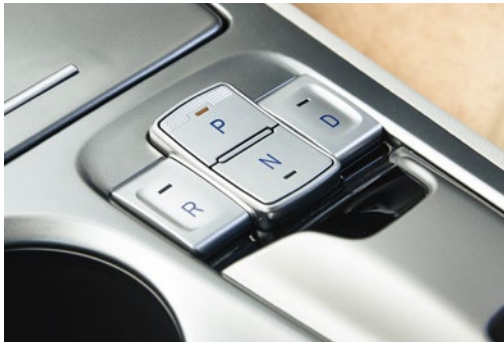
Top: Heated and air ventilated front seats 1 Bottom: Shift By Wire (SBW)