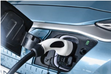
7-Pin Type 2 Cable 9 .