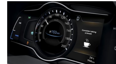
Driver Attention Warning (DAW)

Detects reckless or fatigued driving to help prevent potential accidents. If the system detects inattentive driving patterns, an audible sound and message on the display panel will bring this to the driver's attention.