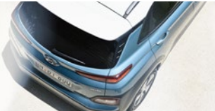
Two-tone roof 1