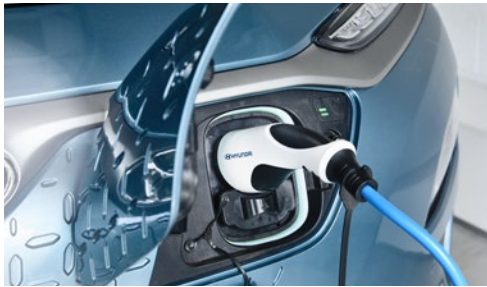
Standard household socket charging.

The Kona Electric is capable of utilising a commercial DC fast charging station with a maximum charging capacity of 100kW. It can recharge to 80% in 54 minutes 2 when connected to a 100kW DC station or in 75 minutes 2 when connected to a 50kW station. You can use your multimedia touchscreen to find the nearest DC fast charging station 3 .