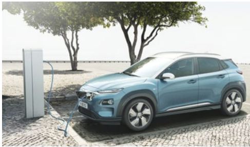
DC fast charging station.

The Delta In-Home charger is an optional accessory wall unit sold separately and is available to purchase from any Hyundai Blue-Drive dealership. This home charger improves charge times by utilising a high amperage power supply. It takes approximately 9 hours and 35 minutes for a full charge 1 .