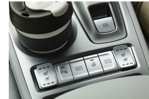
Drive modes – Eco, ECO+, Comfort & Sport 2

1. 449km: Figure based on WLTP (Worldwide Harmonised Light-Duty Vehicles Test Procedure) static laboratory combined average city and highway cycle test, which measure, energy consumption, range and emissions in passenger vehicles, designed to provide figures closer to real-world driving behaviour. Real life driving results will vary depending on a combination of driving style, type of journey, vehicle configuration, battery age and condition, use of vehicle features (such as heating and air conditioning), as well as operating, environmental and climate conditions. 2. Highlander variant shown.