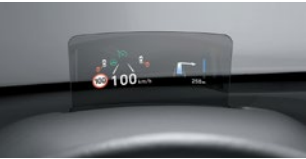
Head-Up Display (HUD)