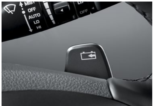
Paddle shifters – regenerative braking control