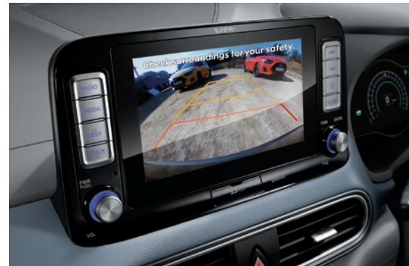
Rear view camera 3

It includes: Blind-Spot Collision Warning (BCW), Driver Attention Warning (DAW), Forward Collision-Avoidance Assist (FCA), High Beam Assist (HBA) 2 , Lane Keeping Assist (LKA), Rear Cross-Traffic Collision Warning (RCCW) and Smart Cruise Control (SCC) with Stop and Go.