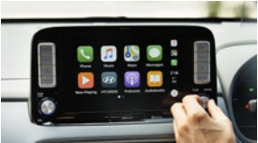
8" multimedia touchscreen