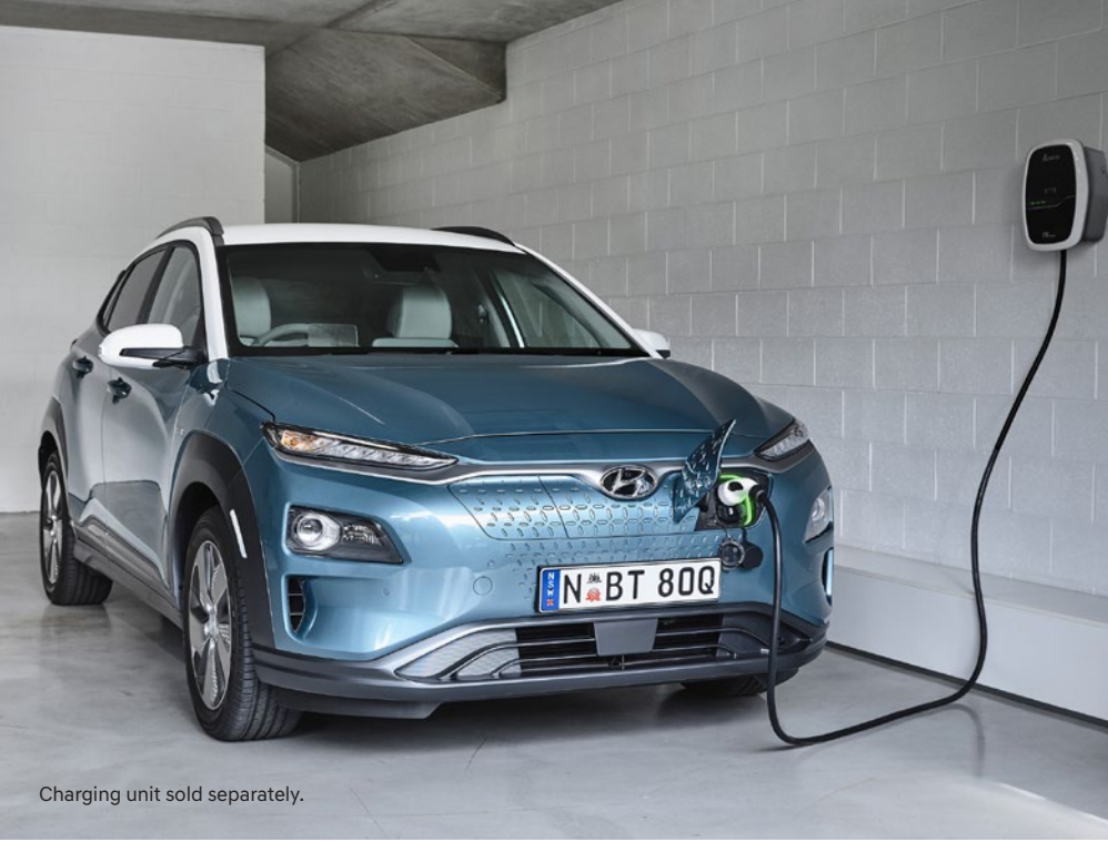
Charging unit sold separately.