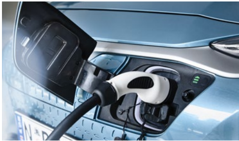
Home charging station.

The Delta In-Home charger is an optional accessory wall unit sold separately and is available to purchase from any Hyundai Blue-Drive dealership. This home charger improves charge times by utilising a high amperage power supply. It takes approximately 9 hours and 35 minutes for a full charge 1 .