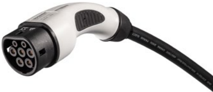
AC Charger (Type 2)

Charging speed: Rapid Connection to car: CCS Combo 2 Estimated charge times (to 80% charge) 2 : 50kW: 54 minutes 100kW: 75 minutes