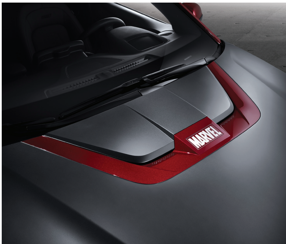
V-shape hood bevel with Marvel logo