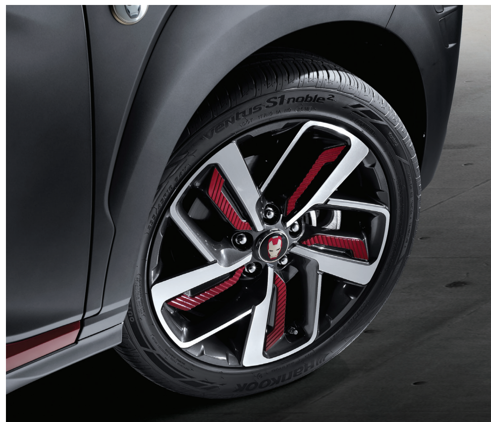
Iron-grip dual-tone 18-inch alloy wheels