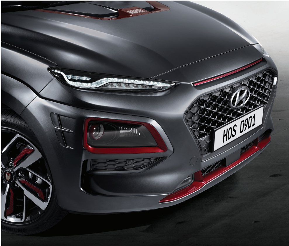
Iron Man Exosuit cues throughout, on front and rear bumpers, dark chrome grille, headlight bezels, LED Daytime Running Lights

Matte metallic gray body color is matching the original Iron Man suit when the character first appeared in 1963 in the Marvel Comics series “Tales of Suspense.” The shade of red used for the most recent Iron Man suit was applied as a point color for the vehicle.