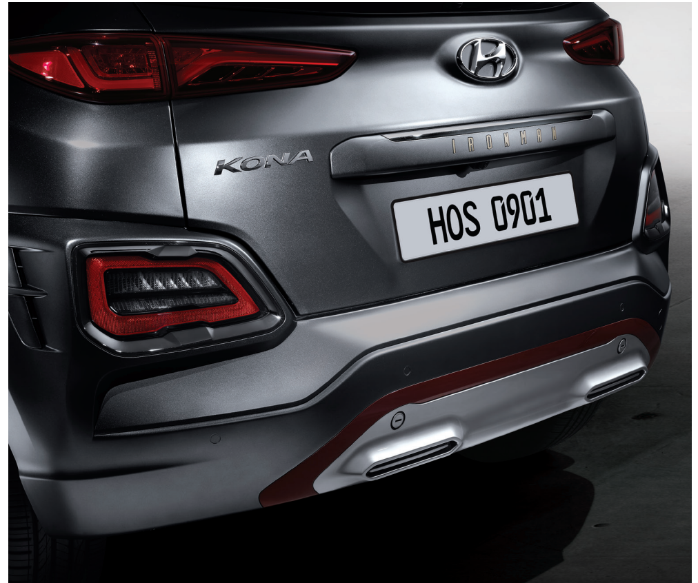
Rear garnish with Iron Man letter emblem & red two-tone skid plate