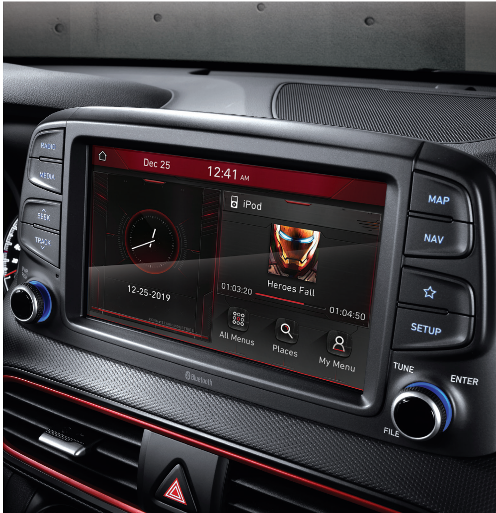
Stark Industries-branded 8-inch color touchscreen navigation interface

The Kona Iron Man Edition features both exterior and interior design elements that closely resemble and give a nod to the dynamic Iron Man suit.