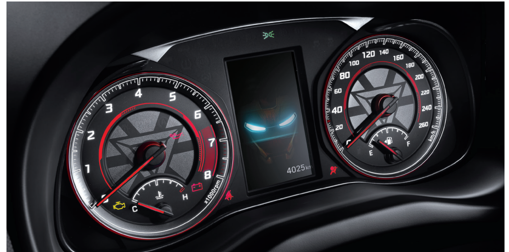
Specially designed 4.2-inch color Multi-Information Display (supervision) Jarvis inspired Heads-up Display startup animation