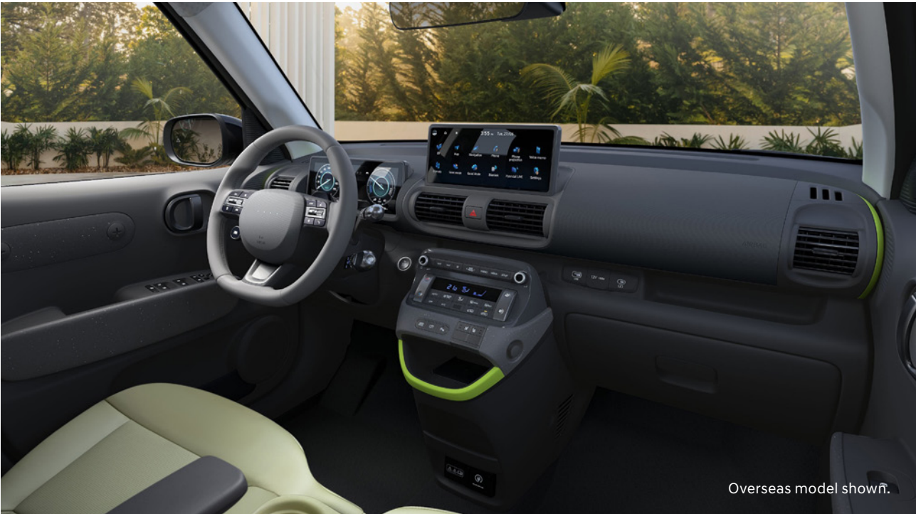
Overseas model shown.