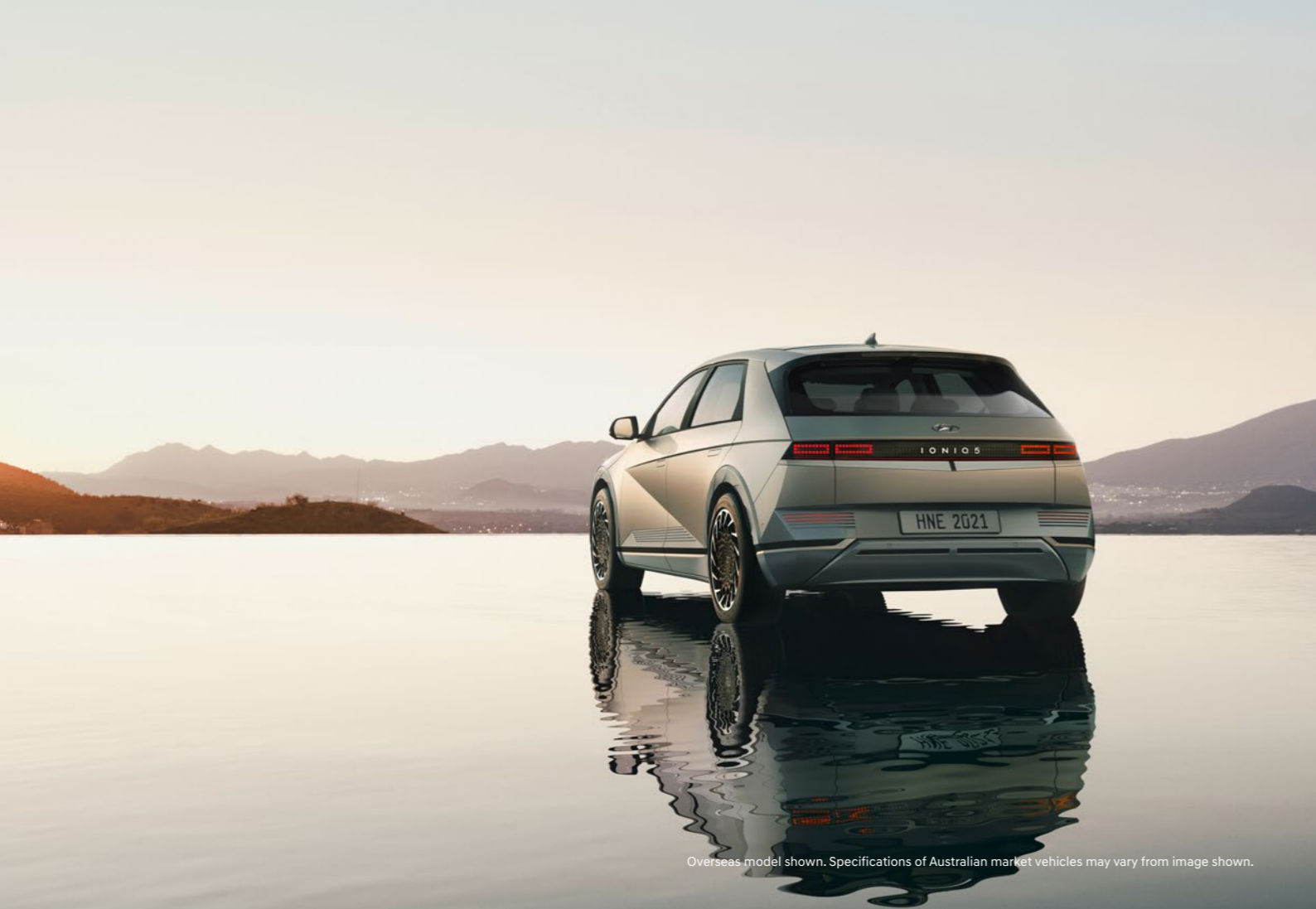
Overseas model shown. Specifications of Australian market vehicles may vary from image shown.