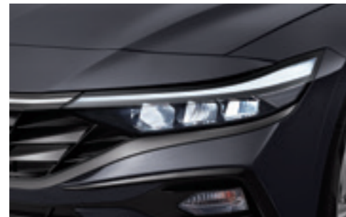
Full LED Headlamps (MFR type)