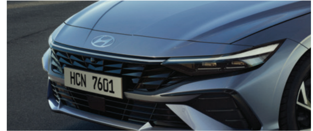
Thin-type Full LED Headlamp