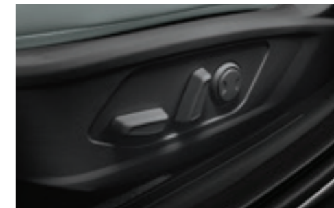
Power Driver's Seat (8-way, lumbar support)