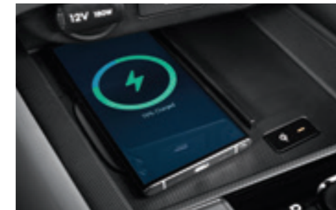
Wireless Smartphone Charger