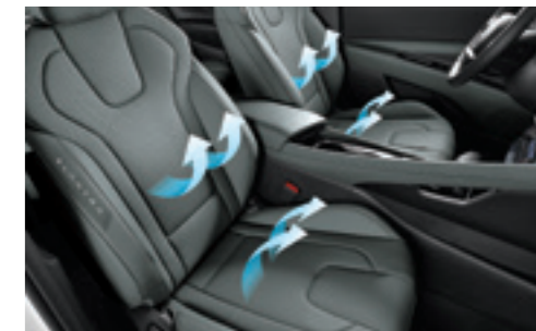
Ventilated Seats (1st Row)