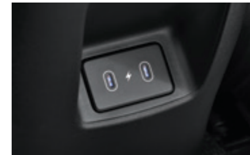
USB-C type Charger (2nd Row)