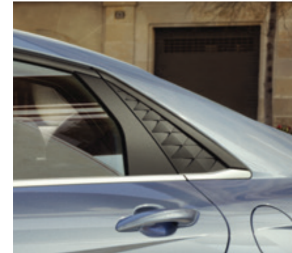
Quarter Glass Cover