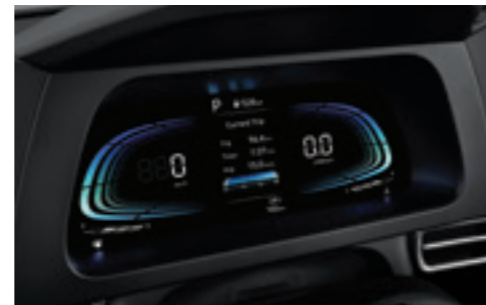
Cluster (4.2-inch color LCD)