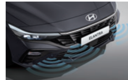
Parking Distance Warning (Forward/Reverse)