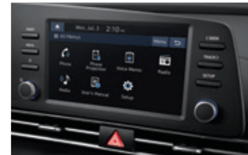
8" Display Audio System (matt, when selecting 4.2" color LCD cluster display)