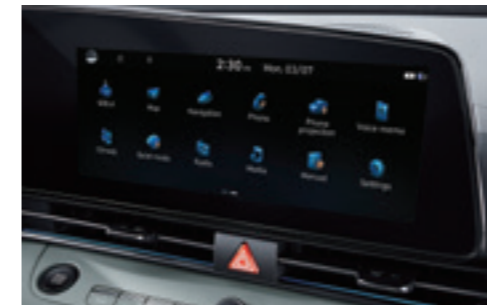
10.25-inch Navigation Display