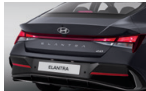
Bulb Rear Combination Lamp