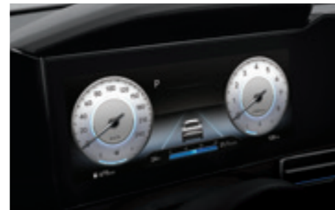
Cluster (10.25-inch color LCD)