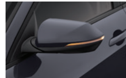
Exterior Sideview Mirrors (heated, power folding, LED turn signal indicators)