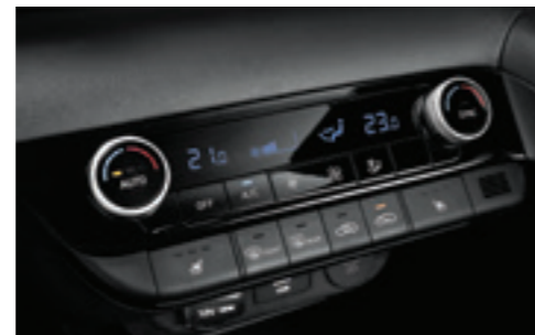
Dual Full Auto Air Conditioner