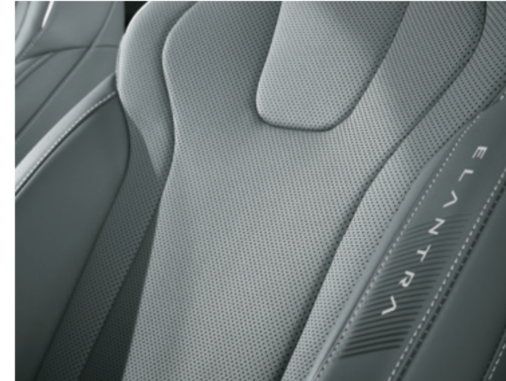
Eco-friendly Artificial Leather Seat

Passenger side crash pad garnish and upper door trim feature premium materials.