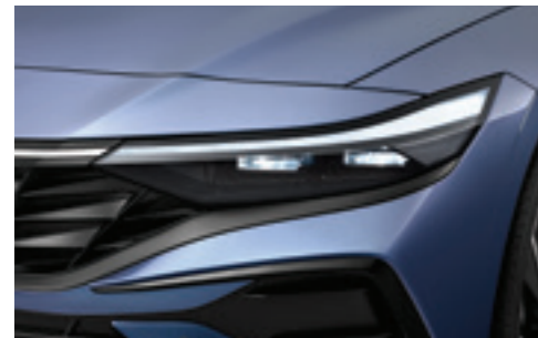
Thin-type Full LED Headlamps