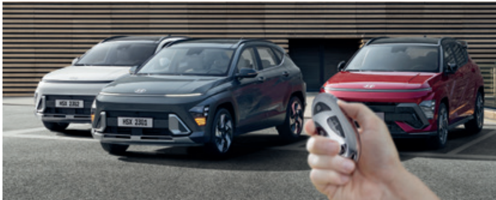
Remote Smart Parking Assist (RSPA)