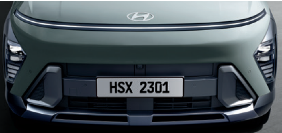
Front seamless horizon lamp, front bumper

The clean nose of KONA emphasizes its pure volume and boosts aerodynamic performance, with the dynamic character line adding contrast to its parametric surface.