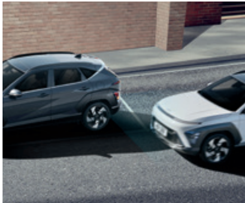
Blind-Spot Collision-Avoidance Assist (BCA)