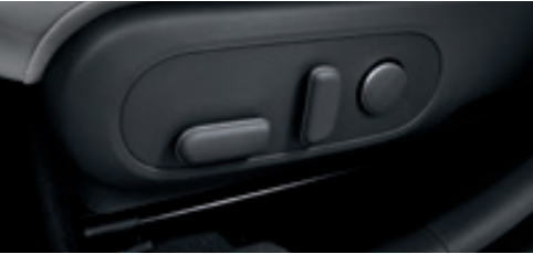
Powered driver seat