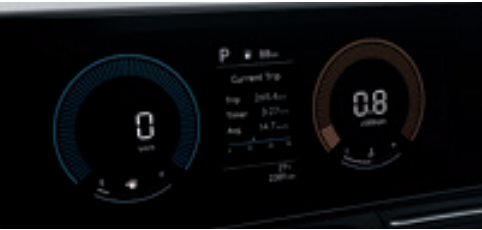
Cluster display (4-inch color LCD)