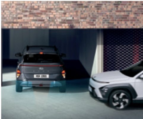
Forward / Side / Reverse Parking Distance Warning (PDW)