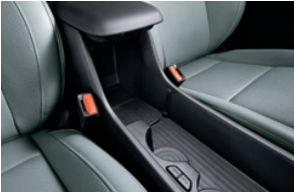
Open console storage (removable bulkhead / rotational cup holders)