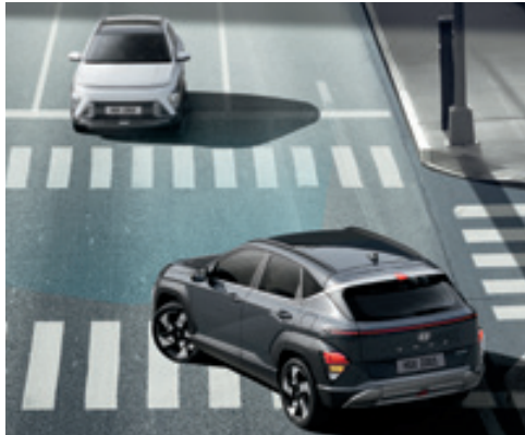
Forward Collision-Avoidance Assist 1.5 (FCA 1.5)