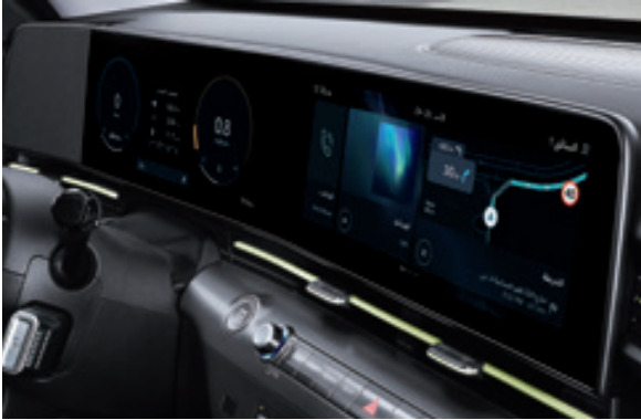
Panoramic display - 12.3-inch integrated dual screen display