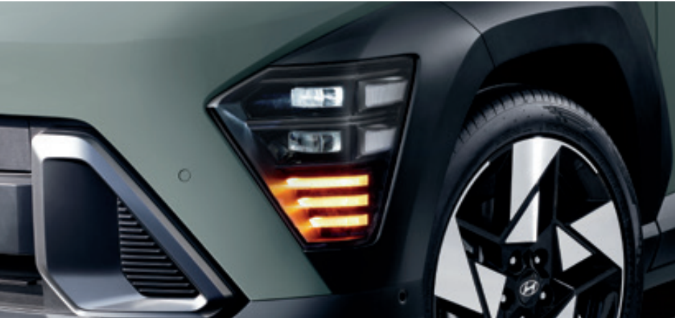
Full LED headlamps (projection type)