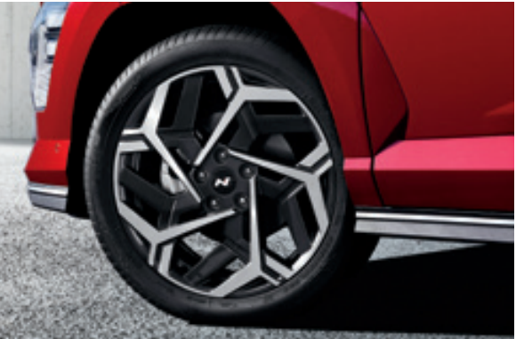
N Line-exclusive 19-Inch alloy wheels / Body-colored cladding