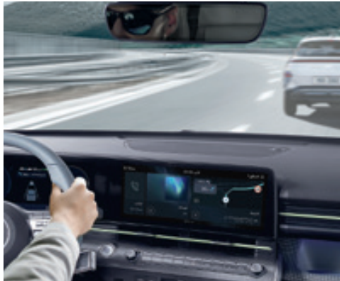
Smart Cruise Control (SCC)