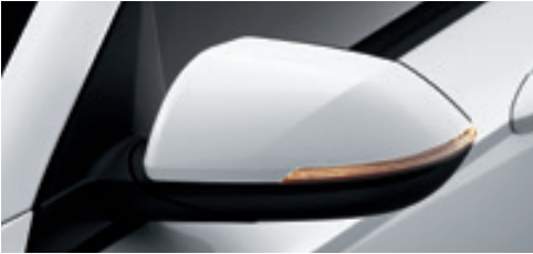
Outside mirror (Heated / Folding / Turn signal indicator LED)