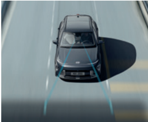
Lane Keeping Assist (LKA)