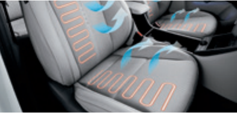
Heated & Ventilated front seats