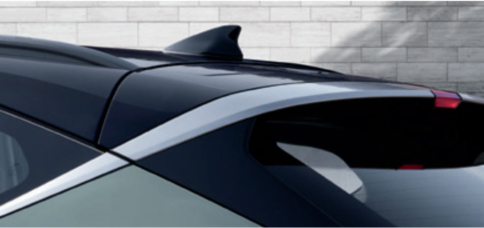
Dual tone roof, sharp connecting chrome line