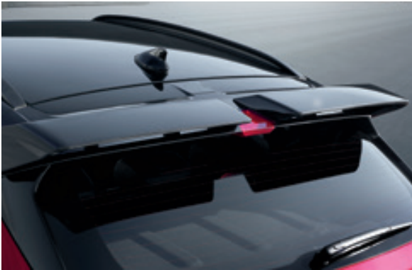
N Line-exclusive wing-type rear spoiler