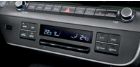
Full auto air conditioning system