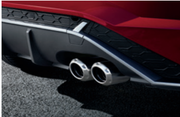
N Line-exclusive single twin tip muffler