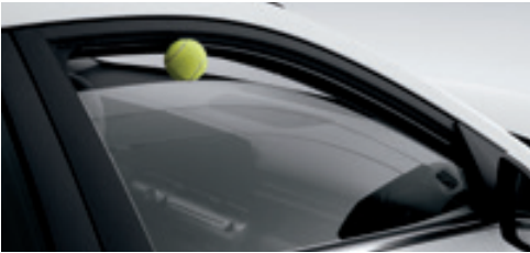
Safety power window