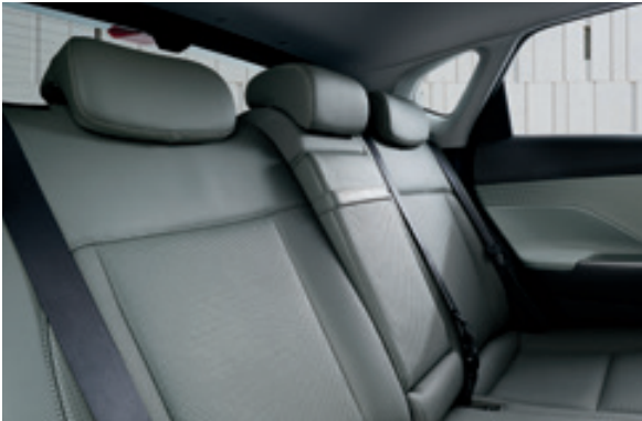
2nd-row seatback 2-step latch

KONA's interior is practical and spacious, with a focus on the comfort of rear passengers and ample luggage space to cater to different lifestyles.