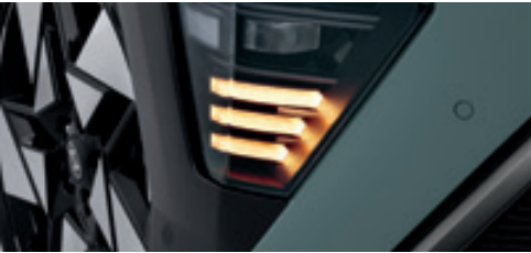
LED turn signal indicators (front/rear)