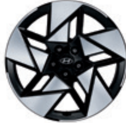
19" Alloy wheels