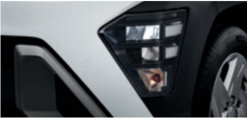
LED Headlamps (MFR)