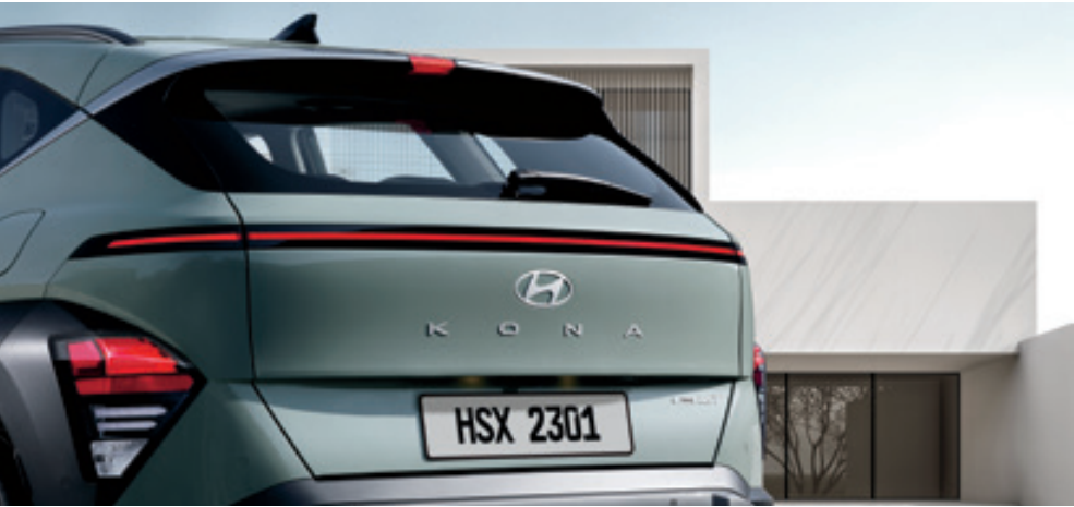
Spoiler Integrated HMSL, rear seamless horizon lamp, LED brake lamps, LED turn signal lamps