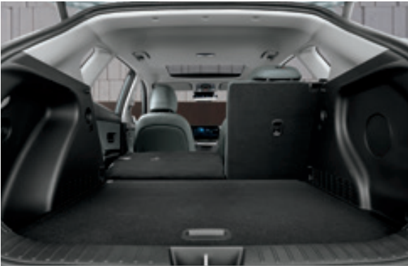
6:4 folding 2nd row seat backs