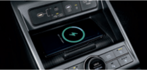
USB-C Data/Charging ports /Wireless charging pad