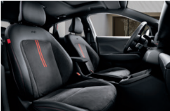
N Line-exclusive authentic leather / Alcantara combination seats