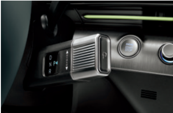
Column-Type Shift by Wire (SBW)