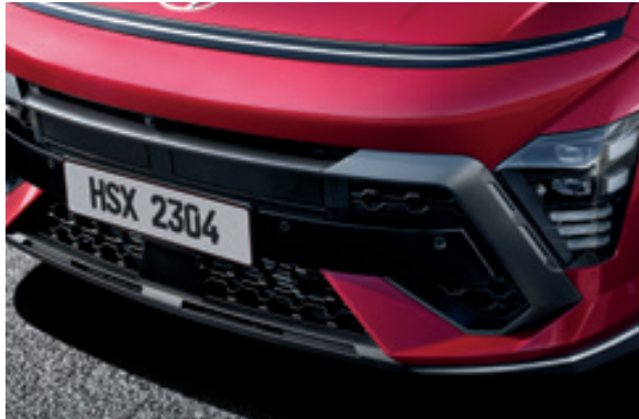
N Line-exclusive front bumper & bumper skirt

The N Line exudes boldness and dynamism, featuring a high-performance exterior design inspired by the renowned high-performance N.