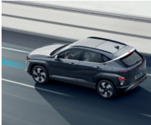
Lane Following Assist (LFA)