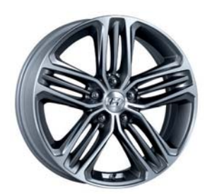
8" allov wheels