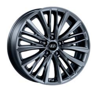
10" allow whools