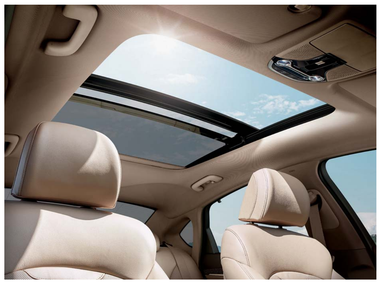
Prime Nappa leather seats Leather-wrapped door trim