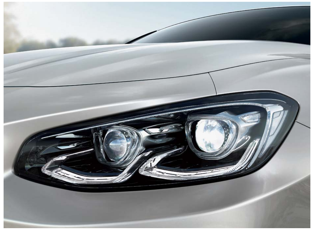
Full LED headlamps