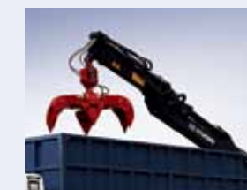
Large Capacity Crane (Include Grapple)