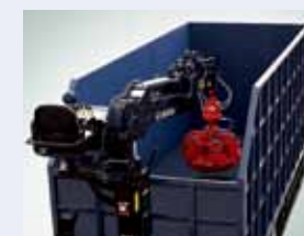
High Tension Steel Plates