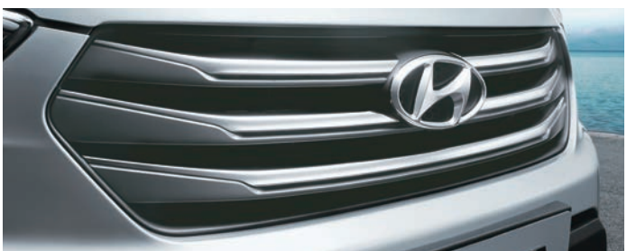
Triple Slat Chrome Radiator Grille

Shark Fin Antenna | Chrome Finish Outside Door Handles