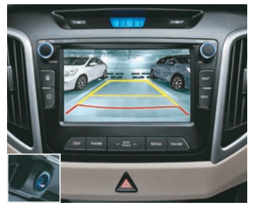
Rear Parking Assist System