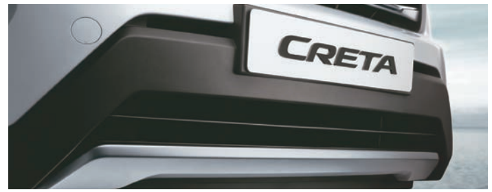
Sporty Front and Rear Skid Plates