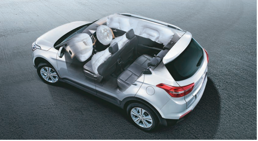
Six Airbags (Driver, Passenger, Side & Curtain)

CRETA is designed to keep you safe on the roads. Its strong HIVE body structure, along with top-of-the-line active & safety features, ensure enhanced stability, smoother ride & handling and better driving dynamics.