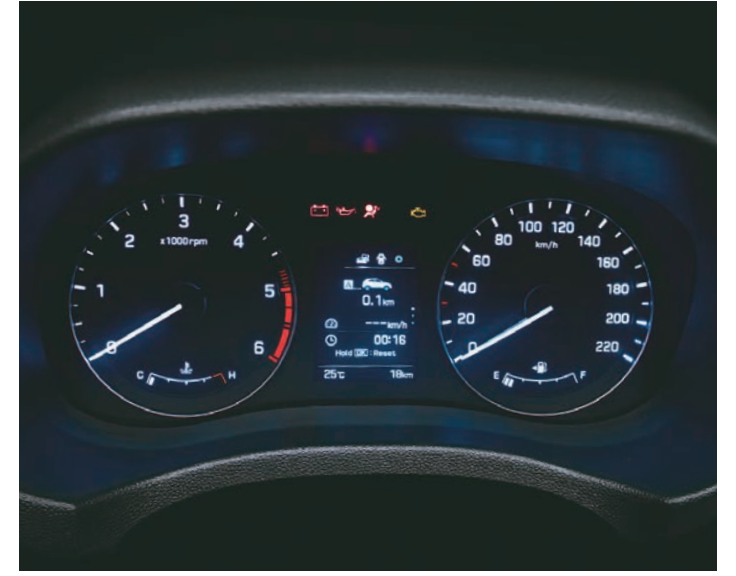
Advanced Supervision Cluster

Experience a world of ultimate luxury and comfort as you step inside the CRETA. Designed to give you unparalleled convenience and space, it boasts of the most enviable interiors in the category.