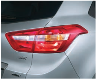
Sleek and Premium Split-type Tail Lamps R17 Diamond Cut Alloys