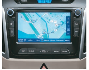
7.0 Touchscreen Audio Video Navigation System