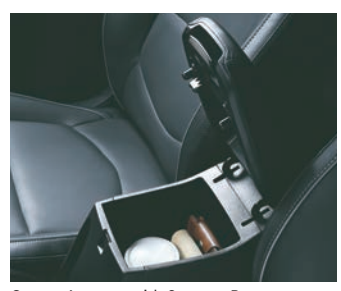
Centre Armrest with Storage Box