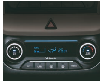
Fully Automatic Temperature Control (FATC) with mood change bar