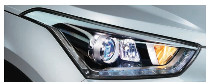
Bi-functional Projector Headlamps with LED Positioning Lamps