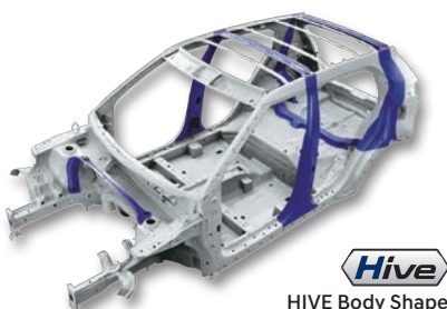
denotes structural strength stability and connotes sturdiness.