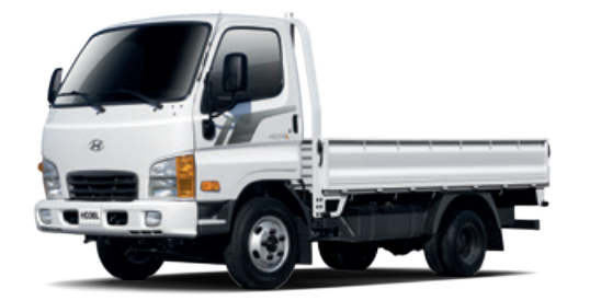
NW (Noble White)