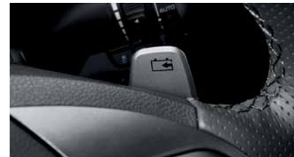
Paddle shifters (regenerative brake control) 軌盤撥片(電力回收程度操作)