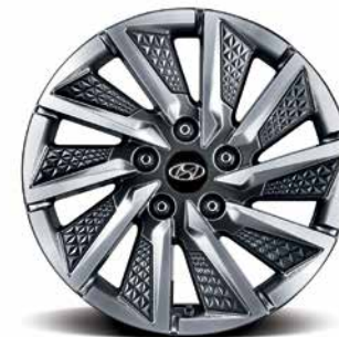
16" alloy wheels