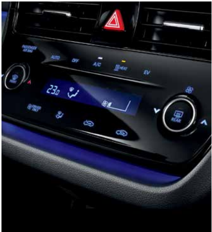
Touch control climate system 輕觸式冷氣調控