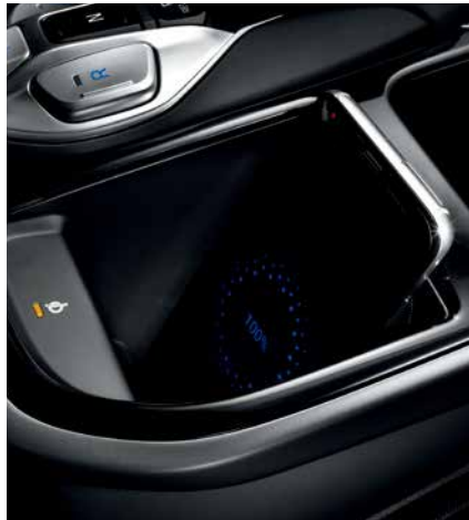
Smartphone charging system 手機無線充電