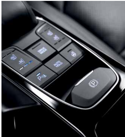
Electronic parking brake 電子泊車手制