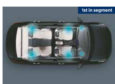
Arkamys premium sound with front tweeters, front & rear speakers

Other features: Leather* upholstery | Rear center armrest with cup holder | Rear manual curtain | Leather* wrapped steering wheel | Leather* wrapped gear knob Cruise control | Rear AC vents | Front & rear USB charger | Front & rear adjustable headrest | Smart key with push button start / stop Driver rear view monitor 1st in segment | Eco coating technology 1st in segment | Luggage hook & net 1st in segment