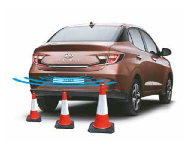
Rear parking camera with display on 20.25 cm screen

Other features: Speed sensing auto door lock | Impact sensing auto door unlock