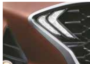
Twin boomerang LED DRLs