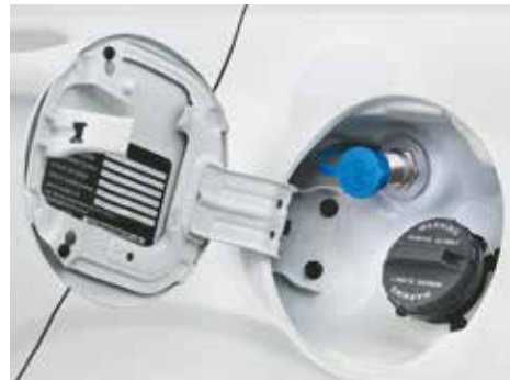
Convenient CNG filling valve location near petrol fill area