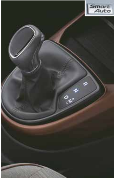
AMT in petrol & diesel

Buckle up for an exciting driving experience. The all-new Aura comes power packed with unrestrained power in various configurations under its hood.