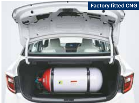
CNG boot space