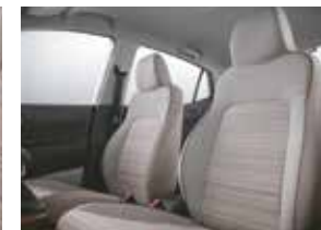
Dual tone grey interiors