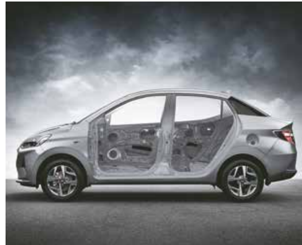
Strong body structure 65% (AHSS + HSS)