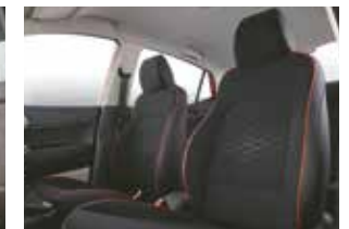
Sporty black interiors with red inserts in turbo variant

Other features: Rear AC vents | Glovebox cooling | Leather wrapped gear knob 1st in segment