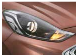
Swept back projector headlamps