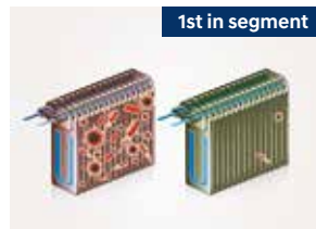
Eco coating technology