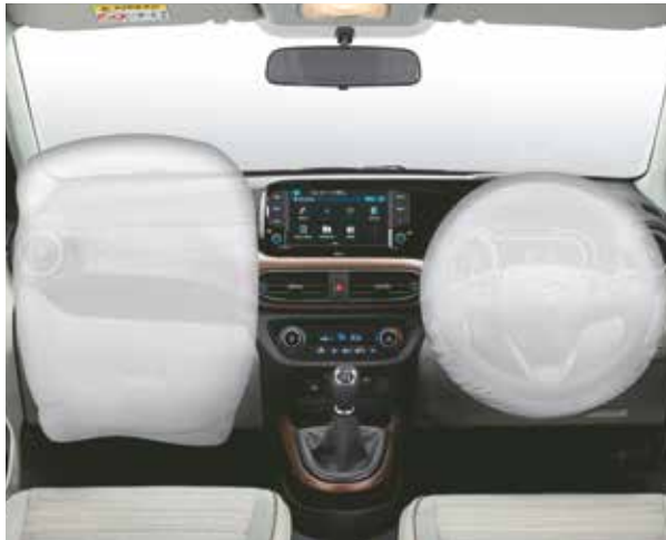
Driver and passenger airbags