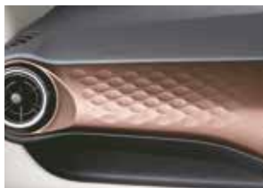
Satin bronze crash pad for premium appeal