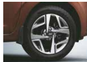
Sporty diamond cut alloy wheels