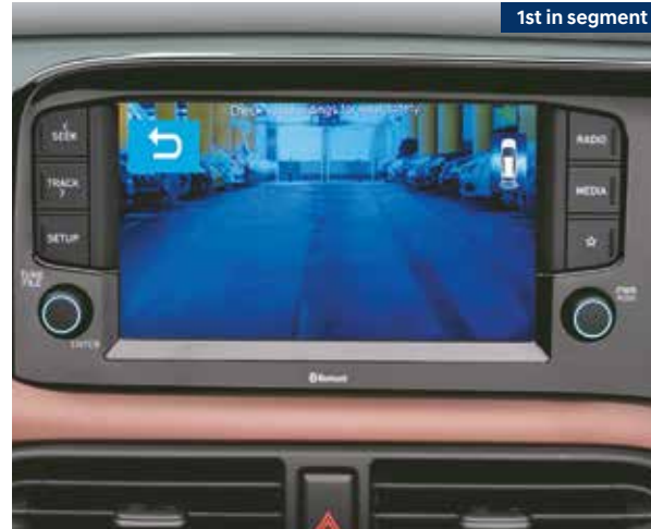
Driver rear view monitor (DRVM)