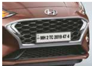
Satin silver front grille design