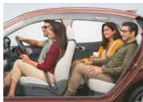
Superior cabin space with ample legroom & thigh support