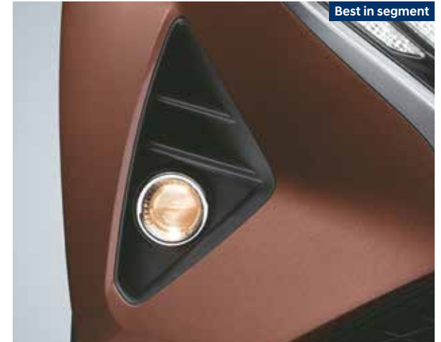
Projector fog lamps with chrome surround