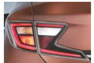
Stylish Z shaped LED tail lamps

Other features: B-pillar blackout | Turn indicators on outside mirrors | Air curtain 1st in segment | Shark fin antenna Chrome outside door handles 1st in segment | Body coloured bumpers and outside door mirrors