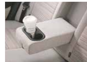
Rear center armrest with cup holder