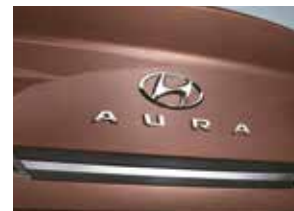
Rear chrome garnish with unique center spread branding