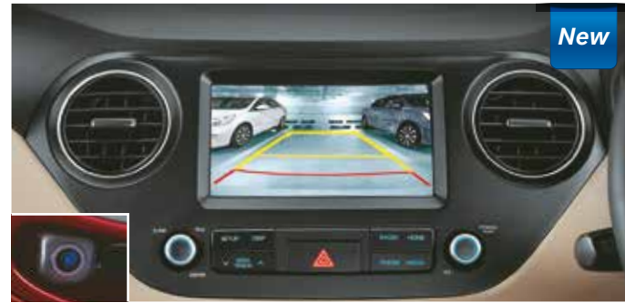
Rear Parking Assist System (with display on 17.64 cm Audio Screen)