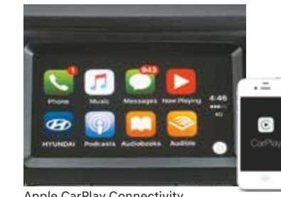
Apple CarPlay Connectivity