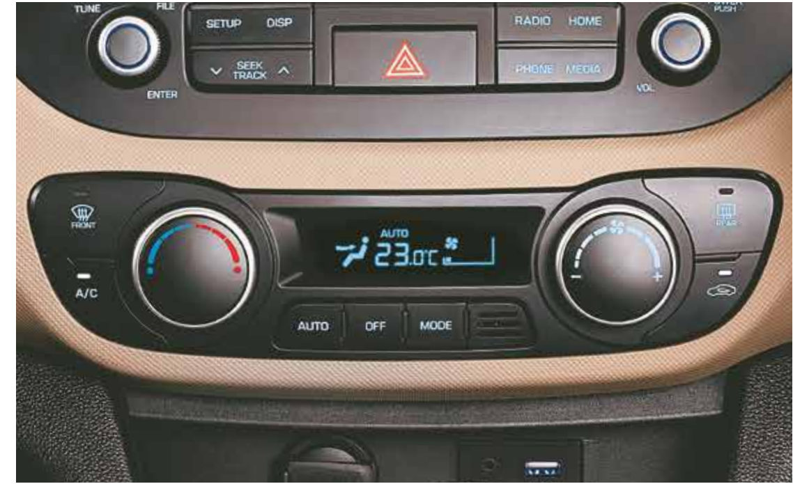
Fully Automatic Temperature Control