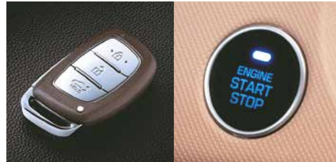
Smart Key with Push Button Start-Stop