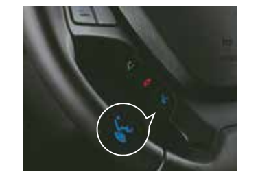
Voice Recognition Button on Steering