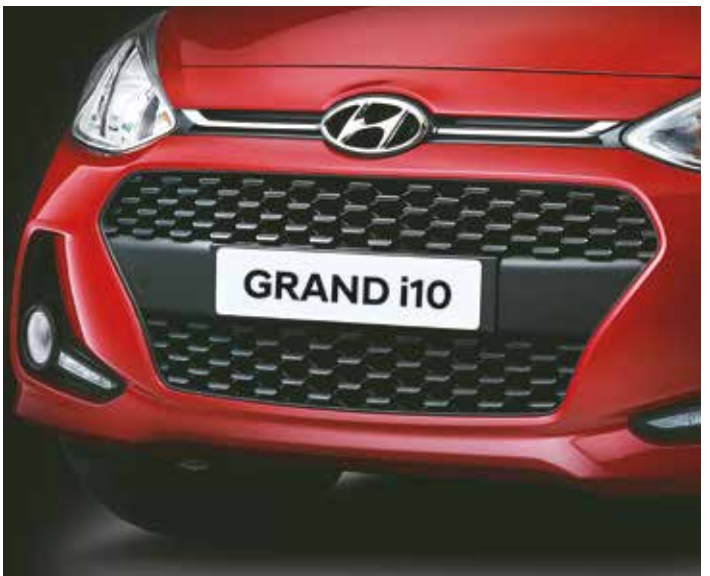
Cascade Design Grille - Bold New Design Identity