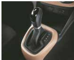
4-speed Automatic Transmission