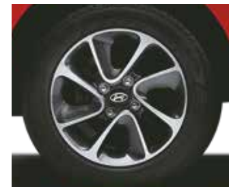
Diamond-cut Alloy Wheels