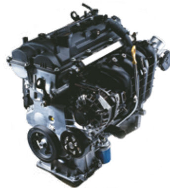
1.2l Kappa Dual VVT Petrol Engine