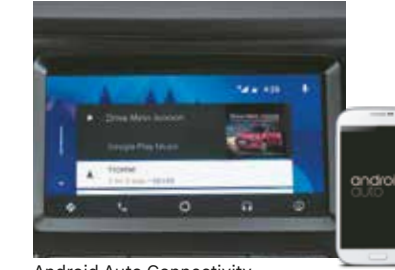
Android Auto Connectivity