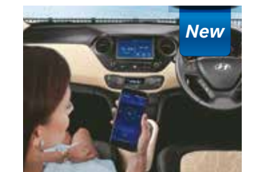
Hyundai iBlue Smart Phone App for Audio Remote Control*