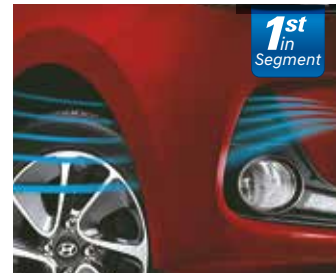
Front Air Curtains