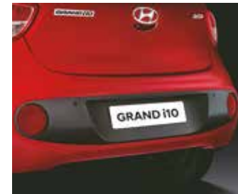
Dual Tone Rear Bumper