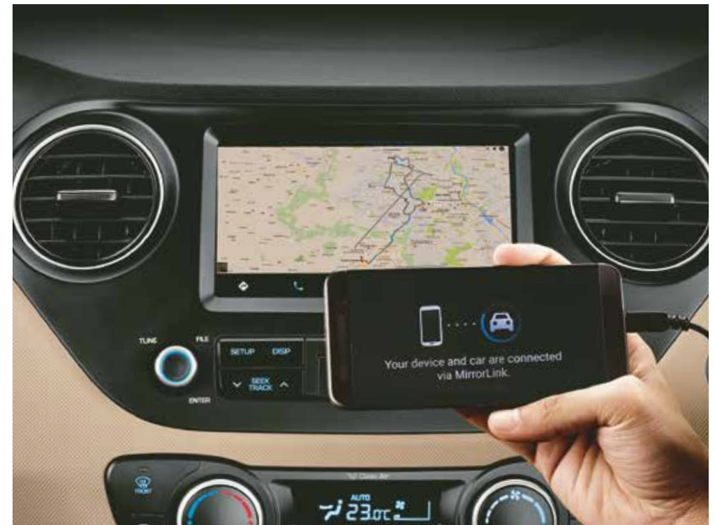
Mirror Link | Smart Phone Navigation

The GRAND i10 offers assistive technology at its very best with a class-leading 17.64 cm Touch Screen Audio Video System with smartphone connectivity, voice recognition and navigation support.