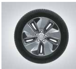
R17 (D=436.6 mm) EV exclusive alloy wheels