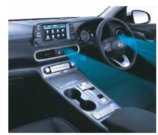
Option of driver only air conditioning

Other features: Bridge-type centre console | Leather wrapped steering wheel | LED luggage lamp Leather seats | Rear adjustable headrests | Rear split seats 60:40 | Soft touch dashboard