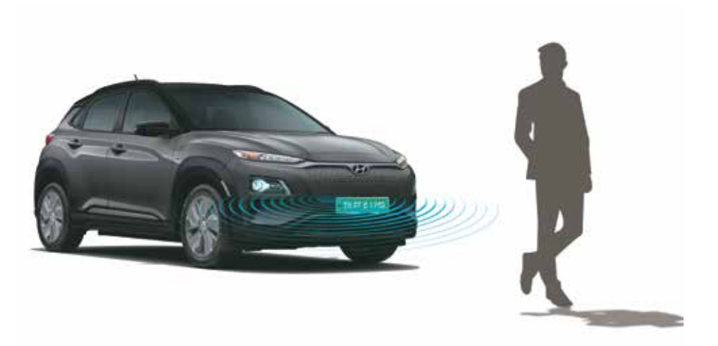
Virtual engine sound system When the vehicle is in motion, VESS generates an engine sound to ensure pedestrian safety