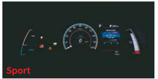
Quicker acceleration for spirited driving