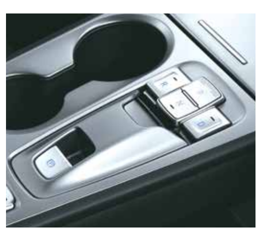
Shift-by-wire automatic transmission and electric parking brake

The second you get into 2022 Hyundai Kona Electric, you enter the heart of unmatched comfort. Intelligently placed button type shift-by-wire system, impeccably designed bridge-type centre console; everything has been designed and positioned to make your driving experience as smooth as possible.