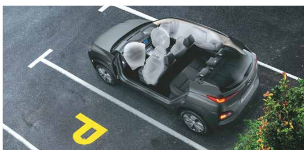
6 Airbags (driver, passenger, front side & curtain)

2022 Hyundai Kona Electric comes with superior safety features to keep you out of harm's way. Made of ultra-high tensile strength steel, 2022 Hyundai Kona Electric offers high impact energy absorption that keeps the passengers safe in the unfortunate event of a collision. The cabin has been especially designed to disperse energy to reduce impact on the occupants.