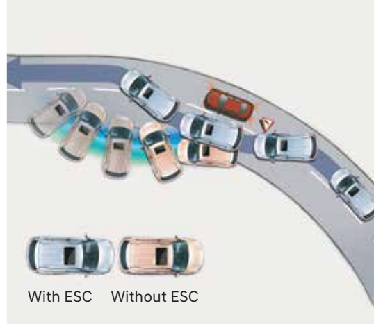
Electronic stability control (ESC)