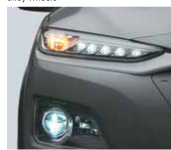
Distinctive split type LED headlamps with LED DRLs