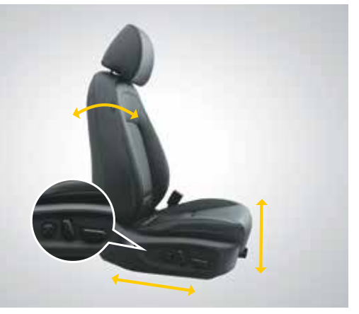
10-way power driver seat with lumbar support