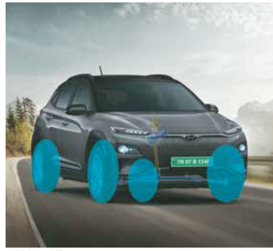
Vehicle stability management (VSM)