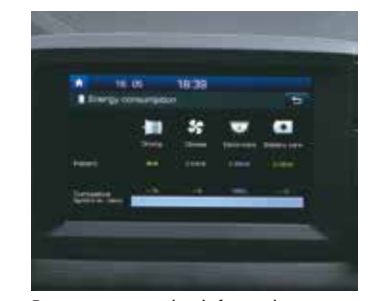
Power consumption information