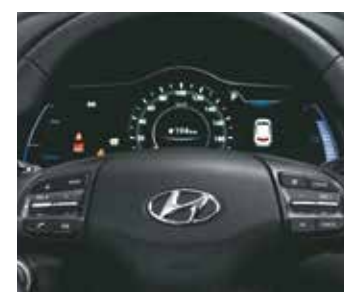
Digital instrument cluster with supervision