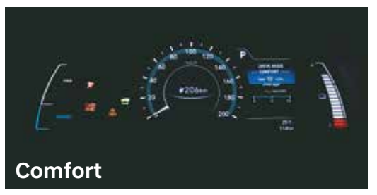
Balanced fuel efficiency and driving performance