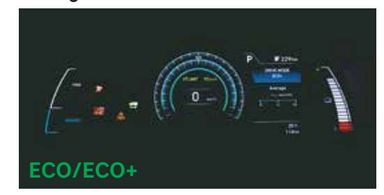
Maximize fuel efficiency through the ultra-energy saving modes