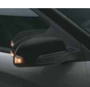
ORVM (heated) with electric adjust and folding