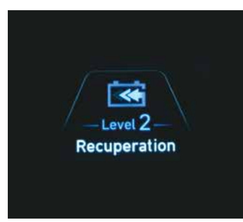
Paddle shifters (for regenerative braking)