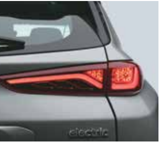
LED tail lamps