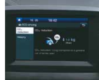
ECO driving information