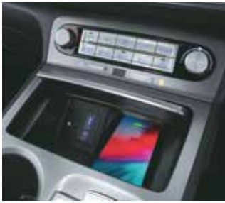
Wireless phone charger