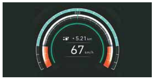
Smart eco pedal guide-encourages fuel efficient driving