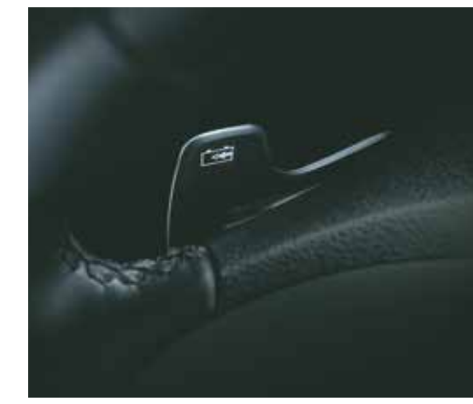
One pedal driving