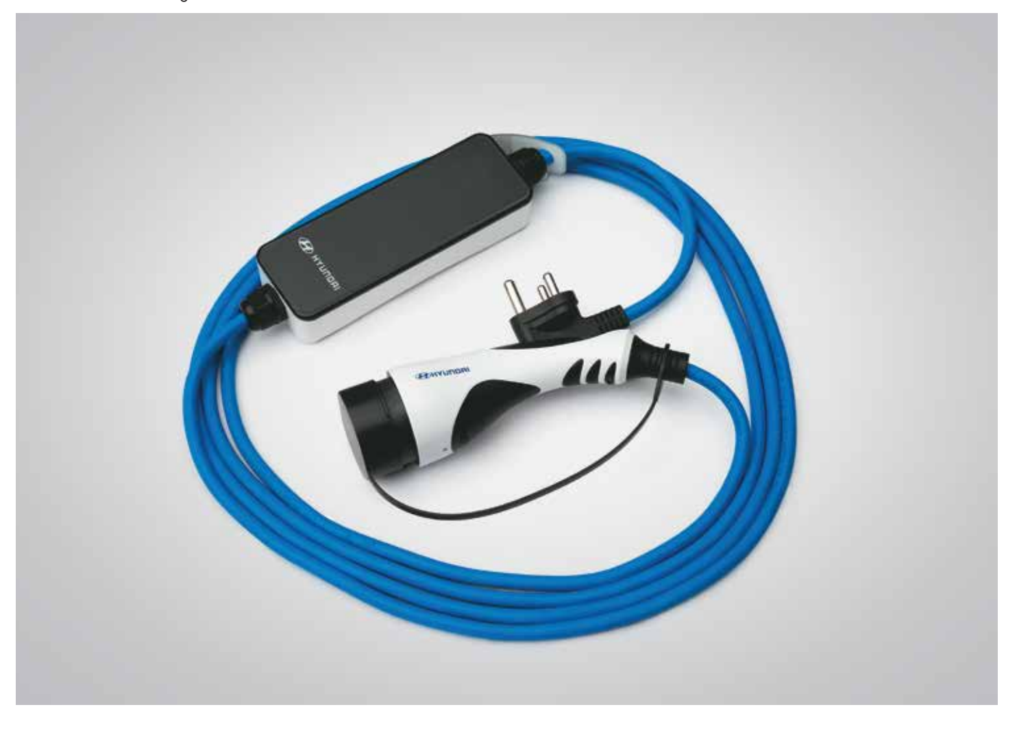
Disclaimer: Depending on the condition of high voltage battery, charger specifications, and ambient temperature, the time required for charging the high voltage battery may vary.

The car is equipped with an in-cable control box (ICCB) that you can plug right into a normal wall socket. It will take 19 h for a full charge.