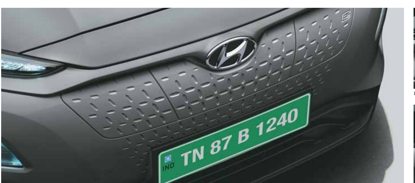
Modern, clean & integrated front grille design optimized for superior aerodynamics