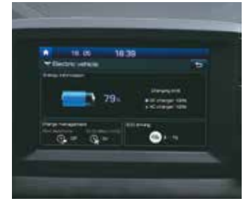
EV menu screens