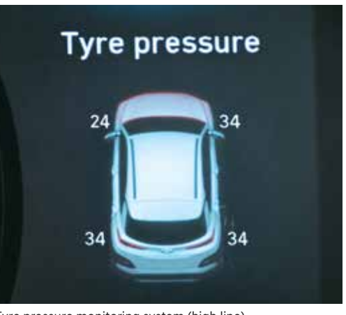
Tyre pressure monitoring system (high line)