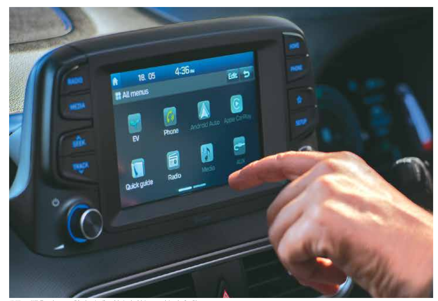
17.77cm (7") Touchscreen Display Audio with Android Auto and Apple CarPlay screen

Get ready for a hassle-free life with 2022 Hyundai Kona Electric that has been created to fit in your world seamlessly. Now you can access your phone, your favourite music and maps, using the multimedia touchscreen display that comes with Apple CarPlay and Android Auto compatibility. To ensure your phone never runs out of battery, there is a wireless charging pad.