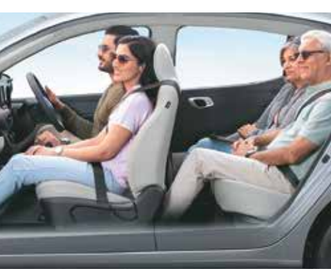
Superior cabin space with ample legroom and thigh support