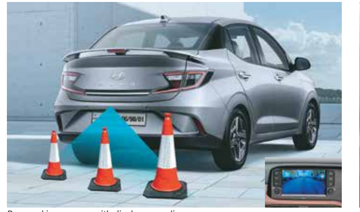
Rear parking camera with display on audio