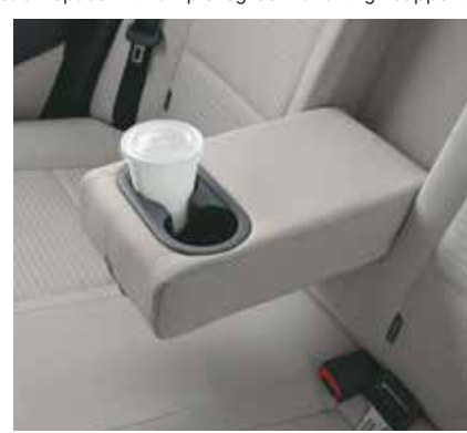
Rear centre armrest with cup holder