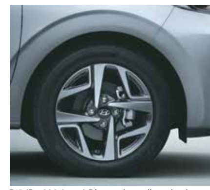
R15 (D = 380.2 mm) Diamond cut alloy wheels