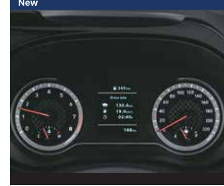
8.89 cm (3.5") Speedometer with multi information display