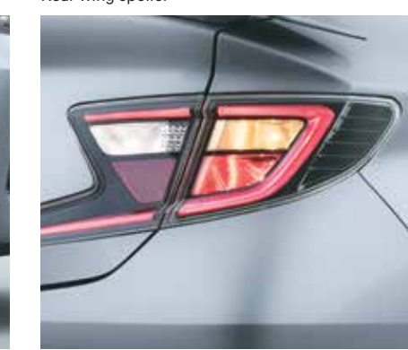
Stylish Z shaped LED tail lamps