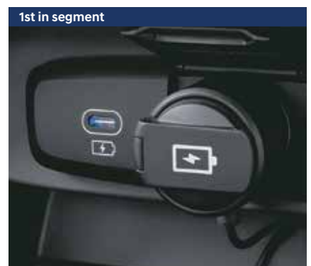
Fast USB charger (Type C)

The interior of the new Hyundai AURA combines modern aesthetics with contemporary craftsmanship. It is meticulously designed to optimise the space to give the occupants more room and make long journeys as comfortable as short hops across the city.