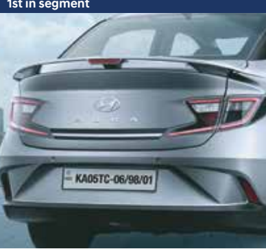
Rear wing spoiler