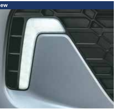
LED daytime running lamps (DRLs)