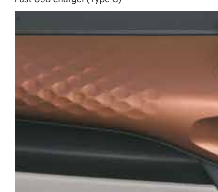
Premium honeycomb patterned crashpad