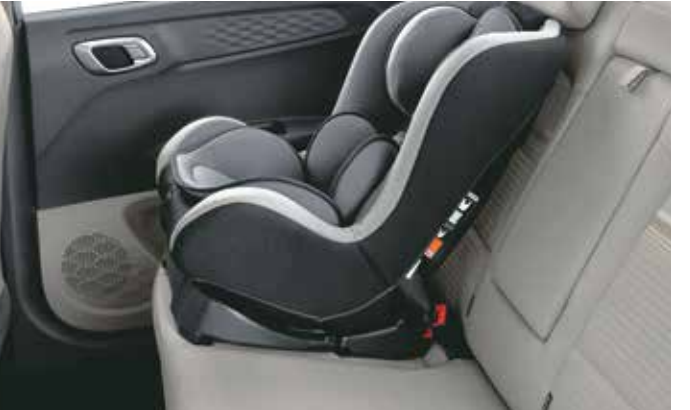
Child seat anchor (ISOFIX)