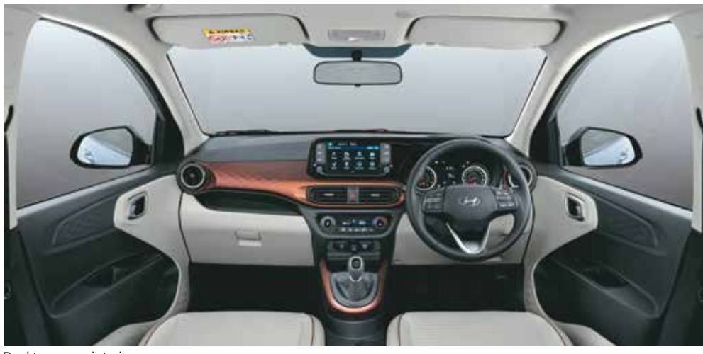
Dual tone grey interior