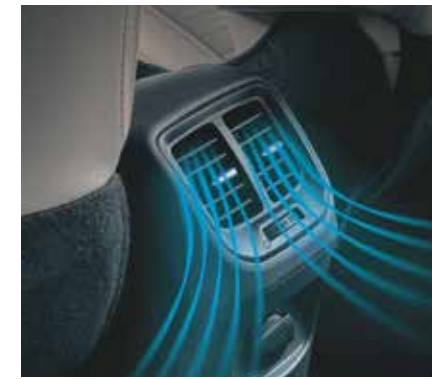
Rear AC vent