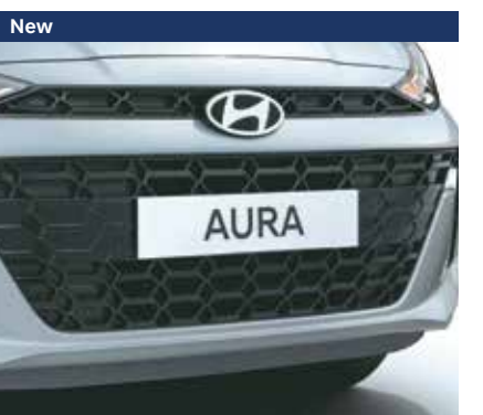
Painted black radiator grille

The new Hyundai AURA makes an impression from every angle you look at it. The new painted black grille and LED DRLs give it an unmistakable presence and command on the road.