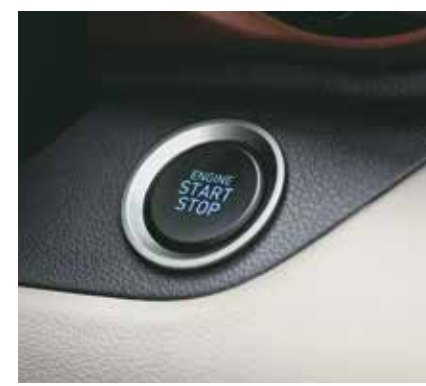
Smart key with push button start/stop