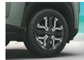
R15 (D=380.2 mm) Diamond cut alloy wheels

Other features: Shark fin antenna | Muscular wheel arch cladding