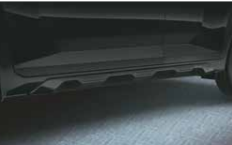
Black painted side sill garnish