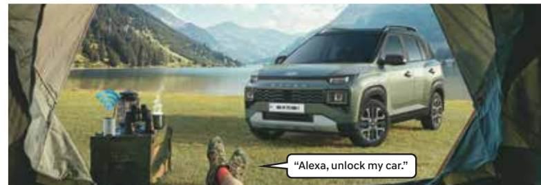
Home to car (H2C) with Alexa*** (English & Hindi)