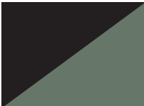
Ranger khaki with abyss black roof