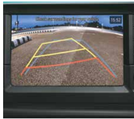
Rear view camera with dynamic guidelines