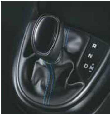
Automated manual transmission (AMT)