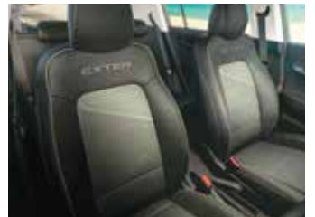
Sporty semi-leatherette upholstery

Other features: Adjustable rear headrest | Cooled glove box