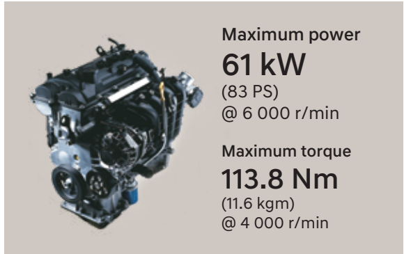
1.2 I Kappa petrol

Get set to live the SUV life with Hyundai EXTER that comes in three powertrain options, each capable of delivering a power-packed performance. So, the next time you go outside, all you need to do is hit the road in your Hyundai EXTER with confidence.