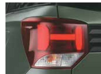
Signature H-LED tail lamps