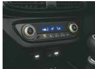
Fully automatic temperature control (FATC) with digital display