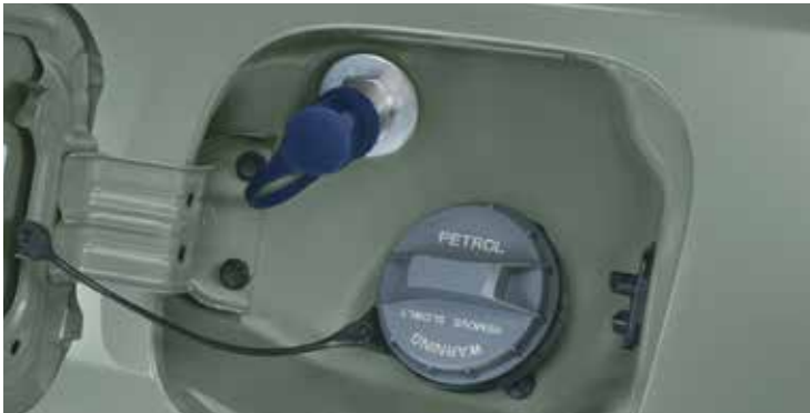
Convenient CNG filling with fast refueling nozzle (near petrol filling area)