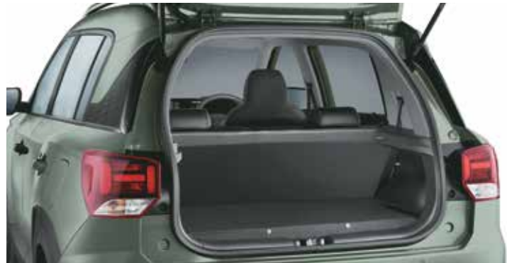
Ample boot space

Hyundai EXTER Hy-CNG duo is engineered to optimize every journey. Equipped with a dual-cylinder system, it offers more boot space and enhanced efficiency. This SUV ensures you have all the room you need for your adventures while delivering exceptional performance.