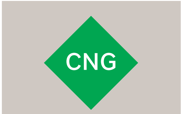
1.2 I Bi-fuel Kappa petrol with CNG