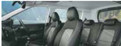
Light sage inserts