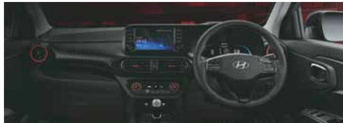
Black interiors with red accents & stitching