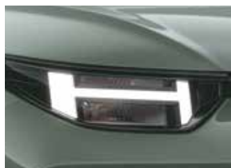
Signature H-LED DRLs and positioning lamps