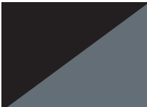
Shadow grey with abyss black roof