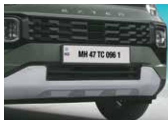
Parametric designed front grille Solid & wide front skid plate