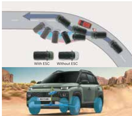
Electronic stability control (ESC) Vehicle stability management (VSM)