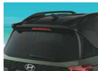
Painted black rear spoiler & roof rails