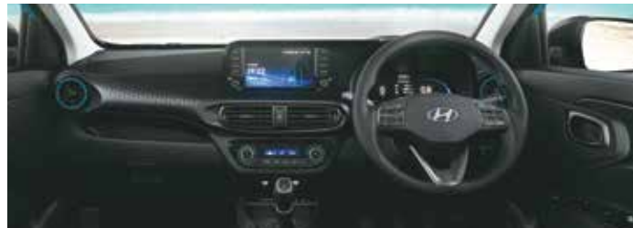
Black interiors with cosmic blue inserts