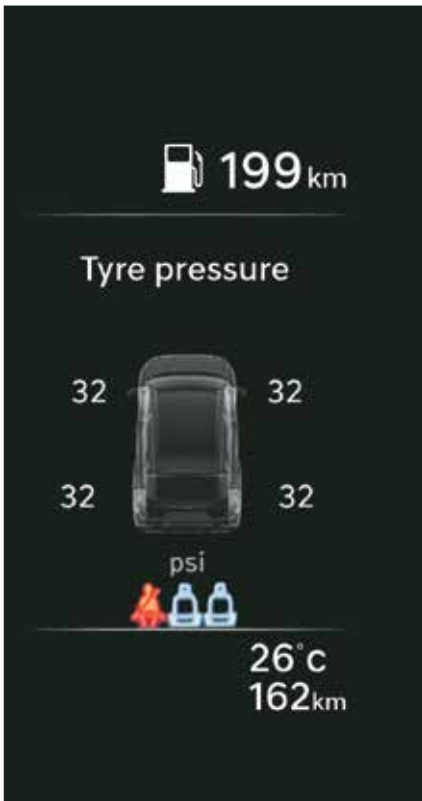
Tyre pressure monitoring system – Highline