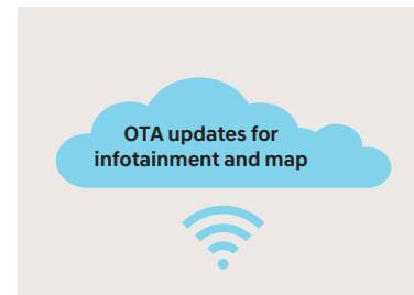
Over-the-air (OTA) updates for infotainment and map (16 free map updates in 8 years)