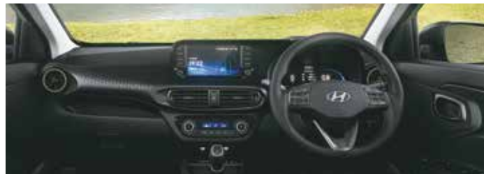
Black interiors with light sage inserts