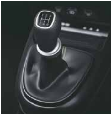
Manual transmission (MT)