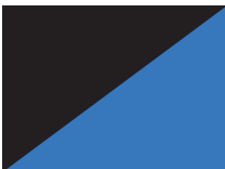
Cosmic blue with abyss black roof