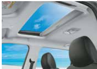
Voice enabled smart electric sunroof