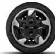
R15 (Dvv=380.2mm) Dual tone styled steel wheel

All it takes is a look to know that Hyundai EXTER is for those who love to be outside. Be it the signature H-LED DRLs, EXTER branding on the front bumper, sporty bridge type painted black roof rails, dynamic painted black rear spoiler, everything makes Hyundai EXTER look spectacular and ready for outside.