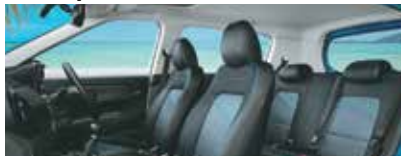
Cosmic blue inserts