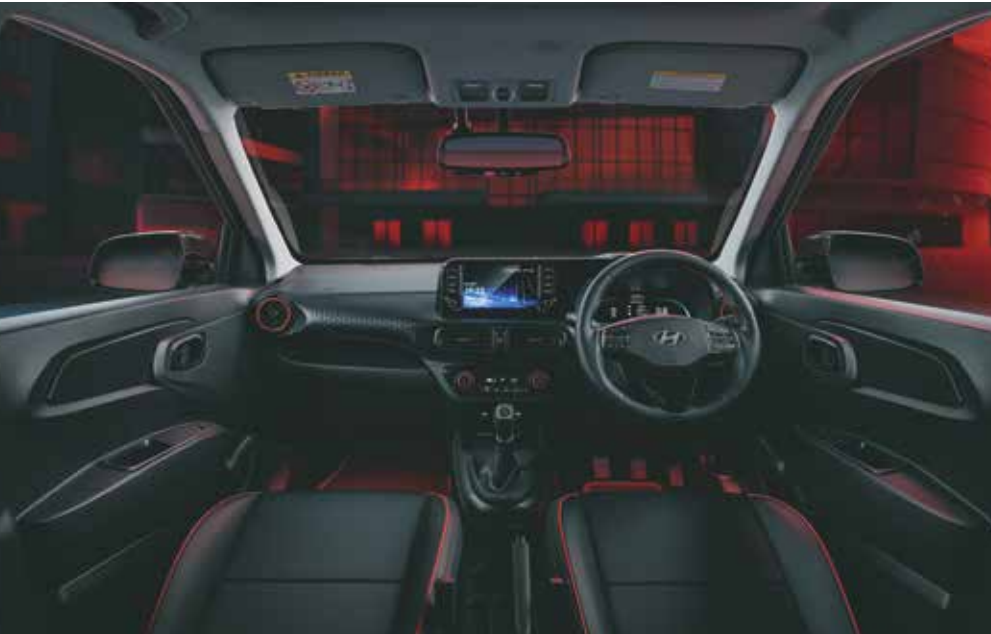
Black theme interiors with red accents & stitching

Packed with features and a whole lot of style, Hyundai EXTER Knight stands out wherever it goes. With its eye-catching design accentuated with red highlights on the outside and inside, Hyundai EXTER Knight blends bold style with impeccable performance. Allowing you to explore the urban and outdoor with effortless ease and flair.