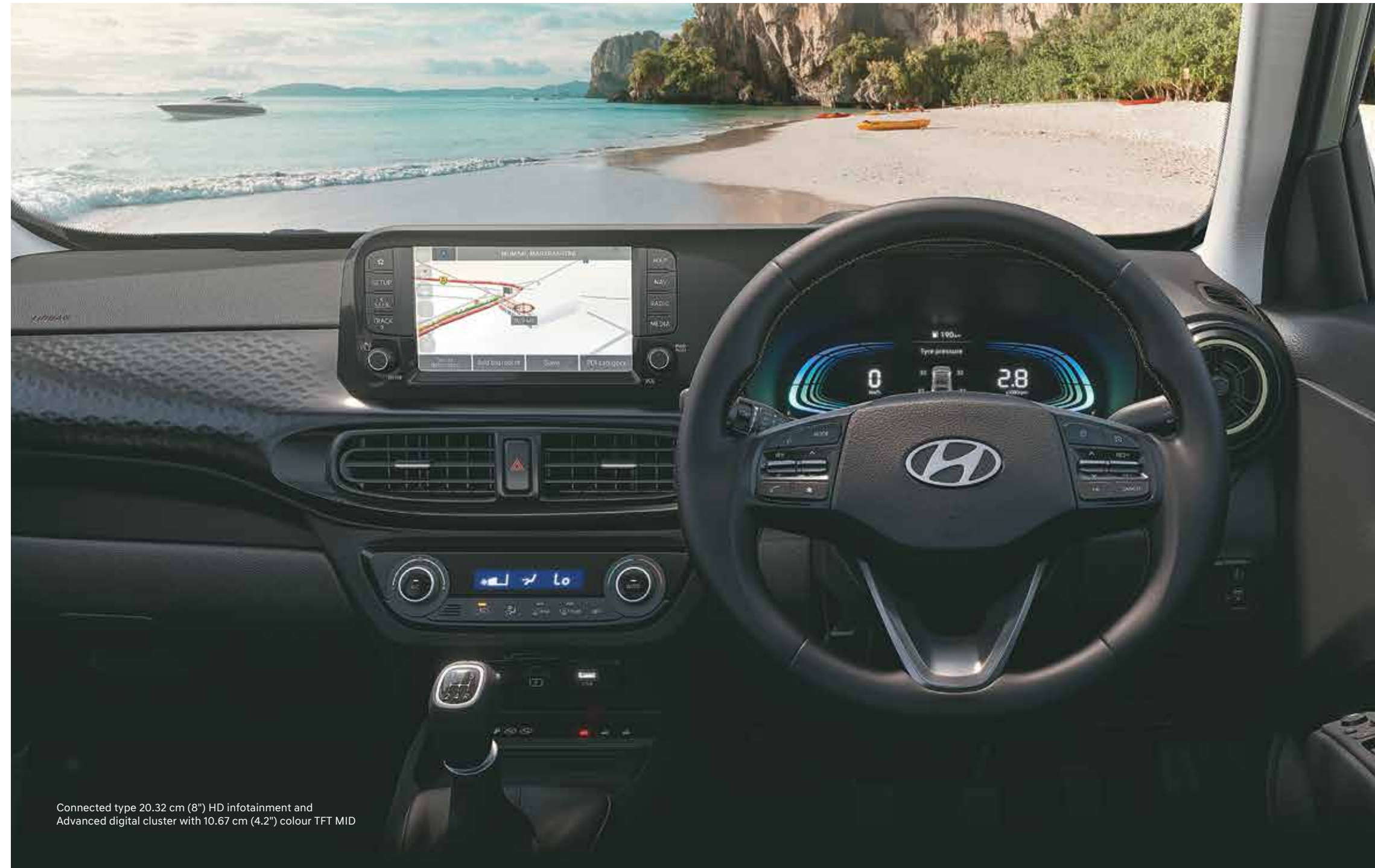
Connected type 20.32 cm (8") HD infotainment and Advanced digital cluster with 10.67 cm (4.2") colour TFT MID