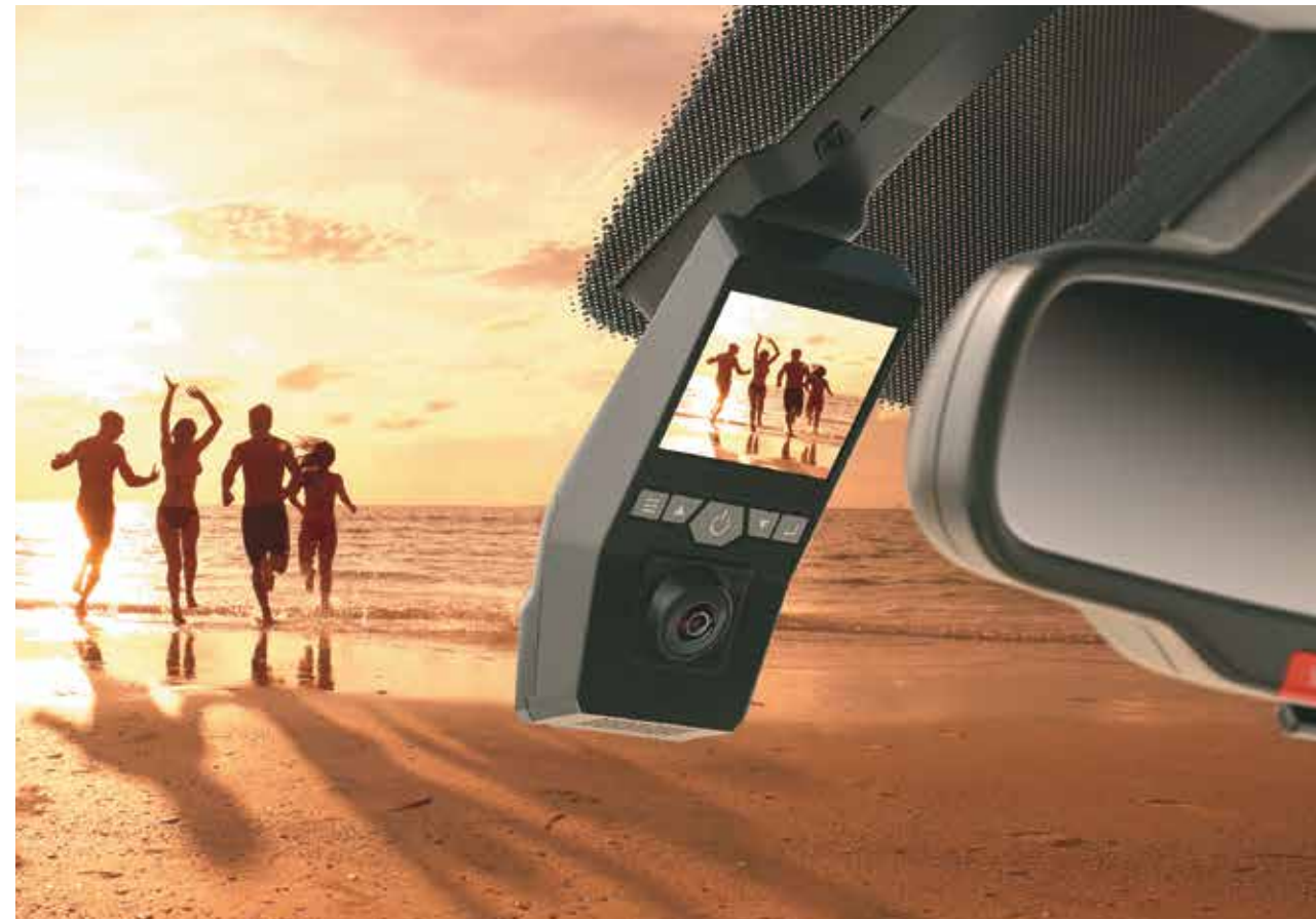
Dashcam with dual camera

Hyundai EXTER comes equipped with a host of high-tech features, so you have absolute control over your many worlds even when on the go. From on-board navigation, smartphone connectivity to infotainment with multiple regional UI language support, Hyundai EXTER has everything to ensure you never miss anything when you are exploring outside.