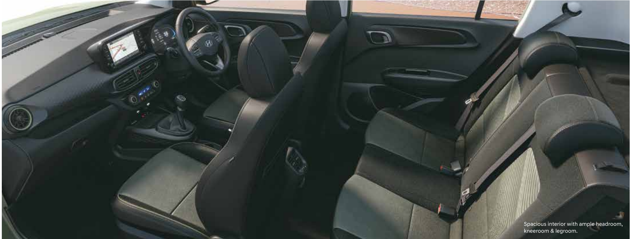
Spacious interior with ample headroom, kneeroom & legroom.

When you get inside Hyundai EXTER, you know there is room for you as well as everything you love. Its spacious interiors have been crafted to offer utmost comfort, so every moment of your journey is exhilarating and you are all set for outside.