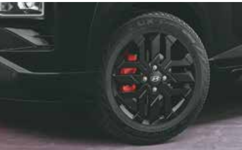
Red front brake calipers