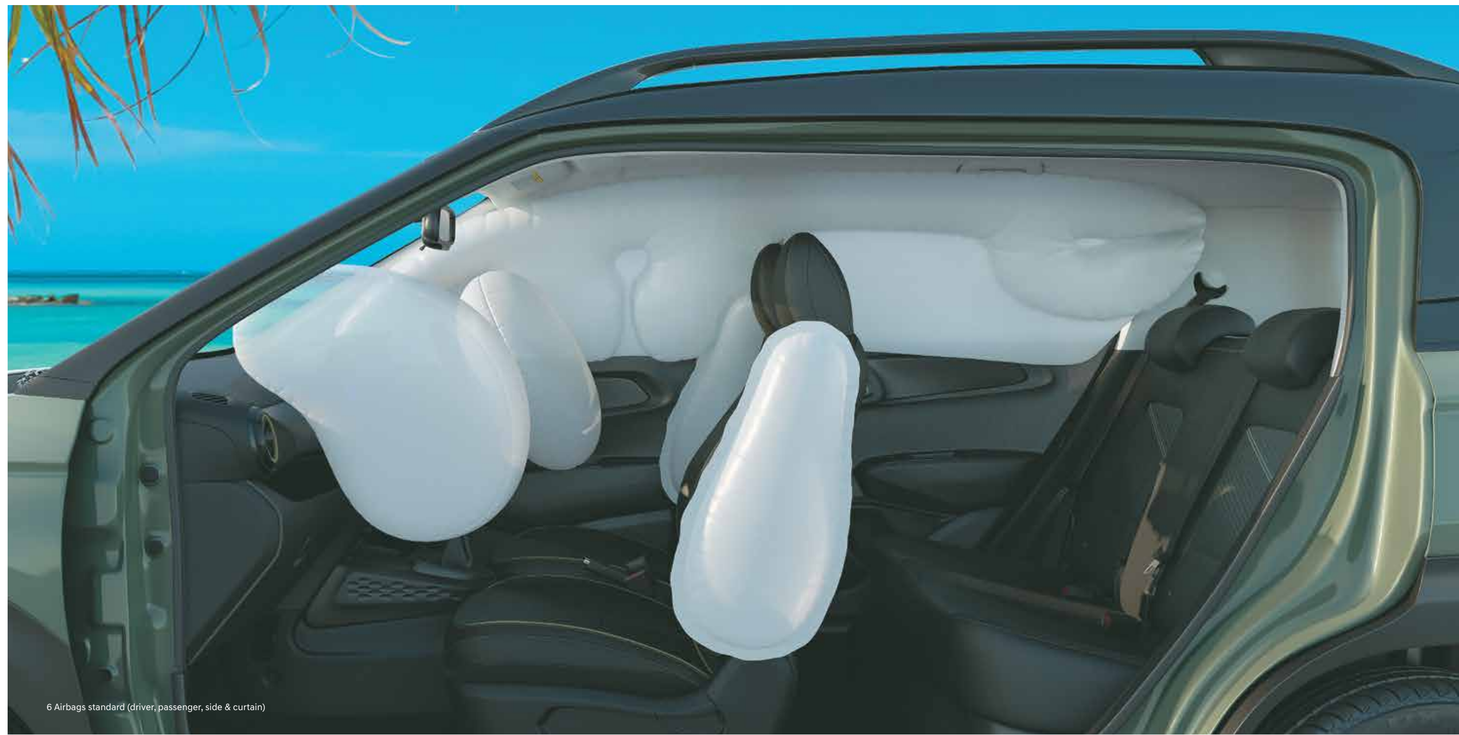
6 Airbags standard (driver, passenger, side & curtain)