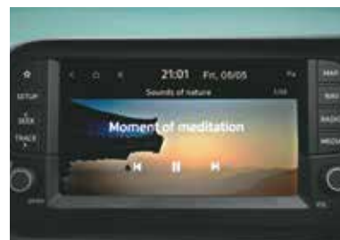
Ambient sounds of nature (7 nos.)