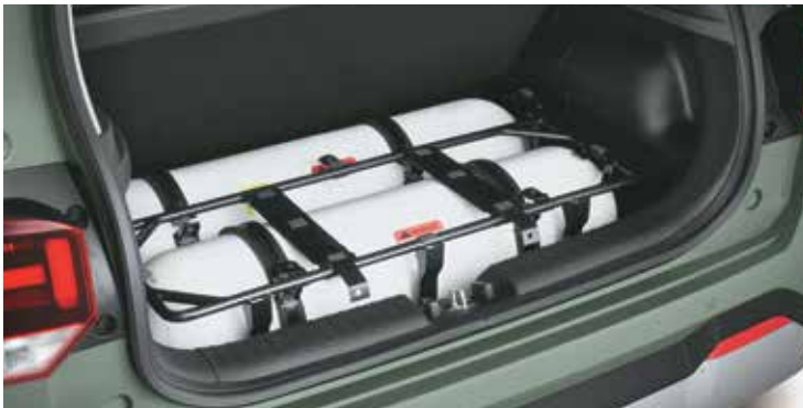
Company fitted dual cylinder CNG