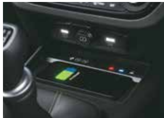
Wireless phone charger*