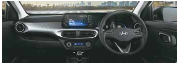
Black interiors with silver inserts