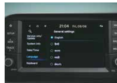
Multi-language UI support (12 nos.)