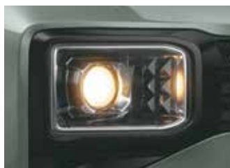
Projector bi-function headlamps