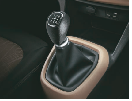
5-speed manual transmission