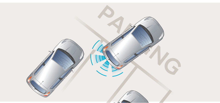
Rear parking sensors