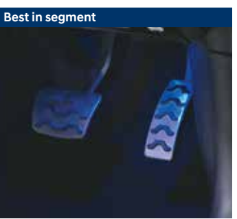
Metal pedals (Turbo only)