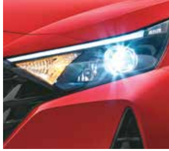
LED projector headlamps