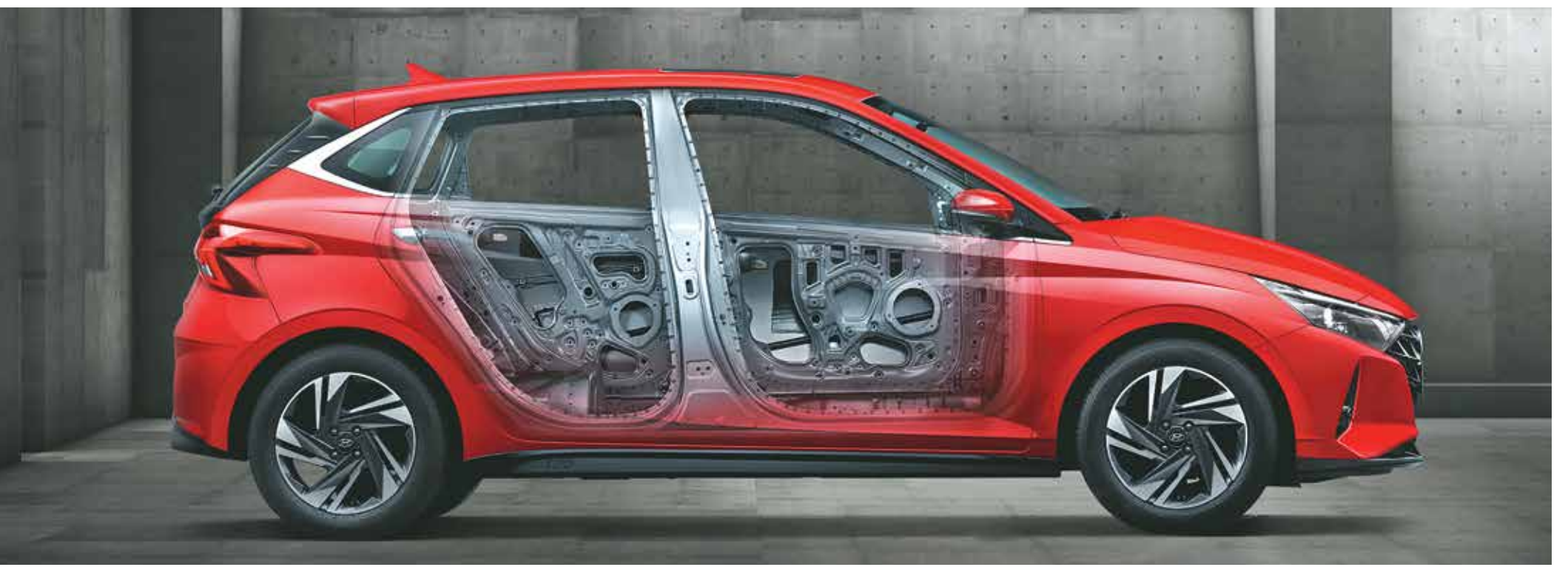
Strong body structure (with 66% AHSS and HSS)