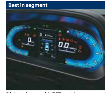
Digital cluster with TFT multi information display (MID)