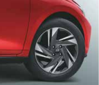
R16 (D=405.6 mm) diamond cut alloy wheels