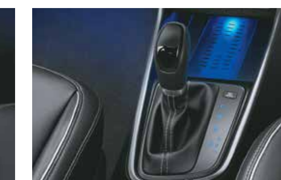
DCT & IVT