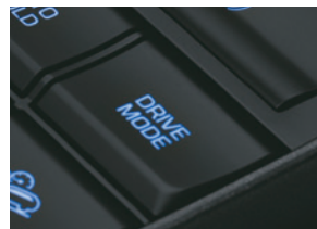
Drive mode select