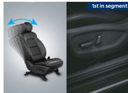
10-way power adjustable driver & 8-way power adjustable passenger seat