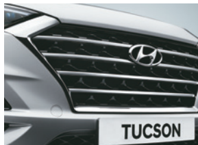
Cascade design bold front grille