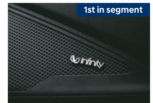
Infinity premium sound system (8 speakers)

Other features: Rain sensing wipers | Smart key and push button start | Tilt and telescopic steering | Rear USB charger | Cruise control electric parking brake | Apple car play Android auto | On board navigation | Voice recognition | Hyundai iBlue (audio remote application) | Auto dimming IRVM | Electric parking break | Cruise control