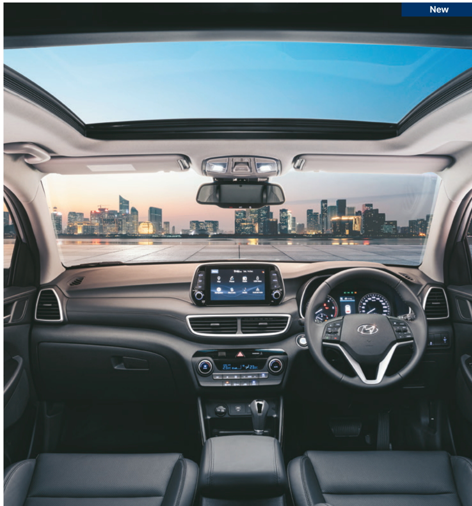
Premium black interiors

We made sure all your journeys are a breeze irrespective of the terrain because of the luxury and comfort offered by the new Tucson, the premium SUV.