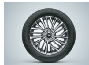
R18 diamond-cut alloy wheels