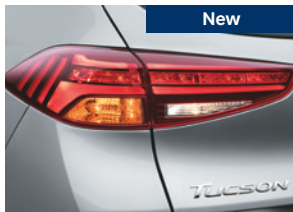
New LED rear combination lamps