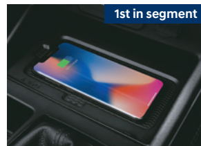
Wireless phone charger