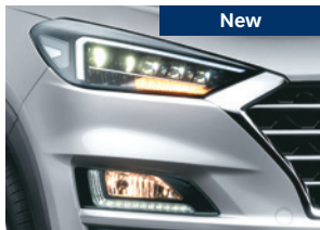
New Penta projector LED headlamps with LED DRLs