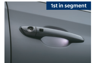
1st in segment Chrome outside door handles with front pocket lighting

Other features: Twin chrome exhaust (diesel only) | Roof rails | LED static bending lamps | Front & rear fog lamps | Chrome finish beltline