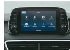
20.32cm HD audio video navigation system