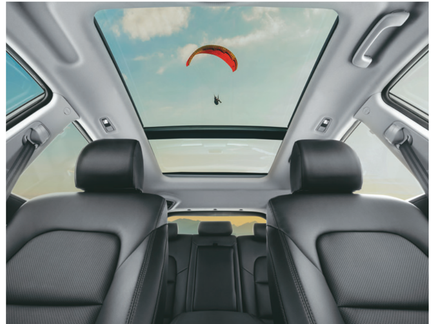
Electric panoramic sunroof