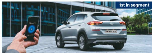
Hyundai Blue Link connected car technology