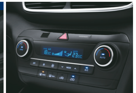
Dual zone FATC with auto defogger

Other features: Leather* touch on dashboard | Rear AC vent | 60:40 split folding rear seat | 2nd row seat with reclining function