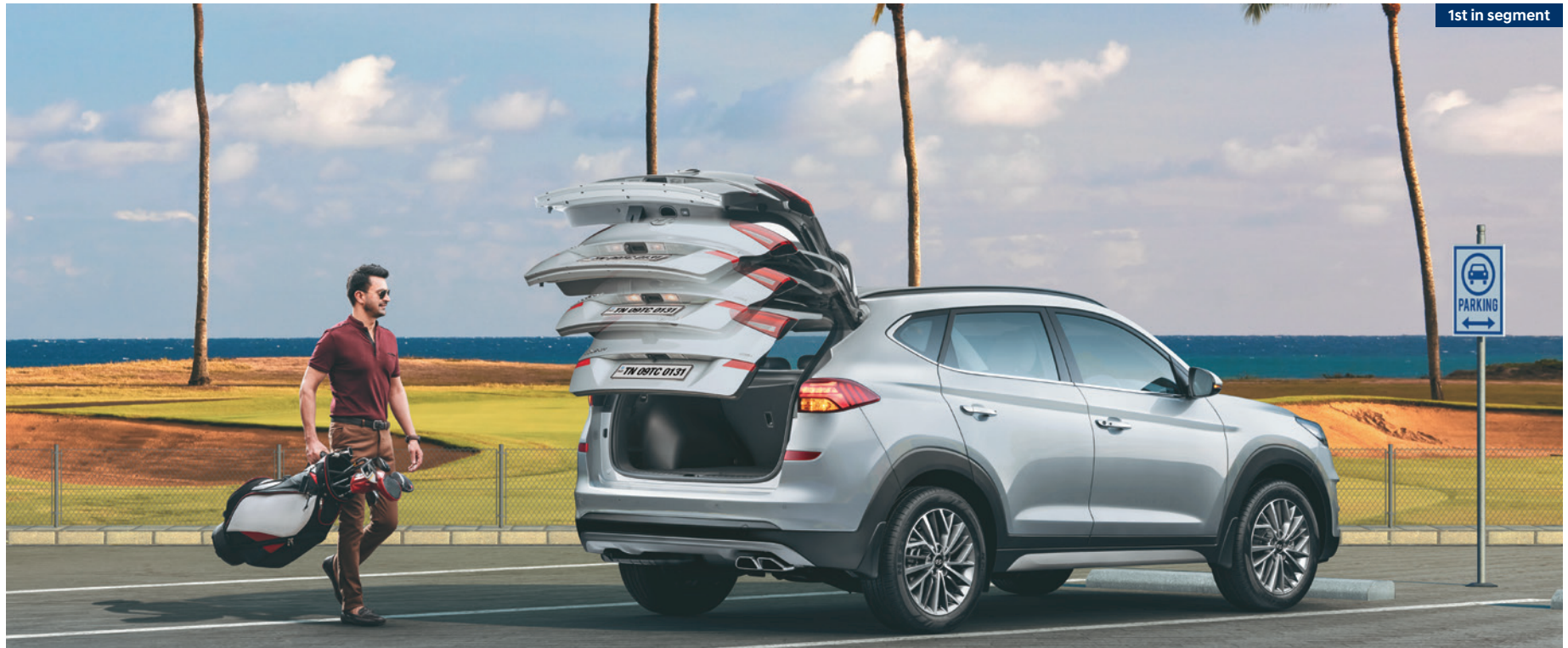
Hands free smart power tail gate with height adjustment