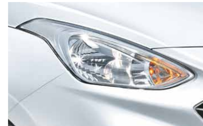
Swept back headlamps