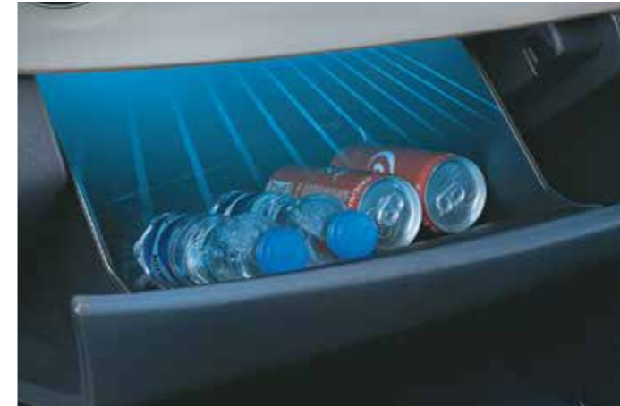
Cooled glove box

Xcent Prime presents thoughtful features for ultimate comfort and convenience. These features make each trip unforgettable for your customers who will prefer to travel in Xcent Prime on every trip.