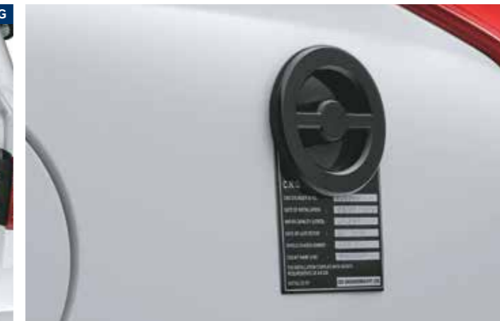
Convenient CNG filling valve

Other features: Manual AC | Body colored bumpers | Front power windows