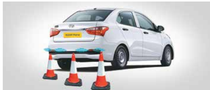
Reverse parking sensors