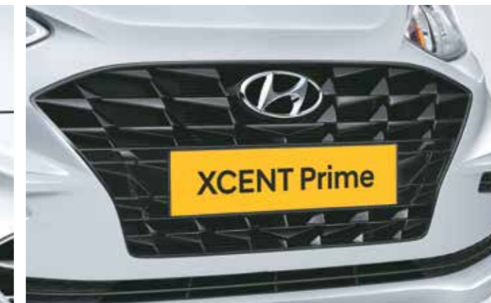
Painted black radiator grille