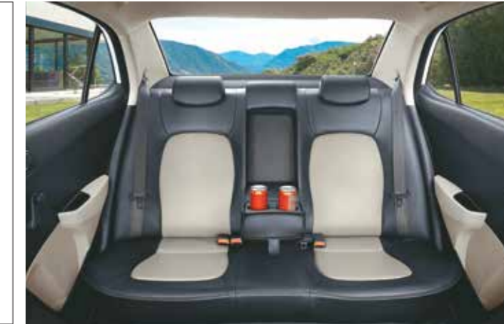
Rear seat armrest with cup holder