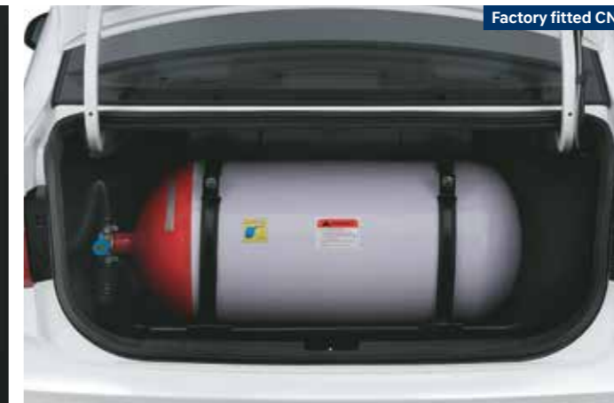
CNG boot space