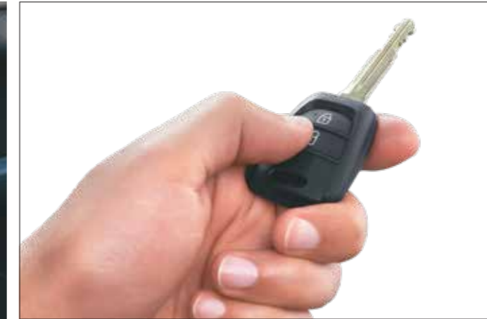
Keyless entry with central locking