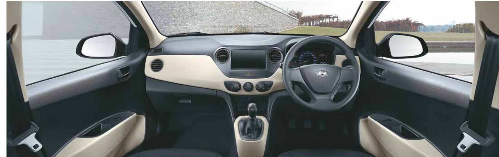
Dual tone black and beige interiors

Give your passengers the pride of travelling in Xcent Prime. Built with Hyundai's modern design language, it adds flair to your fleet, complements your customers' style and leaves a winning impression on the road.