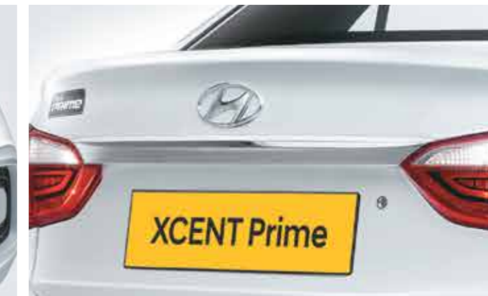
Rear chrome garnish