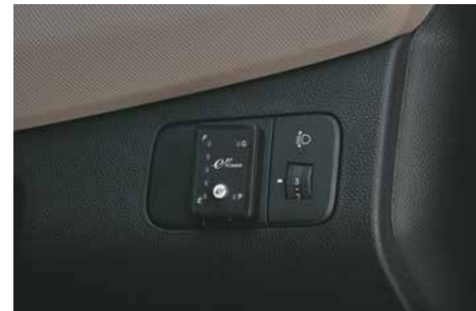
CNG fuel indicator