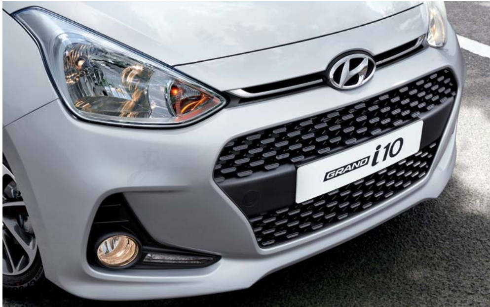
2. Large wraparound headlamps