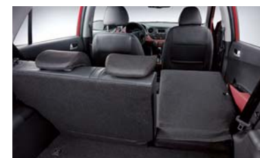
• ECM with rear view monitor • 60:40 Split rear seat