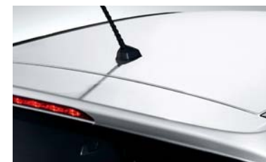
• Rear view camera • Micro roof antenna