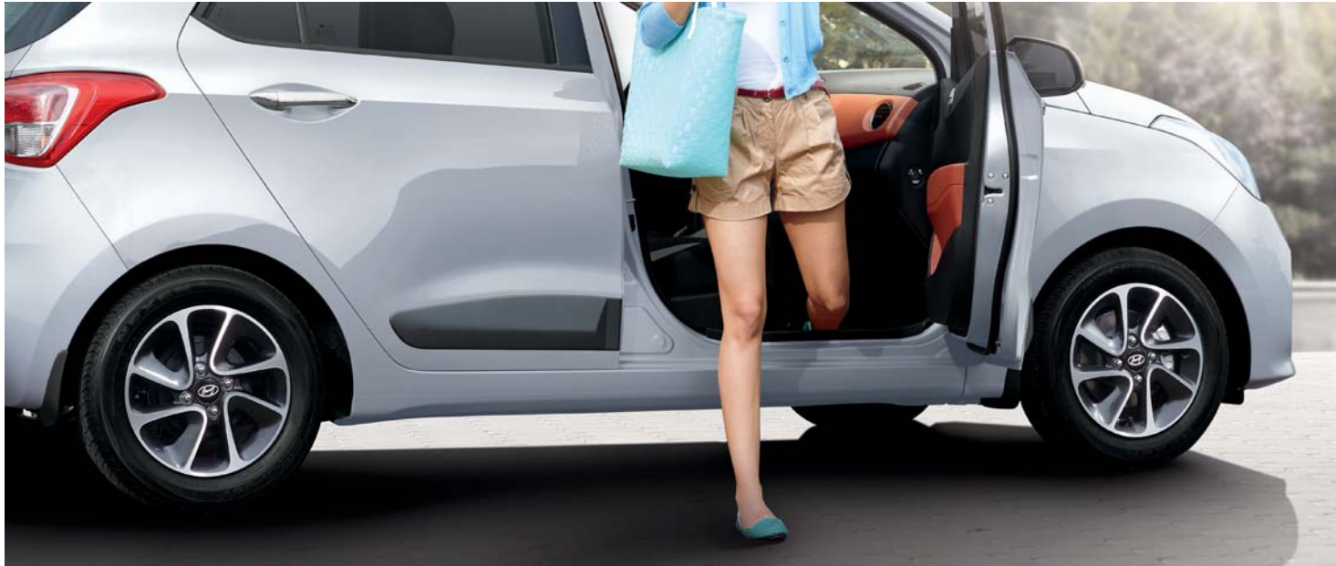
3. Lower step height