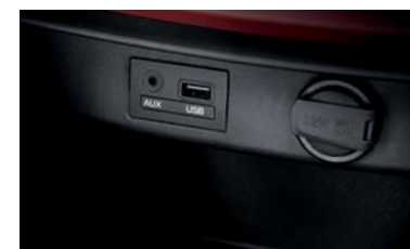
• Audio system • Auxiliary iPOD® & USB jack