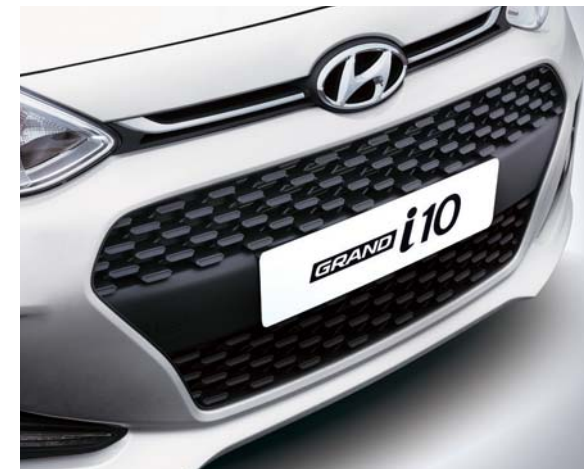
• New cascade grille