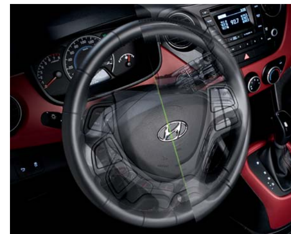
• Adjustable steering wheel