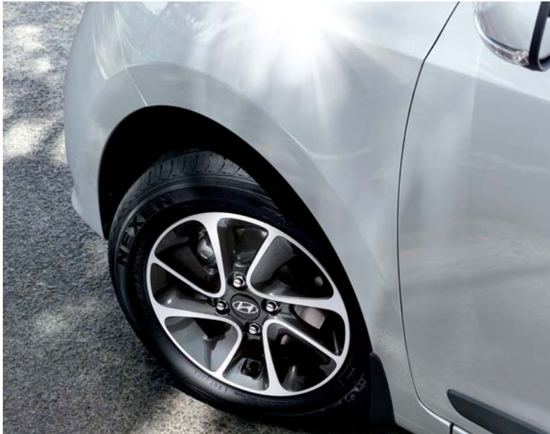
1. Stylish alloy wheels