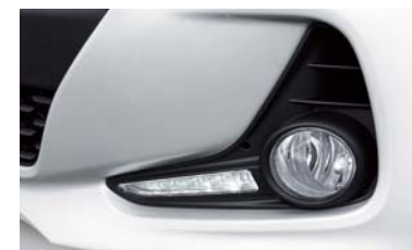
• Rear fog lamps • LED daytime running lights (DRL)