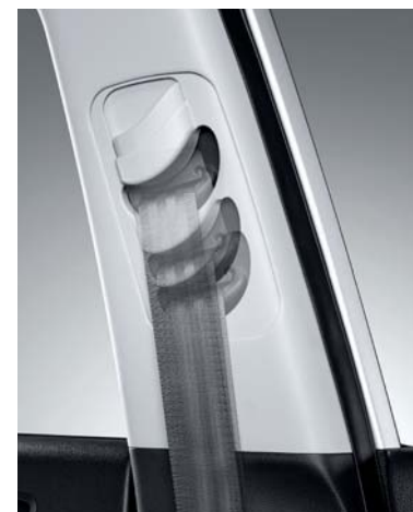
• Height-adjustable seat belt