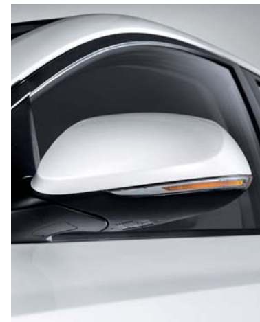
• Exterior mirror indicator repeaters