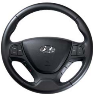
Smart steering wheel Intuitive fingertip command of the audio system using steering wheel controls is available for extra comfort, convenience and safety.

From power steering to powering your iPod®, the Grand i10 is loaded with high tech for total command and control. An in-dash LCD updates you with key driving information while four acoustically-tuned speakers work in concert with iPod®, MP3 and USB capabilities to deliver crystal-clear audio. Keeping you connected is standard Bluetooth® hands-free calling with audio controls mounted on the steering wheel for the ultimate in safety and convenience.