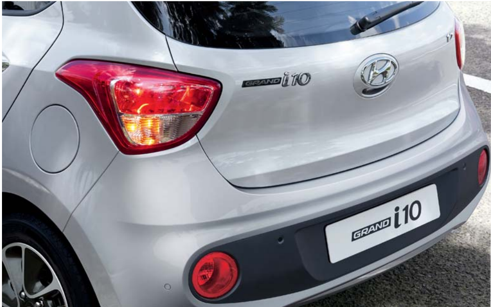
4. Large wraparound taillamps

It begins up-front with a pair of clear wraparound headlamps whose multi-focus reflectors combine with LED daytime running lamps to deliver powerful illumination. The back story reveals true urban sophistication: extra-large rear combination lamps maximize visibility while the chrome-plated H-logo cleverly conceals a tailgate latch and optional rear view camera.