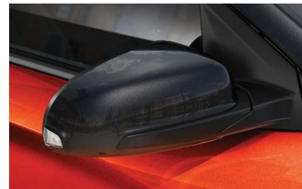
Two - tone exterior mirrors with LED indicator