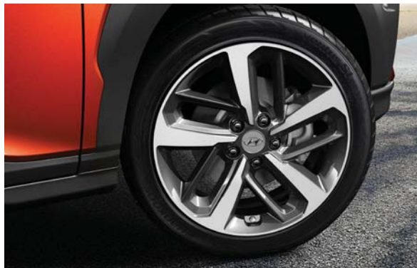
18" alloy wheels