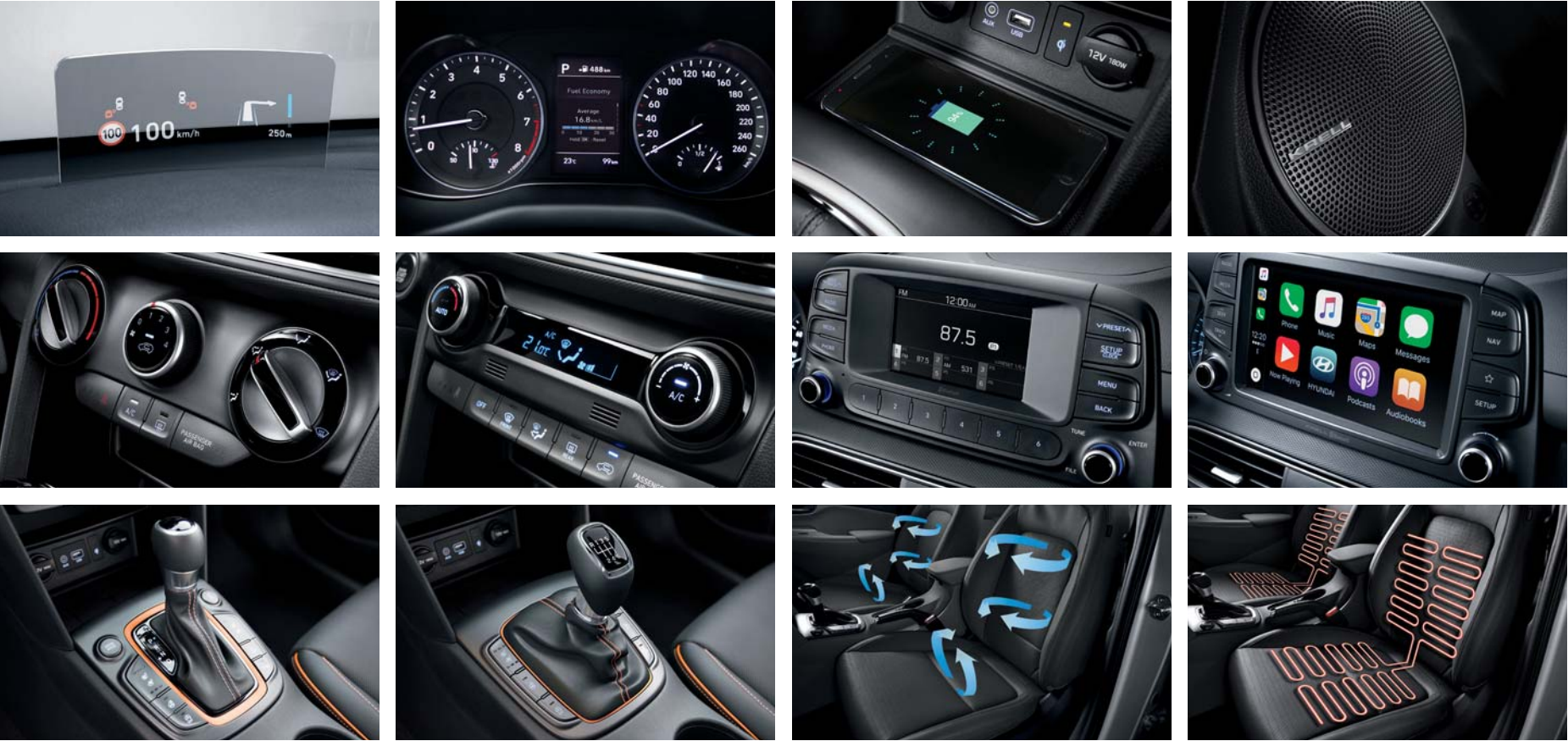
Head - up display (HUD) Manual air conditioning 7 - speed dual - clutch transmission (DCT) Digital Information Cluster Full auto air conditioning with auto defog 6 - speed manual transmission Wireless phone charging Audio 4.0A mono LCD with 6 speakers Ventilated seats Premium sound system from KRELL 8" touch screen display Heated seats