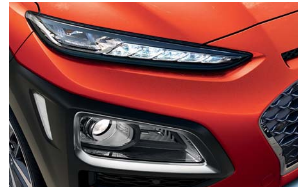
LED headlamps and daytime running lights

Combining sculpted lines with a stylish edge, the all - new KONA is expressive from every angle. Muscular surfaces flow into the distinctive high - contrast fender cladding, highlighting the bold SUV design. Firmly planted with a strong stance and sporty 18" alloy wheels, the KONA's two-tone roof and exterior mirrors also give you the possibility to customize colour combinations to fit your personal style. Dare to be different.