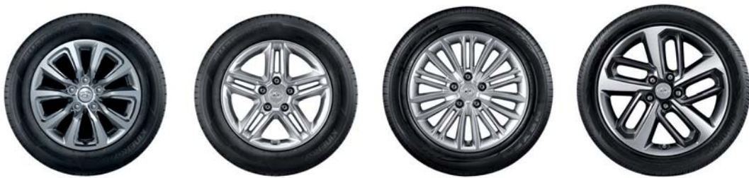
16" steel wheel 16" alloy wheel 17" alloy wheel 18" alloy wheel