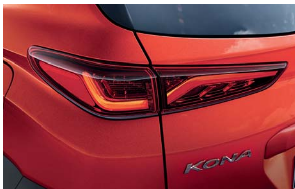
LED rear lamps