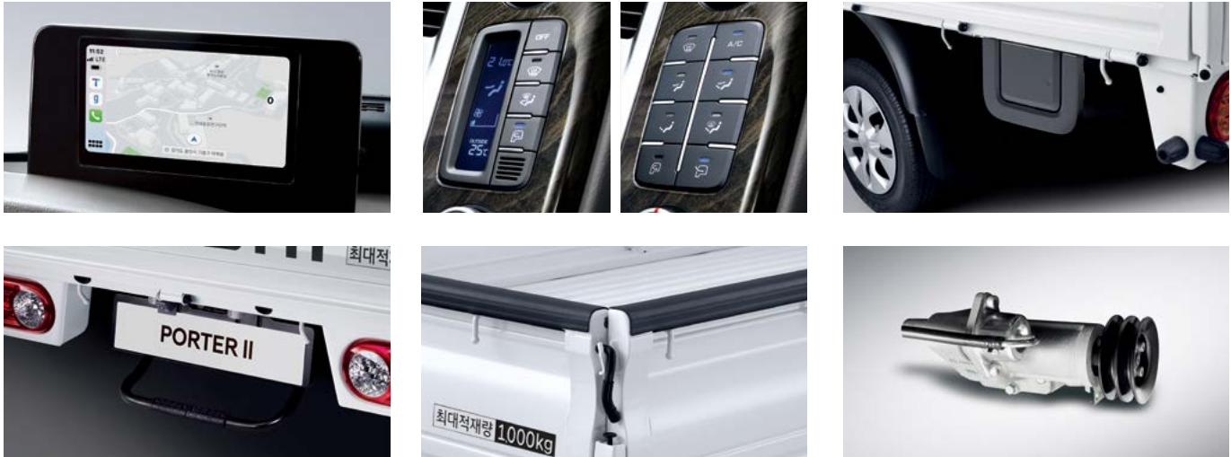
8-inch display audio (phone projection) Rear guard

Unit: mm * Extra Long Super Cab (with bumper guard installed)