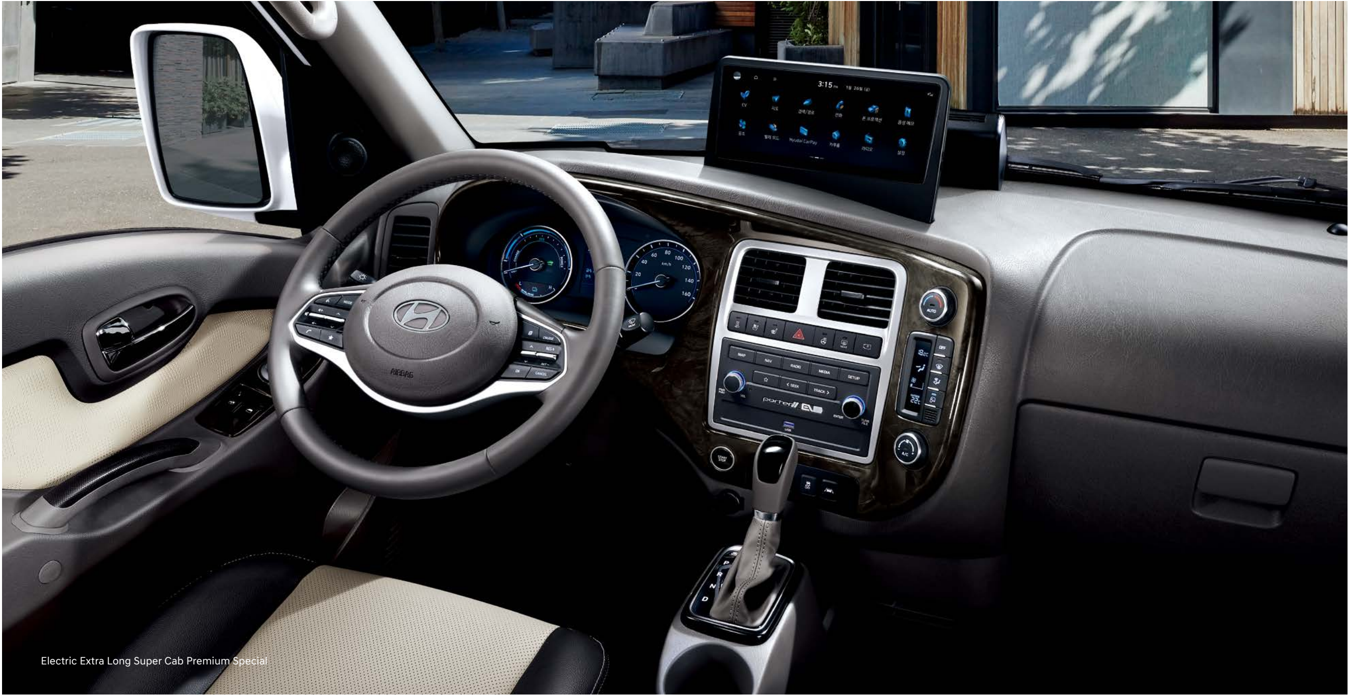
Electric Extra Long Super Cab Premium Special

* The screen layout/design of the infotainment system may change with the updates.