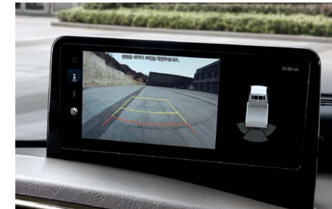
10.25-inch navigation system (phone projection, Bluelink) / Rear View Monitor 8-inch display audio (phone projection)

The PORTER II offers a pleasant driving environment with a diverse array of even more competitive and convenient features.