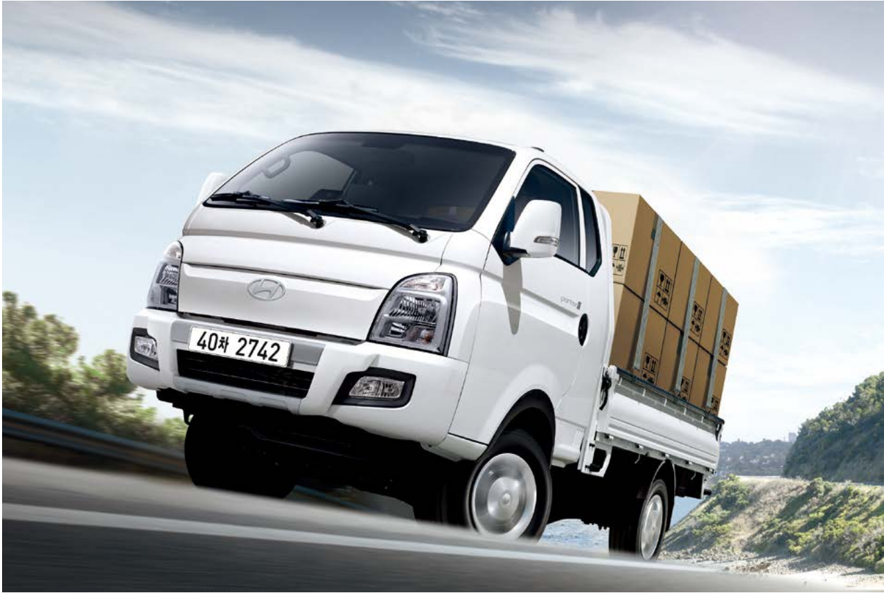
Long Super Cab Premium (Creamy White)_4WD

The combination of the powerful Smartstream LPG 2.5 Turbo engine and 4WD system ensures excellent driving performance.