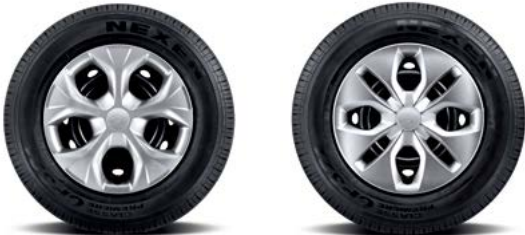
Basic full-sized wheel cover Premium full-sized wheel cover