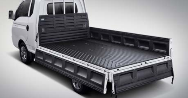
Plastic cargo bed cover