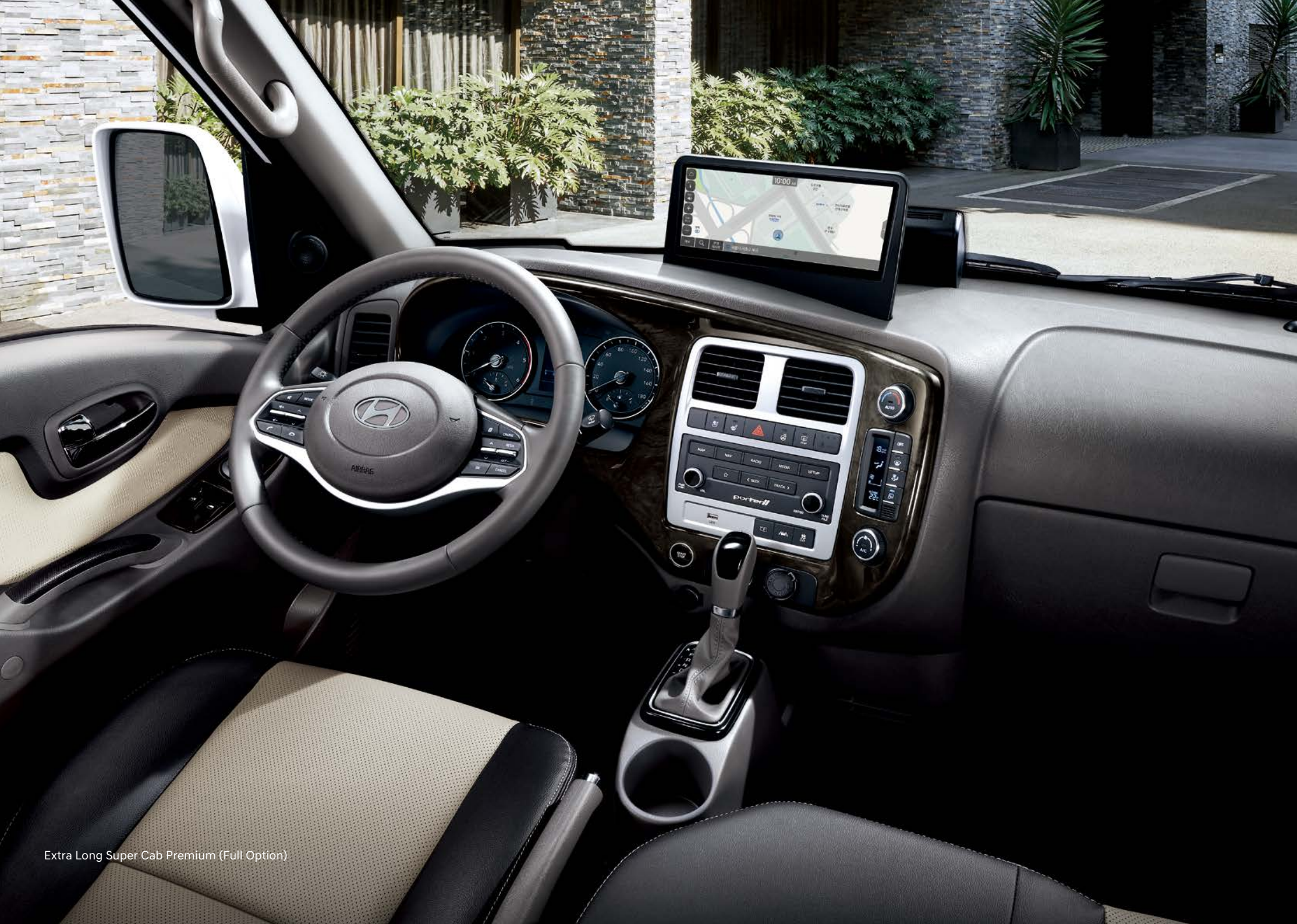
Extra Long Super Cab Premium (Full Option)