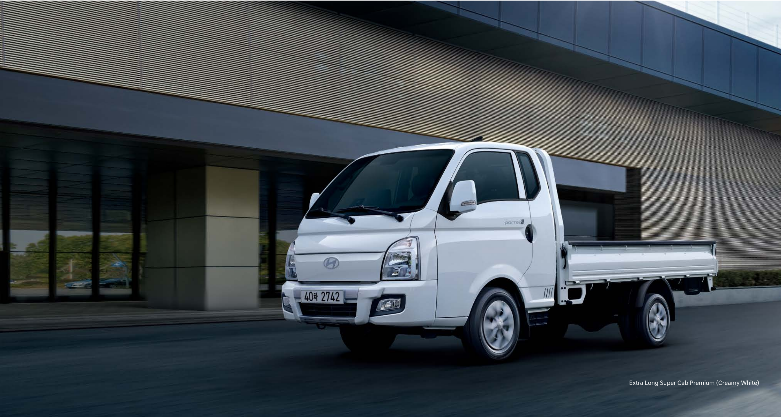
Extra Long Super Cab Premium (Creamy White)

* A 10.25-inch navigation system and proximity key with push-button start are provided for customers who select the Navigation package.