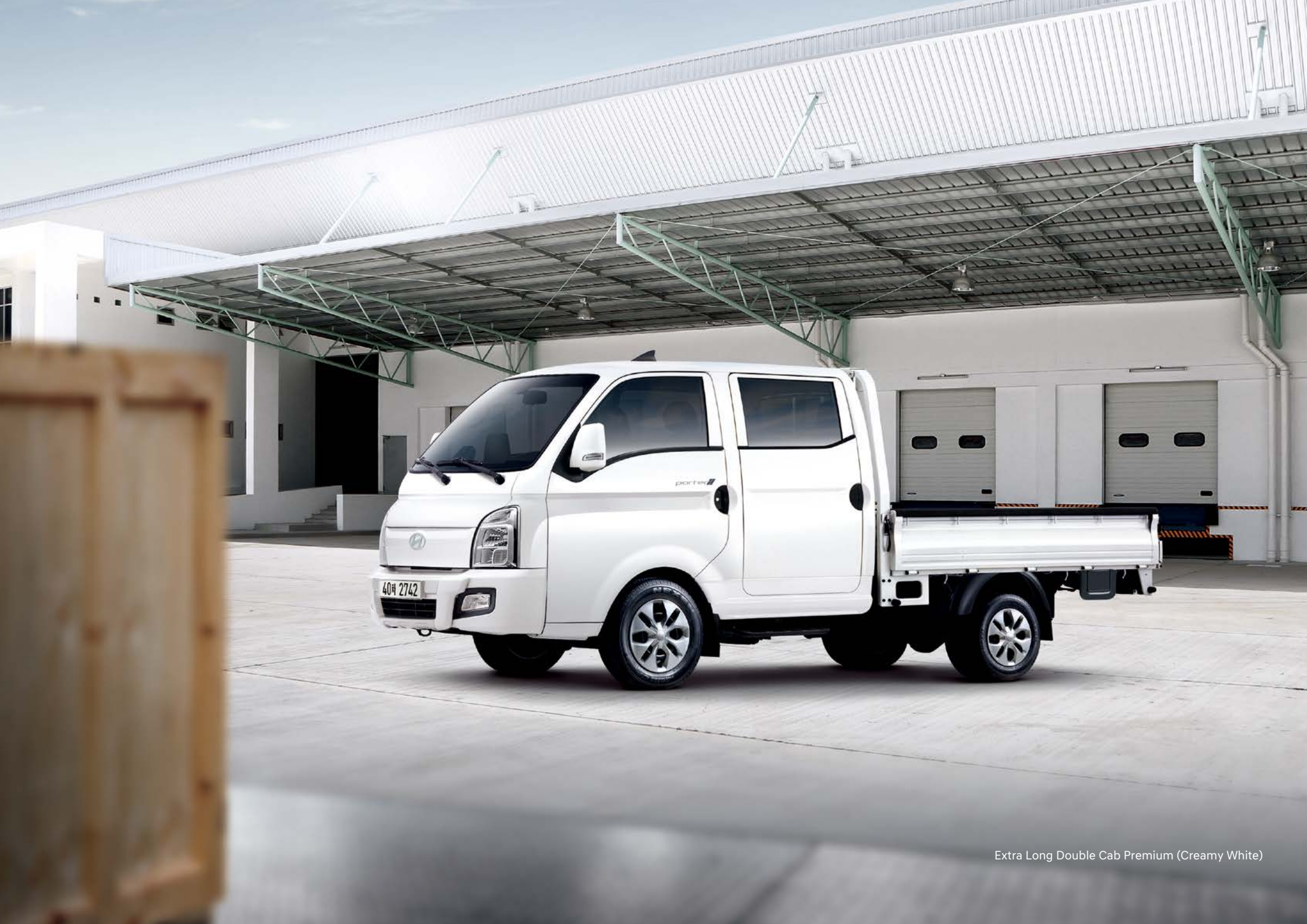
Extra Long Double Cab Premium (Creamy White)