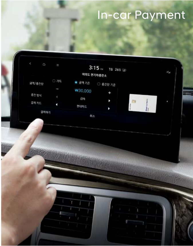
10.25-inch navigation system (Bluelink, phone projection, Bluetooth hands-free, In-car Payment) / Rear View Monitor