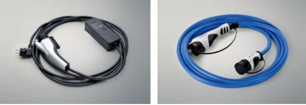
220V portable charging cable / 5-pin slow-charging cable

* Plastic bed cover may get damaged due to external temperature change and impact, and not eligible for warranty repair. * The 220V portable charging cable and 5-pin slow-charging cable are available exclusively for the Porter Electric. * The 220V portable charging cable is a slow-charging cable with an ICCB. * The 5-pin slow-charging cable is a slow-charging cable without an ICCB. * Wide range of aftermarket products can be purchased from Hyundai Shop (shop.hyundai.com)'s Hyundai Brand Hall.