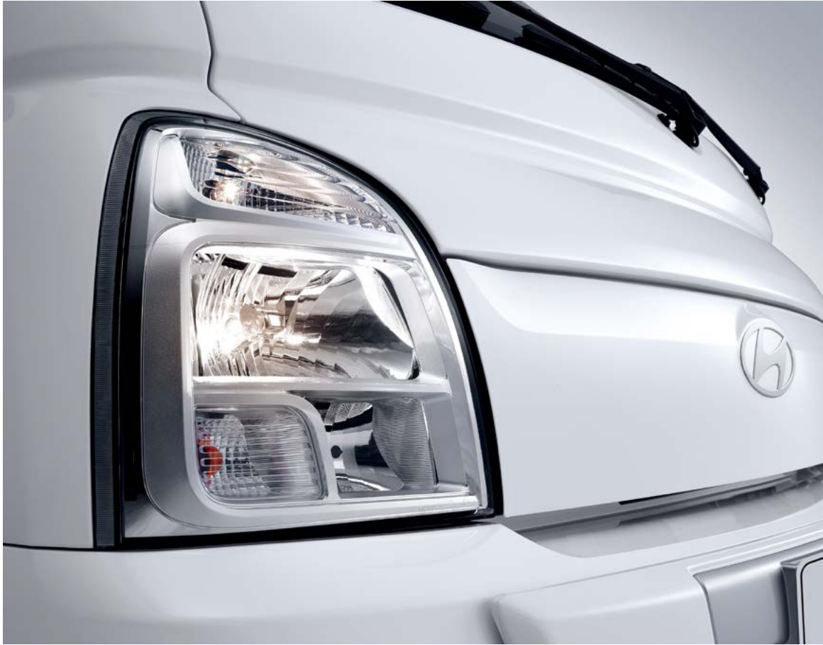
Clear type headlamps (4 lighting modes, with daytime running lights)