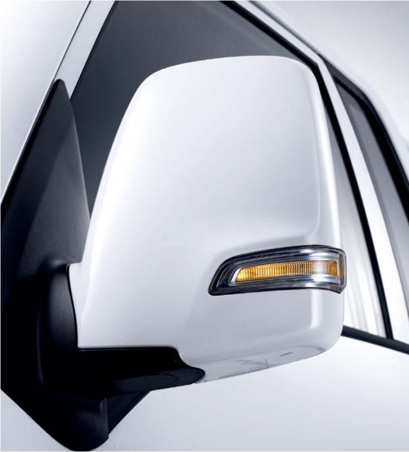
Body-colored outside mirror (turn signal lamps)