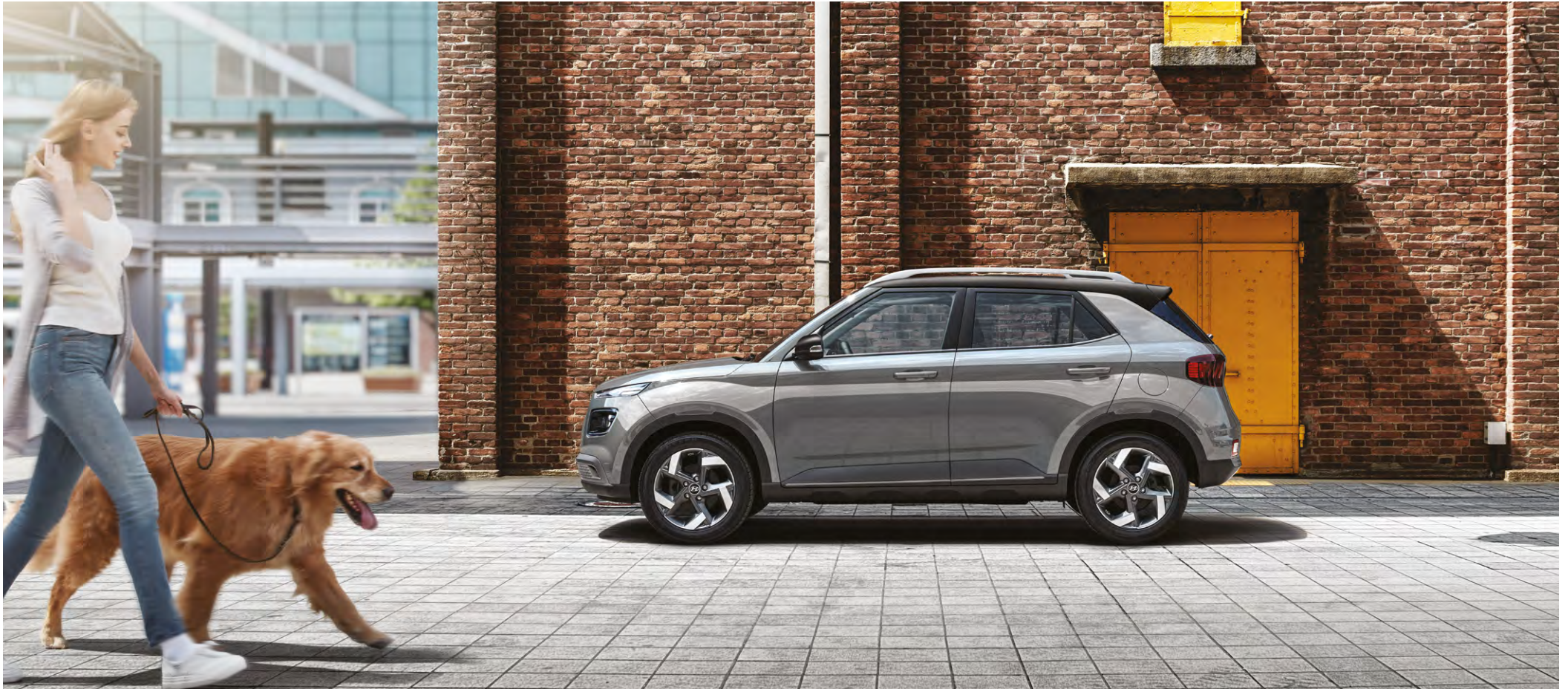
Premium Full Option(Cyber Gray Metallic/Abys Black Pearl Two-tone)