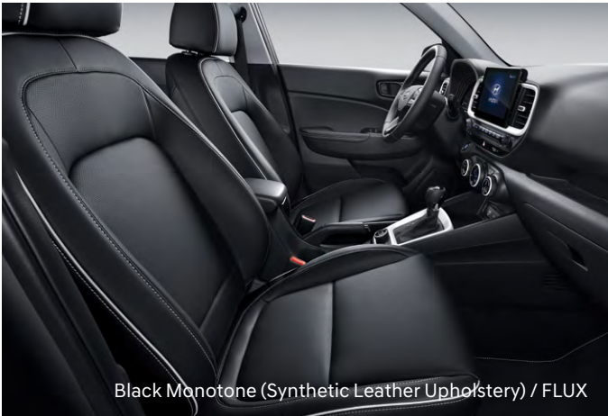
Black Monotone (Synthetic Leather Upholstery) / FLUX