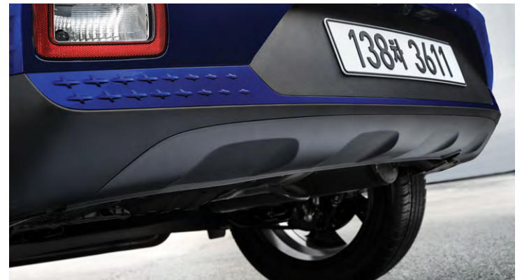
C Pillar Badge FLUX Customized Rear Skid Plate