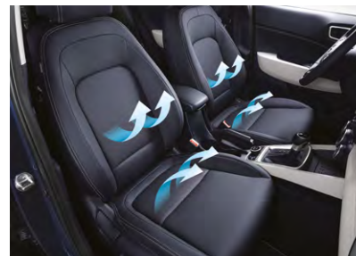
8-inch navigation system Ventilated Front Seat