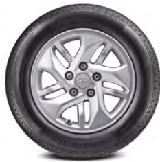
185/65R15 Tire & 15-inch Alloy Wheels