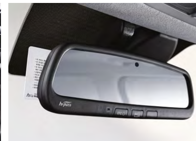
LED headlamps(projection type) Hi-pass System(applicable to Electric Chrome Mirror)