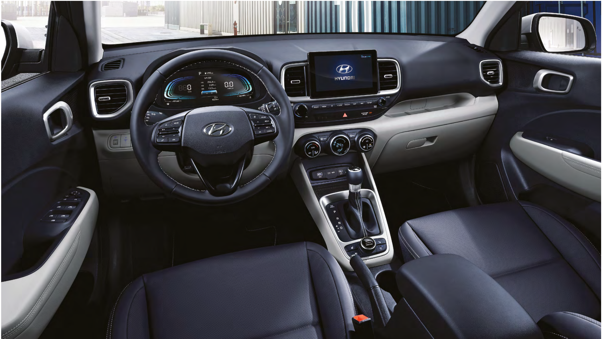
Premium Full Option(Meteor Blue)

* Infotainment system screen images may differ after updates.