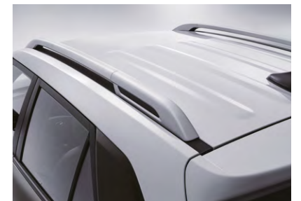
LED Rear Combination Lamps Roof Rack