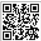
Hyundai Certified Secondhand Vehicle Information on purchasing secondhand vehicles