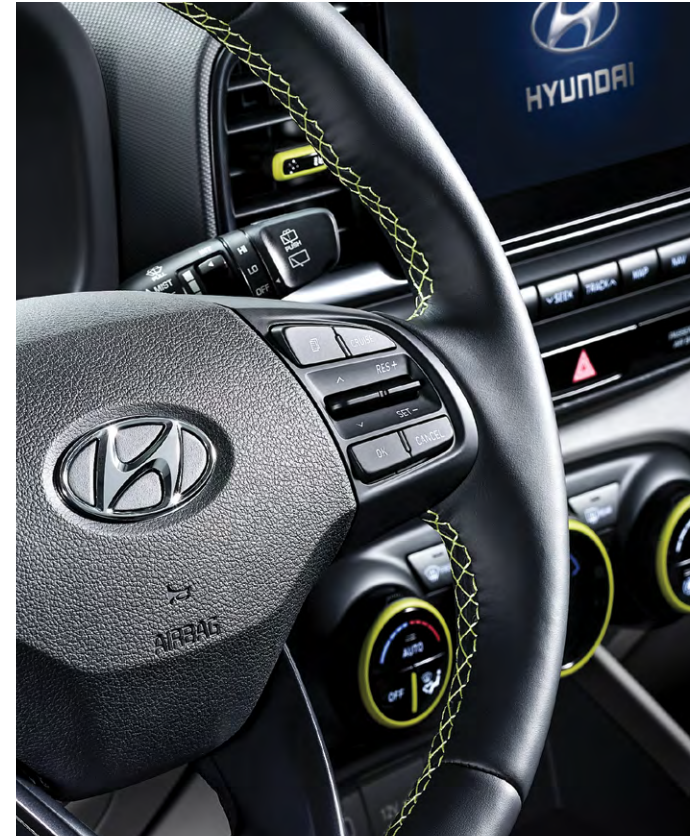
Leather Steering Wheel (with FLUX Stitch)