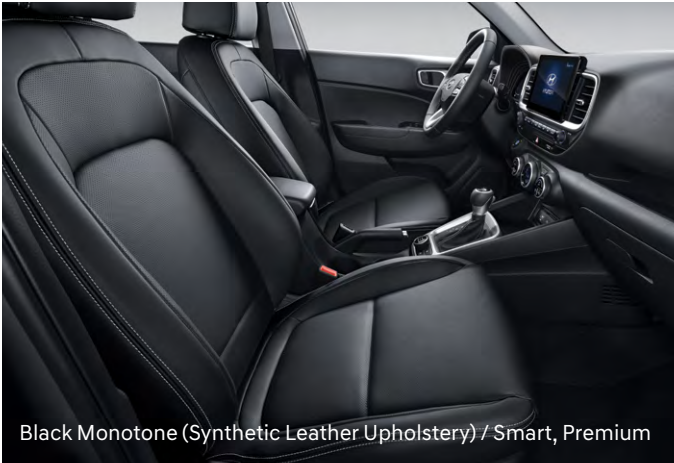
Black Monotone (Synthetic Leather Upholstery) / Smart, Premium