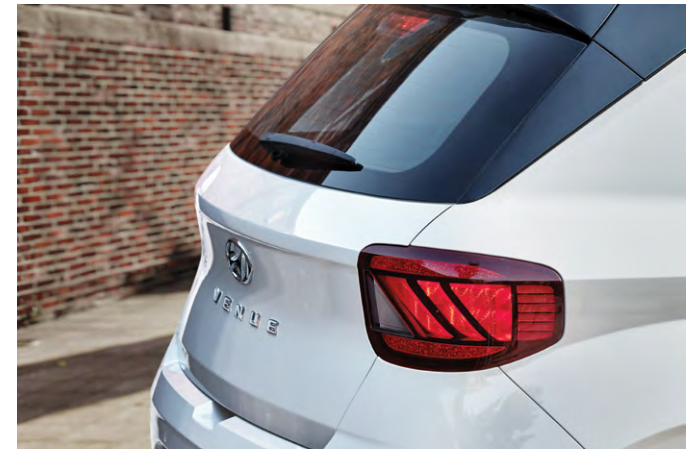
LED Rear Combination Lamps 17-inch Alloy Wheels & Tires