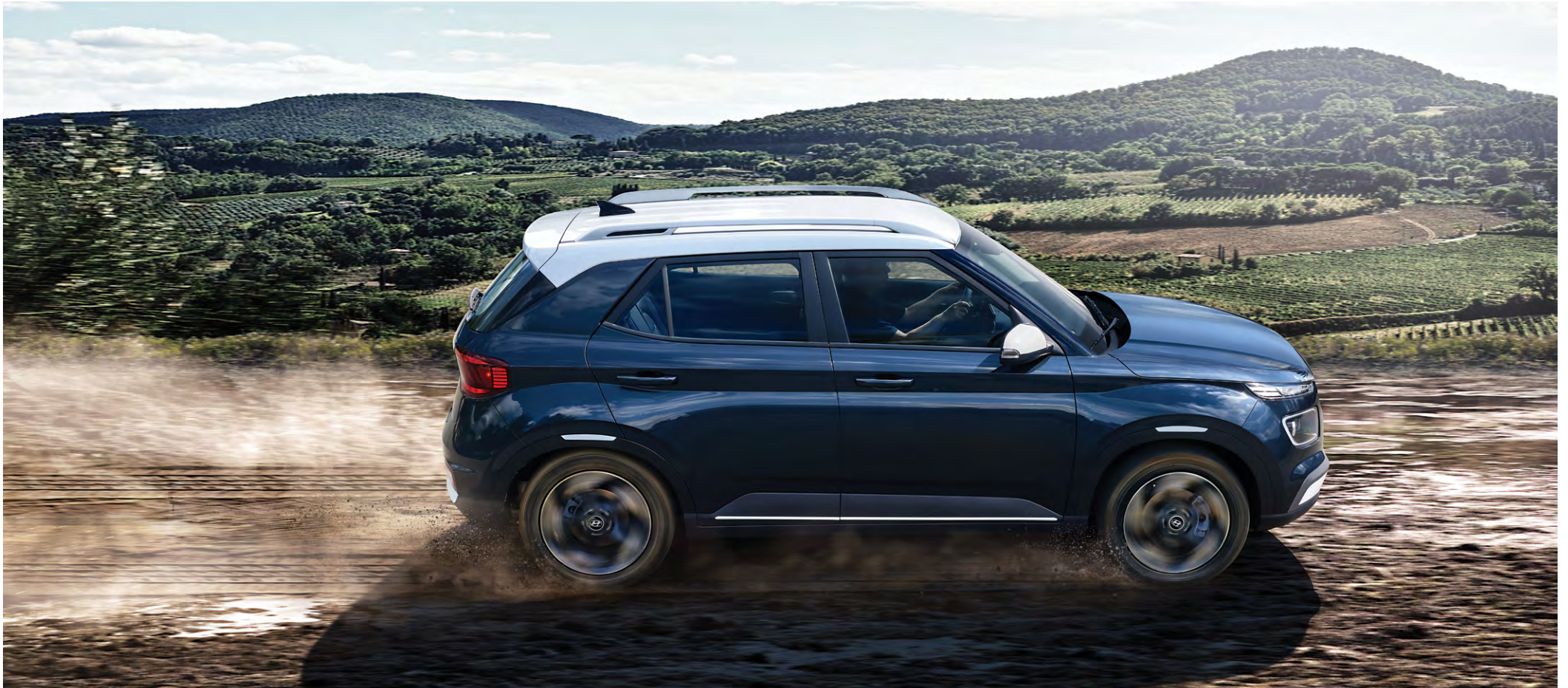
Premium Full Option (Denim Blue Pearl/Chalk White Metallic Two-tone)