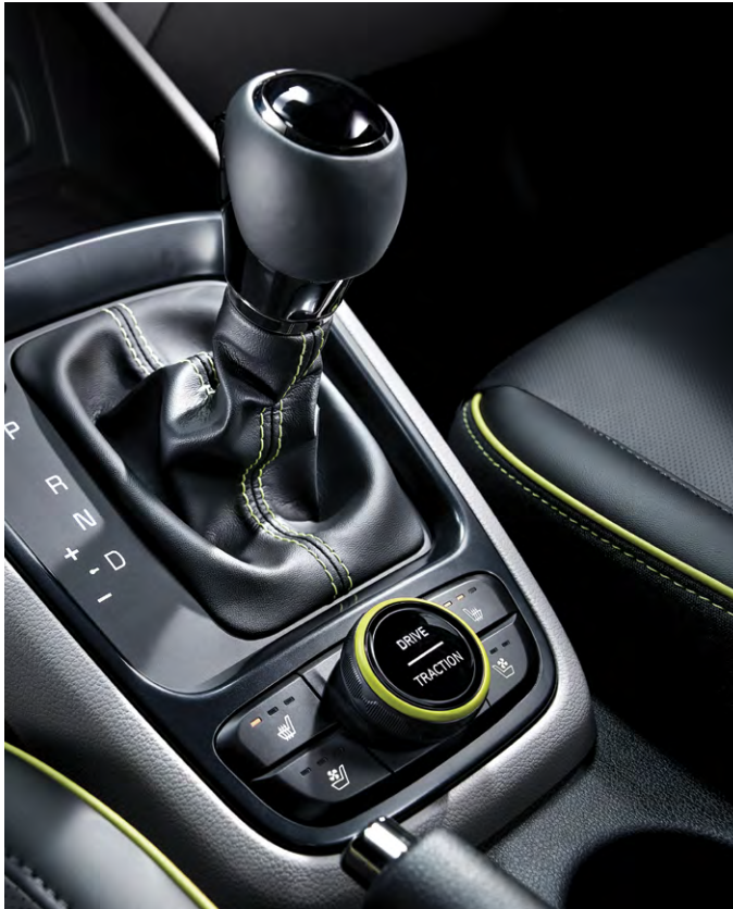
Gear Knob & 2WD Multi Traction Control Switch