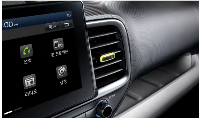
Air Vent Full Auto Air Conditioning