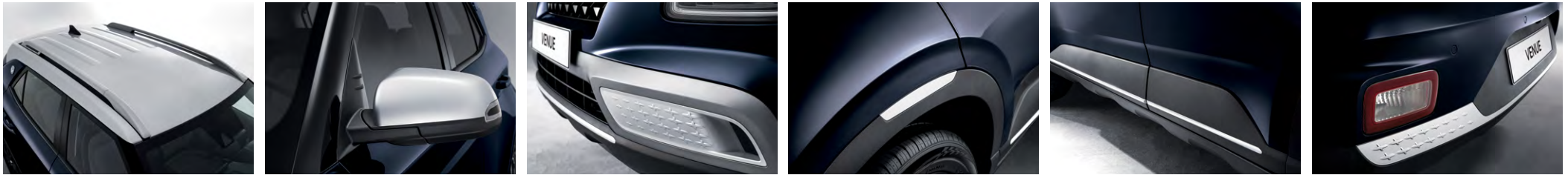
Denim Blue Pearl/Chalk White Metallic Two-tone

For a Chalk White Metallic roof, color accents will be in the same color as the roof. For a Abyss Black Pearl roof, outside mirrors will be in Abyss Black Pearl, plus color accents in the same color as the body.