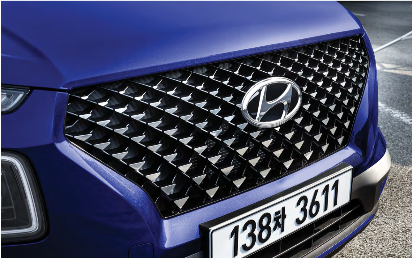
FLUX Customized Hot-Stamped Radiator Grille