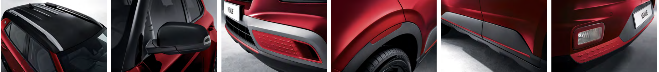
Ultimate Red Metallic/Abyss Black Pearl Two-tone