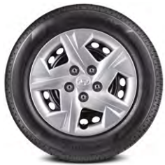
185/65R15 Tire & 15-inch Steel Wheels