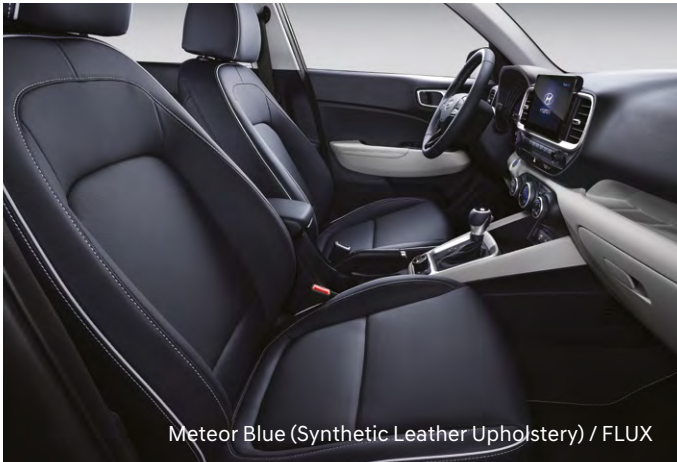
Meteor Blue (Synthetic Leather Upholstery) / FLUX