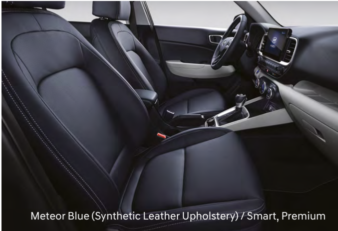
Meteor Blue (Synthetic Leather Upholstery) / Smart, Premium