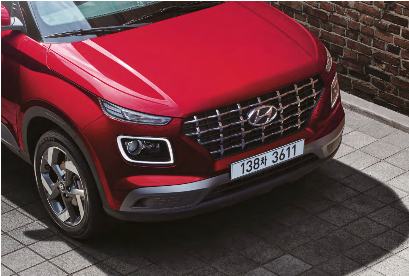
Cascading Grille/LED Headlamps