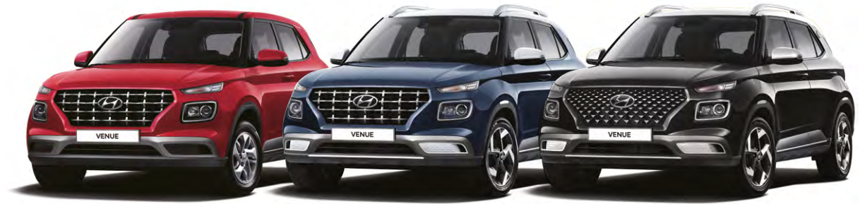
Smart Full Option (Ultimate Red Metallic) / Premium Full Option (Denim Blue Pearl/Chalk White Metallic Two-tone) / Premium Full Option (Abyss Black Pearl/Chalk White Metallic Two-tone)