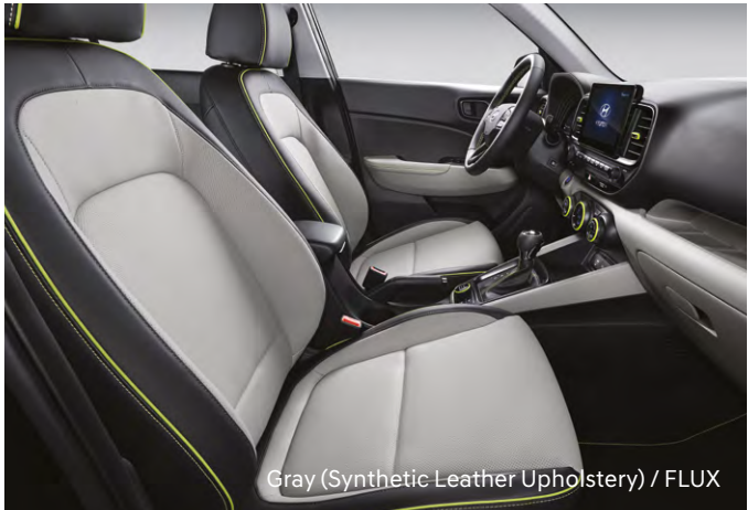
Gray (Synthetic Leather Upholstery) / FLUX