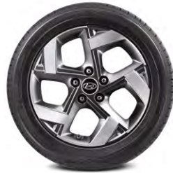
205/55R17 Tire & 17-inch Alloy Wheels