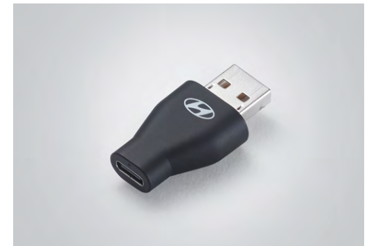
C to USB_A adapter A to USB-C adapter