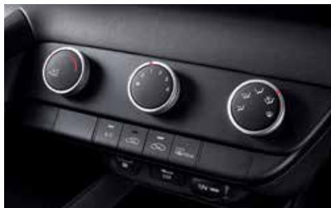
Manual Air Conditioner