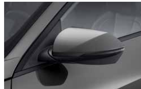
Exterior Sideview Mirrors (heated, power folding, LED turn signal indicators)