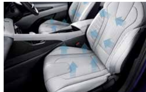
Ventilated Front Seats