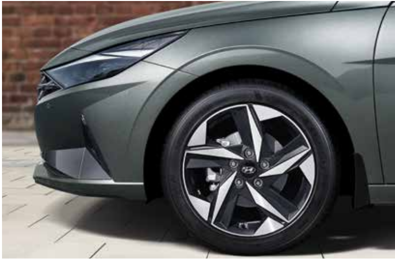
LED Headlights 17" Alloy Wheels & Tires