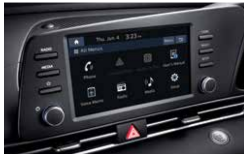
8" Display Audio System (matt, when selecting 4.2" color LCD cluster display)