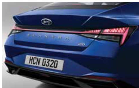
LED Rear Combination Lamp