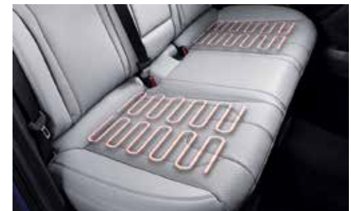
Heated rear seats