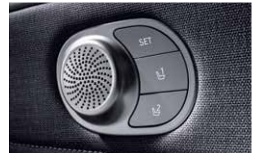
Memory System For Driver's Seat