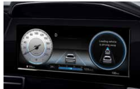
10.25" Full Color Cluster Display