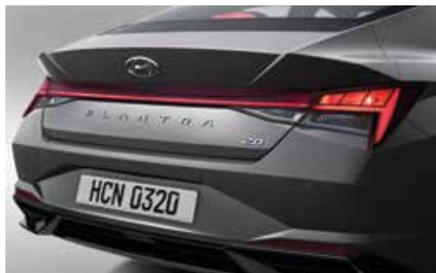
LED + Bulb Rear Combination Lamp