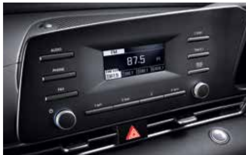
Basic Audio System