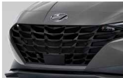
Black Radiator Grille