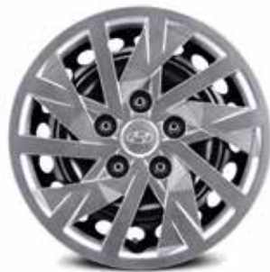
15" Steel Wheel & Wheel Cover