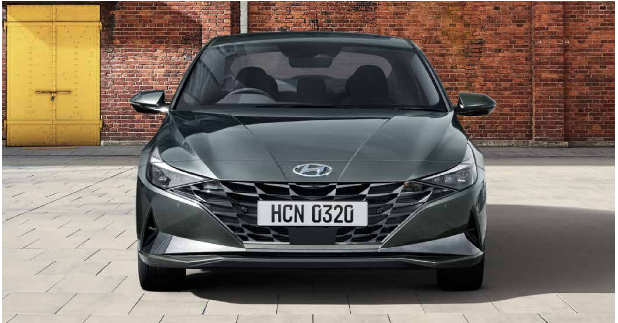
Parametric Jewel Pattern Grille

The stereoscopic Parametric Jewel-pattern design highlights the depth of the front grille, making it resemble diamond-cut gemstones, and the bold and elongated front headlights come together to give Elantra its front sporty look.