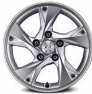
15" Alloy Wheel