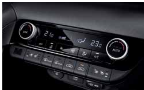
Dual Full Auto Air Conditioner