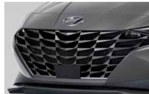
Chrome Radiator Grille