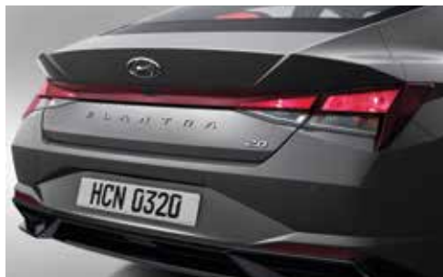
Bulb Rear Combination Lamp