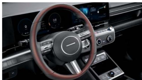
Heated steering wheel