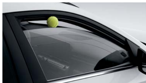
Safety power window