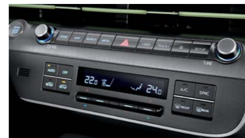
Full auto air conditioning system