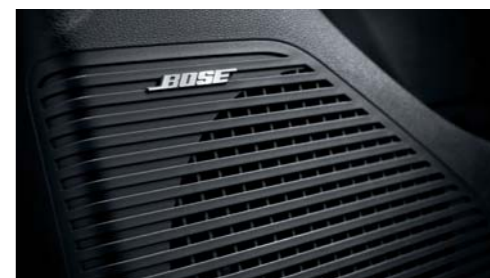
Bose premium audio system