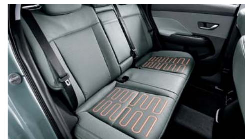
Heated rear seats