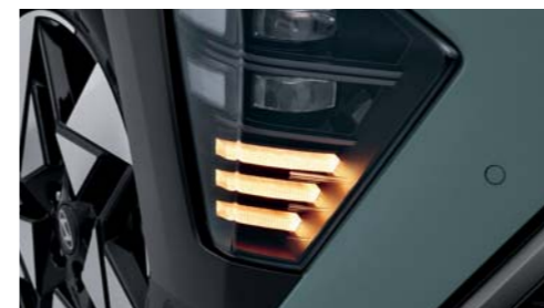
LED turn signal indicators (front/rear)