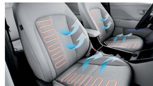
Heated & Ventilated front seats