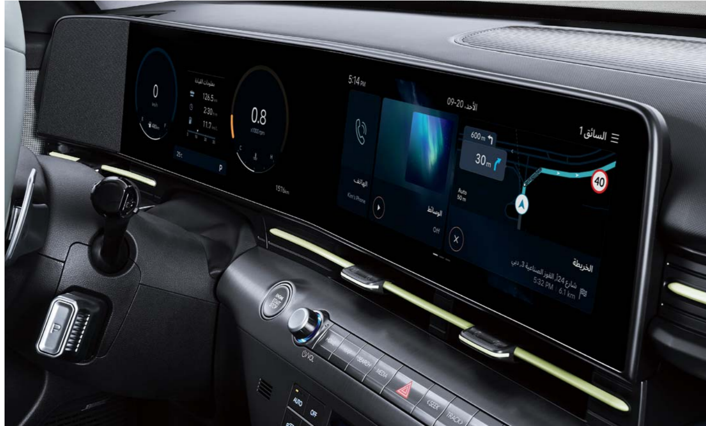
Panoramic display - 12.3-inch integrated dual screen display

The panoramic display - 12.3-inch integrated dual screen display and cutting-edge driver assistance technology offer high-tech convenience and increase user satisfaction in daily use.