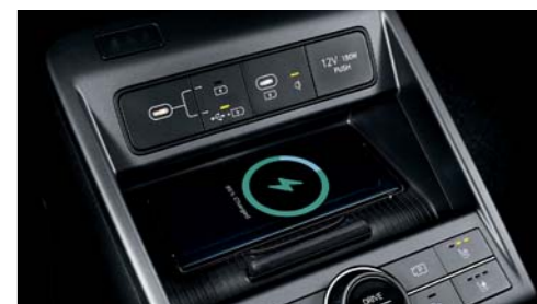
USB-C Data/Charging ports /Wireless charging pad