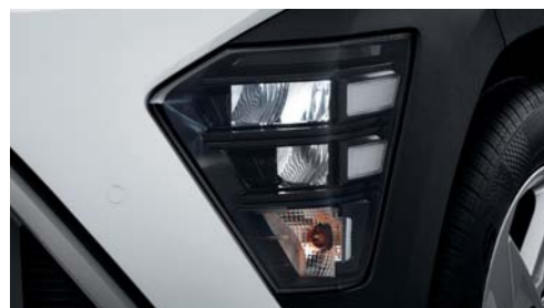
LED Headlamps (MFR)