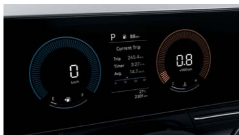
Cluster display (4-inch color LCD)