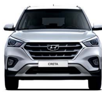
1,544.6 Wheel tread* Overall width 1,780