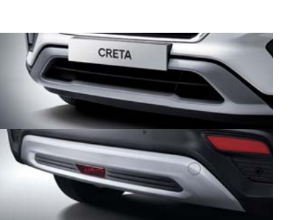
Front and rear skid plate