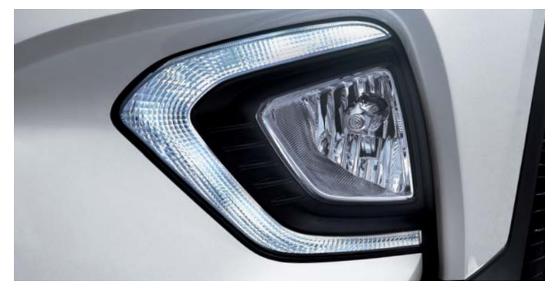
Projection headlamps Fog lamp with LED daytime running lights (DRL)