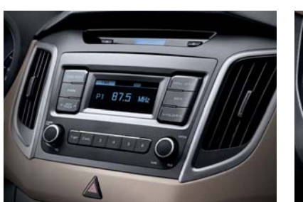
Basic AM / FM MP3 player