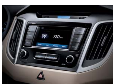
Premium AM / FM MP3 player