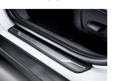
Door scuff plates