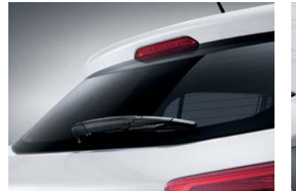
Tailgate wiper Rear spoiler