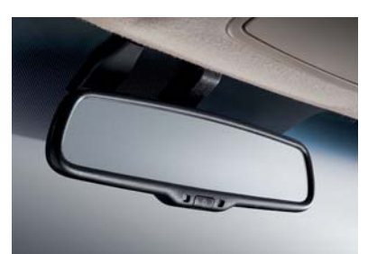
Electronic chromic mirror (ECM)