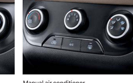
Manual air conditioner