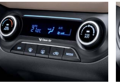
Full auto air conditioner