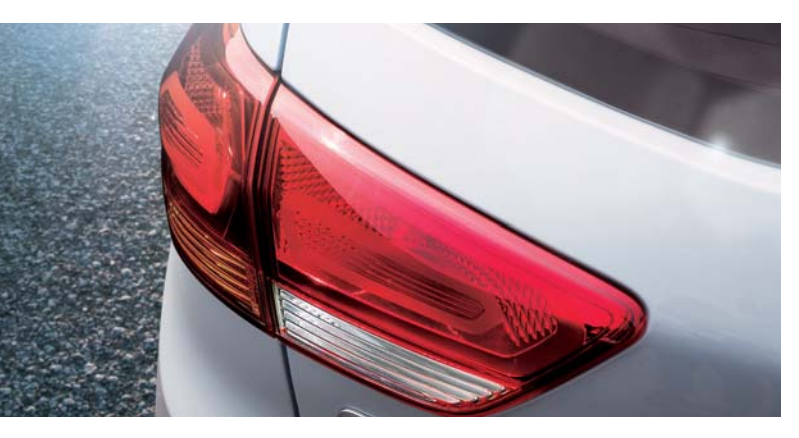
17" alloy wheels Rear combination lamps