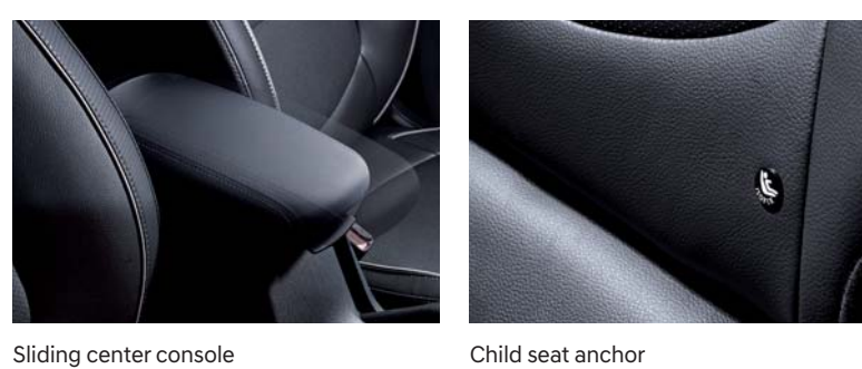
Child seat anchor