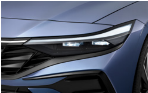
Thin-type Full LED Headlamps