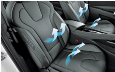
Ventilated Seats (1st Row)