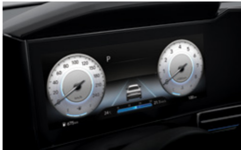
Cluster (10.25-inch colored LCD)