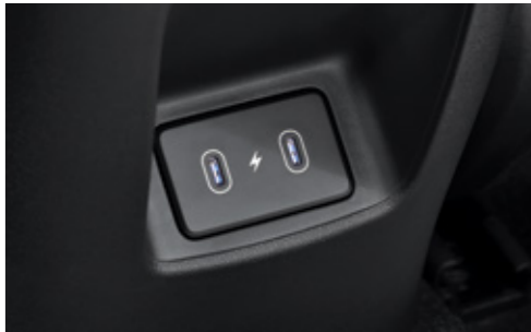
USB-C type Charger (2nd Row)