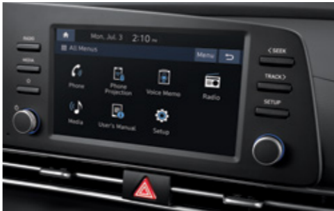
8" Display Audio System