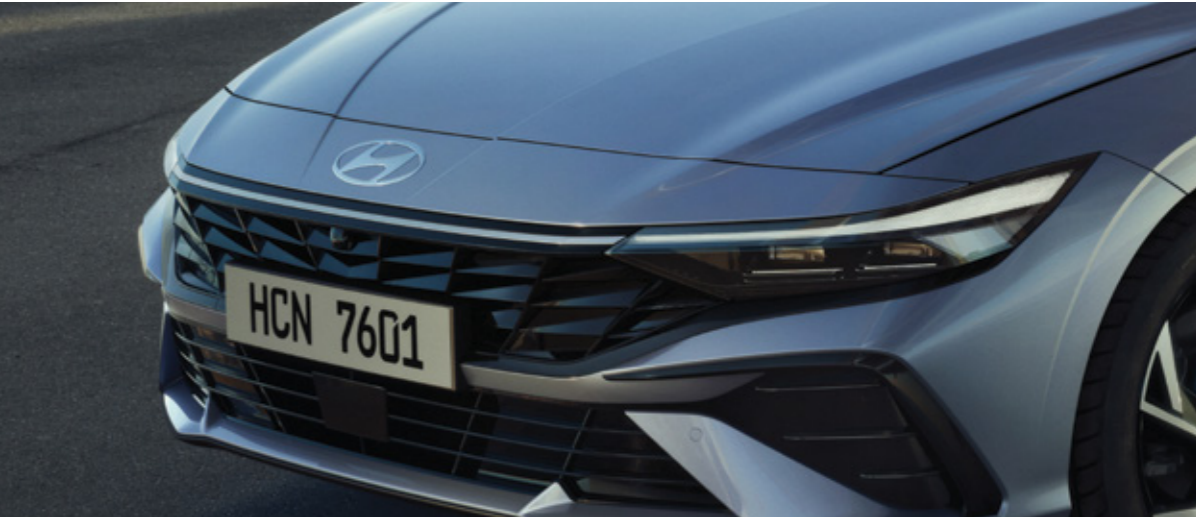
Thin-type Full LED Headlamp