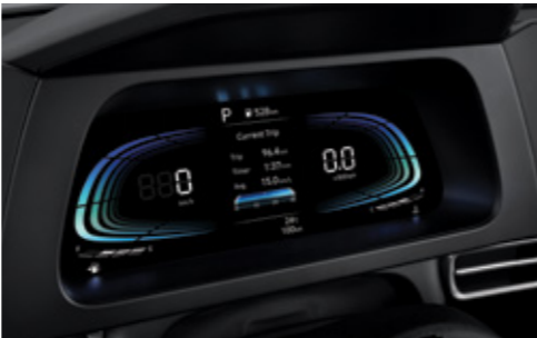
Cluster (4.2-inch colored LCD)