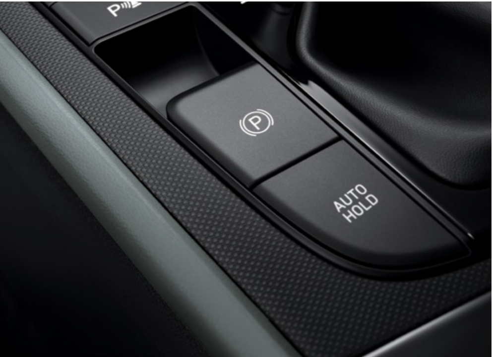
Electric Parking Brake with Auto Hold

Automatically detects whether there are occupants in the rear row of the vehicle. After the ignition is turned off and the driver's-side door is opened, an alarm sounds to reminds the driver to check the rear row for passengers.