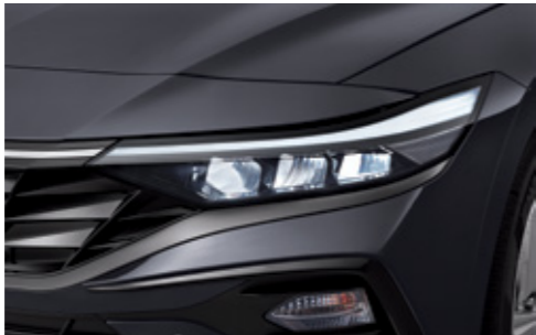
Full LED Headlamps (MFR type)