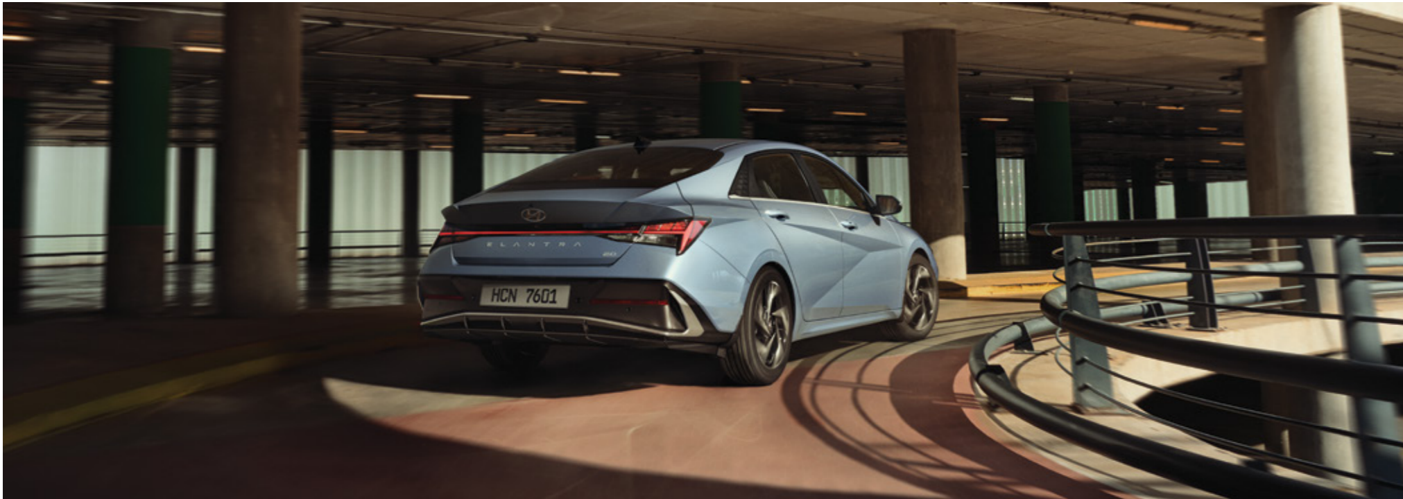
Gamma II 1.5L Engine, CVT

The new ELANTRA offers excellent fuel efficiency, a quiet ride and reliable R&H performance for the ideal everyday driving experience.