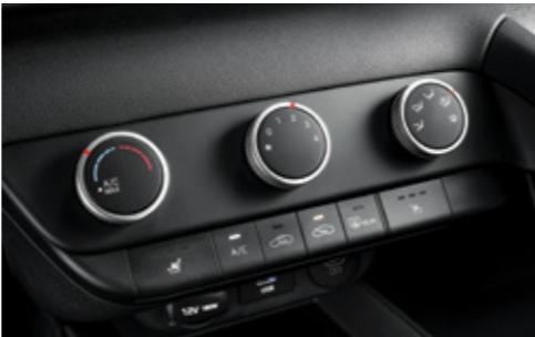
Manual Air Conditioner