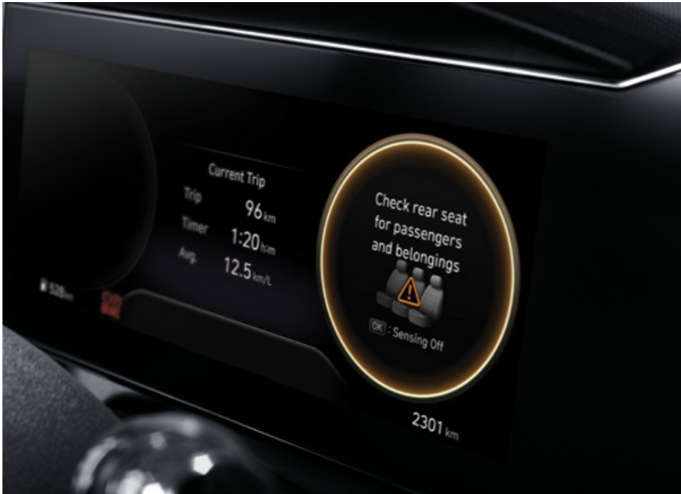
Rear Occupant Alert

Revel in the safety of premium models with the new ELANTRA.