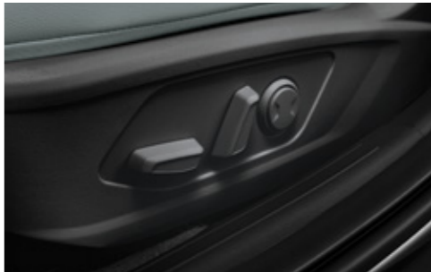
Power Driver's Seat (8-way, lumbar support)