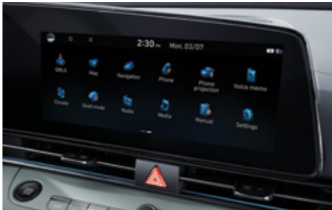
10.25-inch Navigation Display