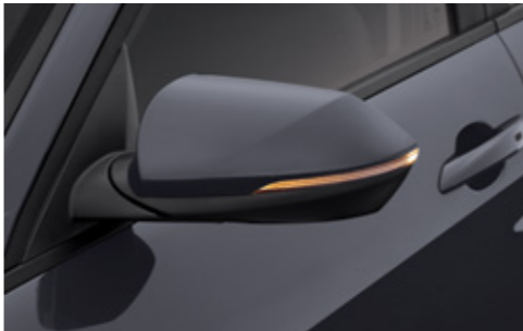
Exterior Sideview Mirrors (heated, power folding, LED turn signal indicators)