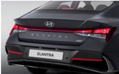
Bulb Rear Combination Lamp