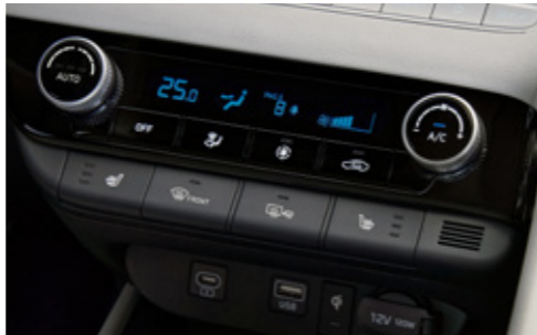
Automatic Air Conditioner