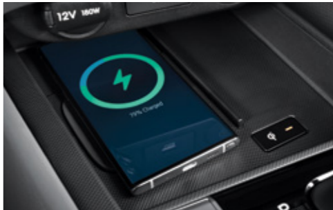
Wireless Smartphone Charger