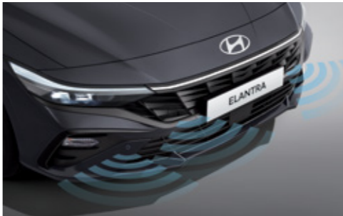
Parking Distance Warning (Forward/Reverse)