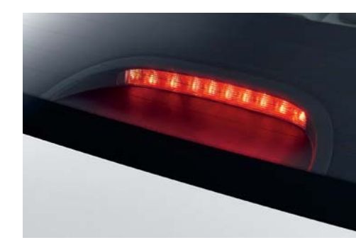
High-mounted stop lamp