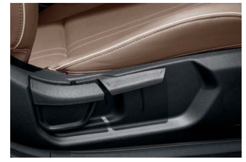
Driver seat height adjuster