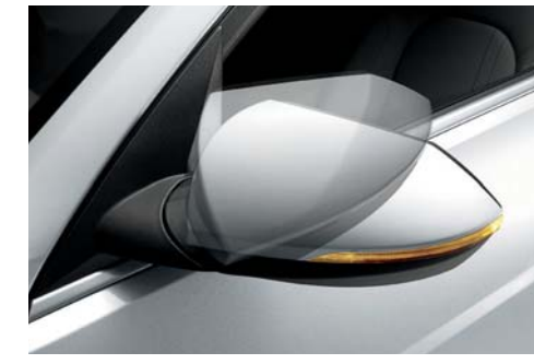
LED turn signal indicators (OPT)