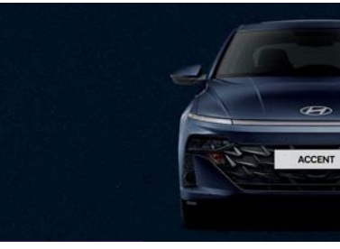
Midnight Blue Pearl_UB7