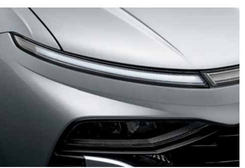
LED Daytime Running Lights