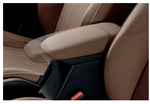
Slide console box