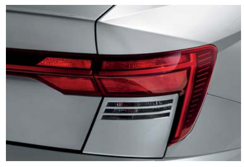
Rear combination lamps (Bulb-type)