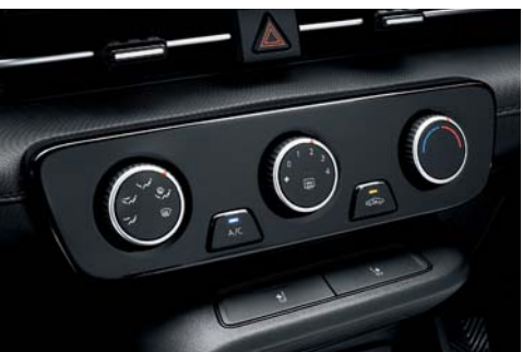
Manual air conditioning system