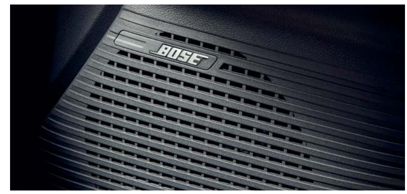
Bose<sup>®</sup> premium sound system