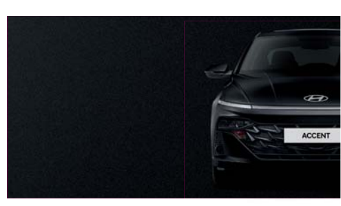
Abyss Black Pearl_A2B