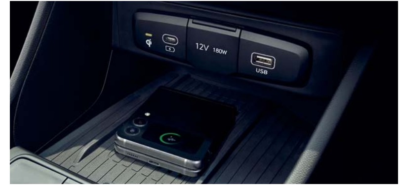
Wireless phone charger / Front C-type charger