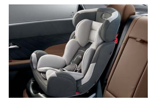
Child anchor system