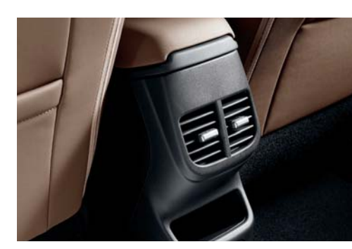
Rear air vent