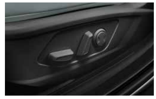
Power Driver's Seat (8-way, lumbar support)