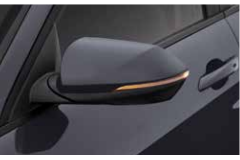
Exterior Sideview Mirrors (heated, power folding, LED turn signal indicators)