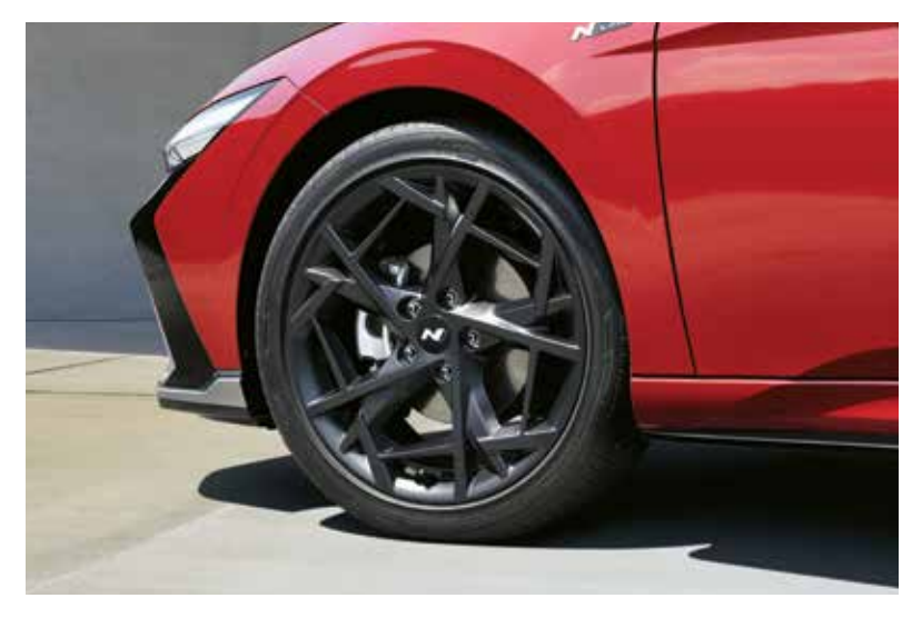
N Line Exclusive 18-inch Alloy Wheels and Tires