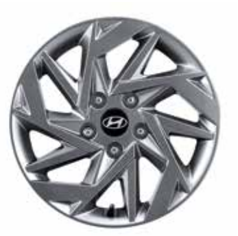
16" Alloy Wheel