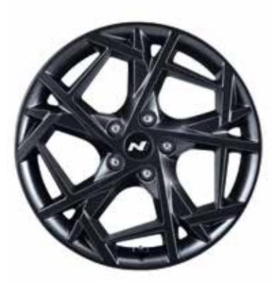
18" Alloy Wheel(N Line)