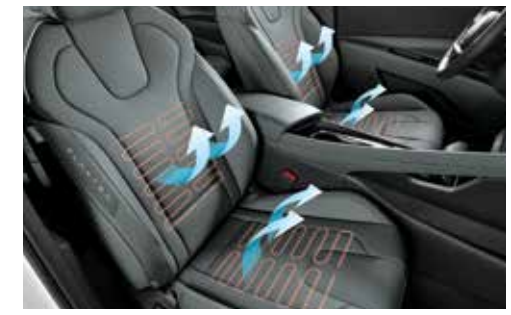
Heated & Ventilated Seats (1st Row)