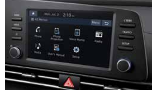
8" Display Audio System (matt, when selecting 4.2" color LCD cluster display)