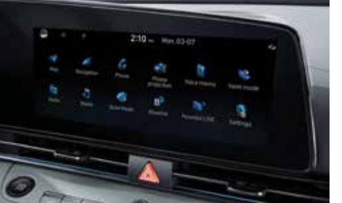
10.25-inch Navigation Display