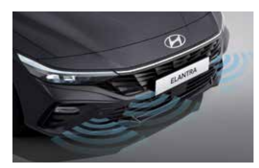
Parking Distance Warning (Forward/Reverse)