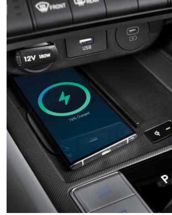
Wireless Smartphone Charger Simply place your phone on the charging pad to enjoy improved charging performance.

Watch the colors change depending on your speed and driving mode. Provides 64 different colors including 10 representative colors.