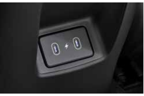
USB-C type Charger (2nd Row)