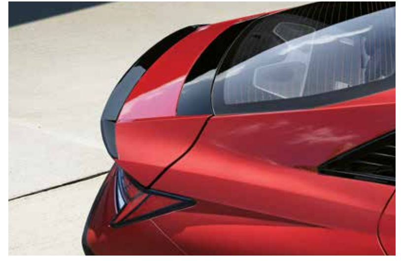
N Line Exclusive Lip-type Rear Spoiler