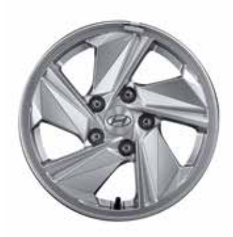
15" Alloy Wheel