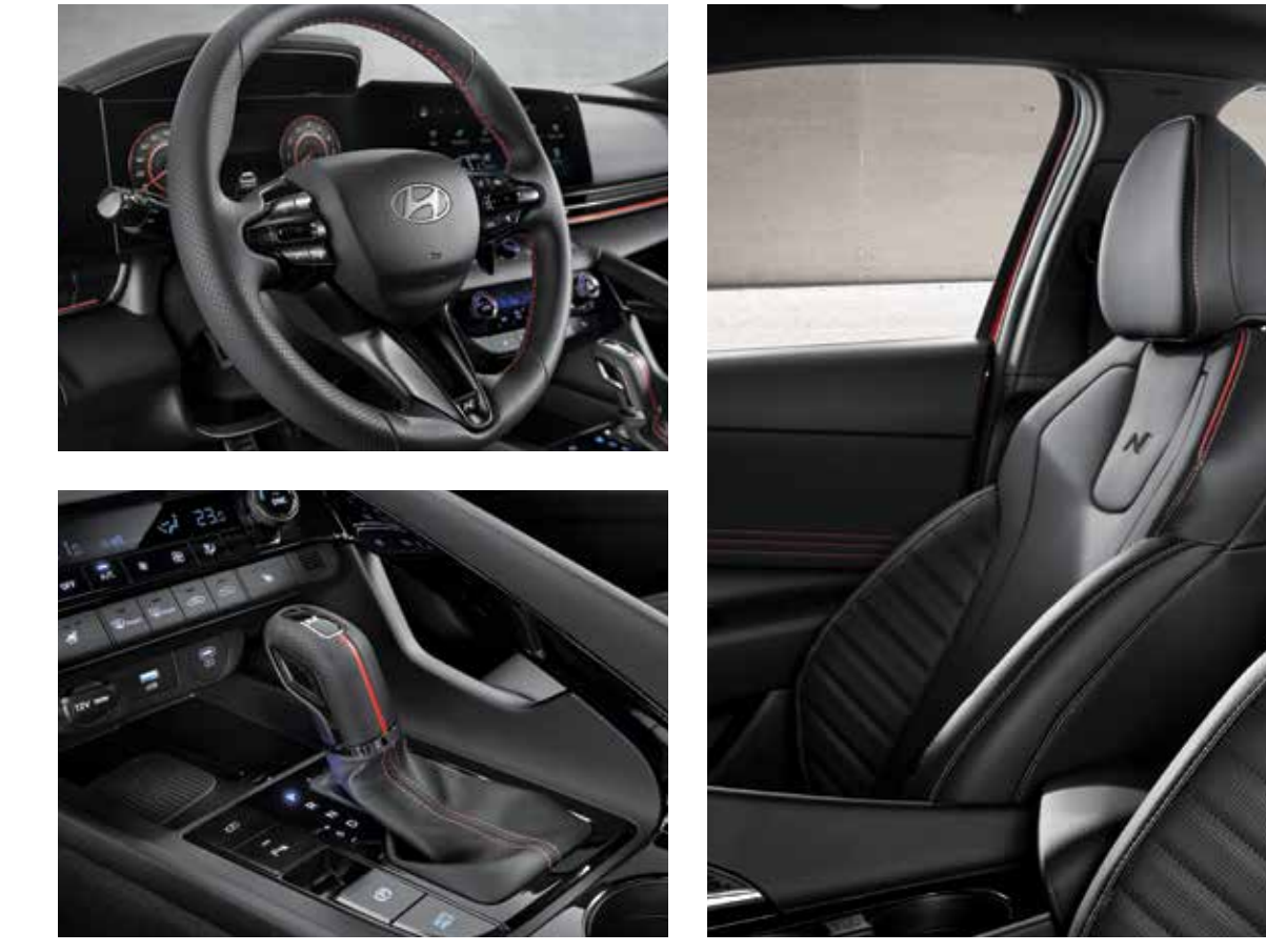
N Line Exclusive Sports Steering Wheel with Extended Paddle Shifters N Line Exclusive Authentic Leather Seats N Line Exclusive Leather Gear Knob

The exclusive design with high-performance N DNA and the red accent offers an immersive driving experience.