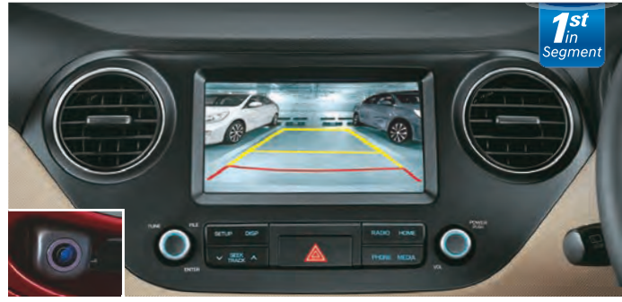
Rear Parking Assist System (with display on 7.0 Audio Screen)