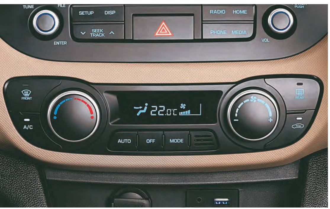
Fully Automatic Temperature Control