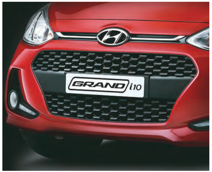
Cascade Design Grille - Bold New Design Identity