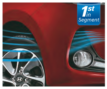
Front Air Curtains