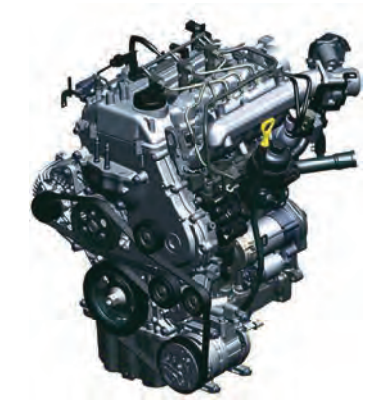
New | Bigger | Powerful 1.2L 2nd Gen U2 CRDi Diesel Engine