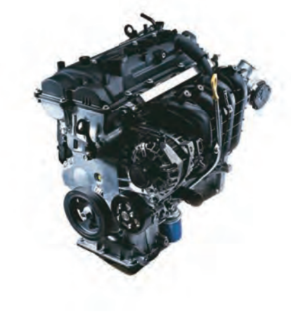
1.2L Kappa Dual VTVT Petrol Engine Max. Power 83ps/6,000rpm