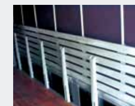
Foldable bench (Folding)