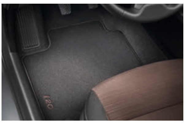
Textile floor mats, velour with brown accent. Luxurious velour mats with brown stitching and i20 logo. Secured by the standard fixing point and anti-slip backing. Available also in grey, blue grey and beige.