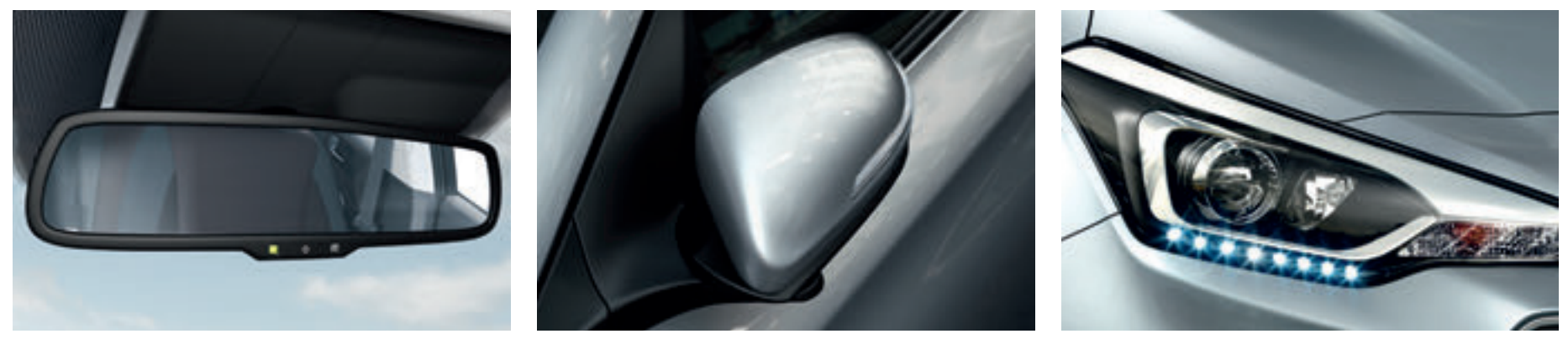
Electro-chromatic mirror (ECM). The interior mirror automatically darkens when its sensor detects glare from the headlights of following vehicles.