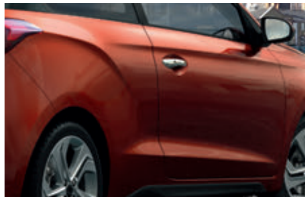
Sculpted side panels. Confident, dynamic shapes underline the Coupé's Coupé aesthetics. The side windows swoop down to join the gloss black sportier character.