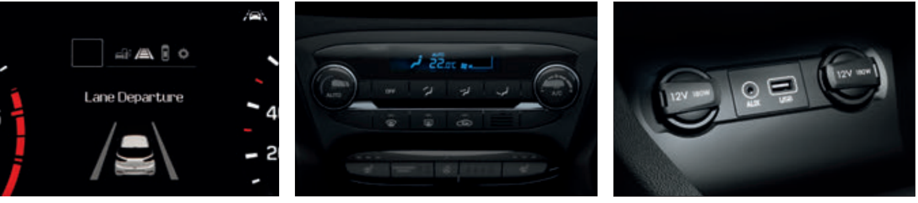
Lane departure warning system. Instant visual and audible warning of unintentional departure from the lane you're driving in.