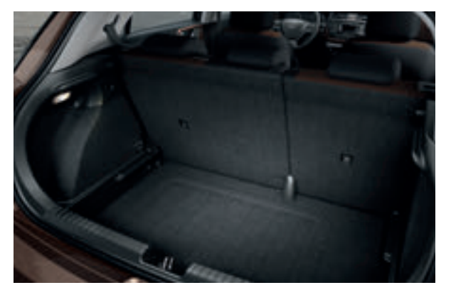
2 different heights to create either a flat load floor when seats are folded flat, or a deeper load space if preferred.