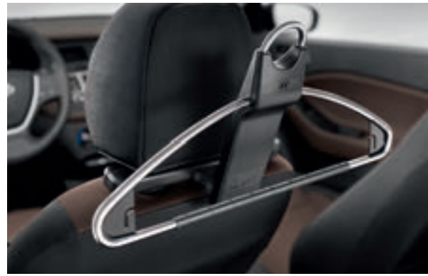
Business suit hanger. Keeps clothes tidy and crease–free during journeys. It attaches easily and securely to the front seat and can be quickly detached for use elsewhere. Meets current occupant safety requirements.