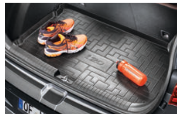
Trunk liner. A light, waterproof and durable trunk liner with raised edges protects the trunk floor from dirt, spills and grime. A perfect fit, and branded with the i20 logo.