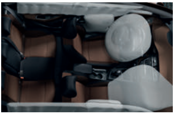
6 airbags. All-round protection with 2 front, 2 side and 2 curtain airbags.