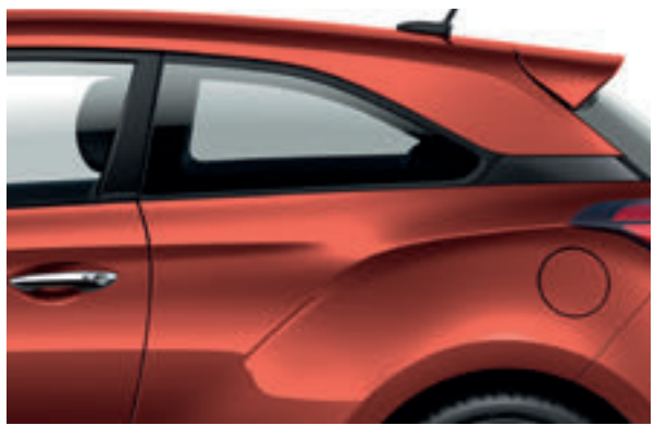
insert at the base of the sloping c-pillar.