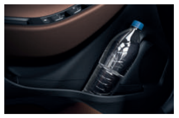
Bottle stowage in doors. 1.5 litre bottles can be securely stowed in the front door pockets, while the rear doors can accommodate 1 litre bottles.