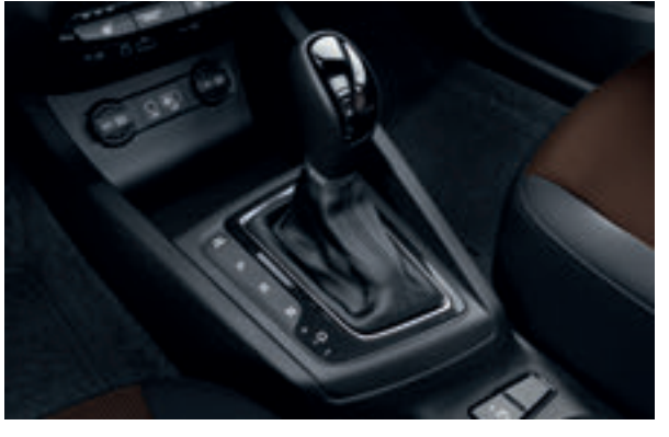
Transmissions. The 6-speed manual transmission is standard with all engines except the 1.25-litre engines that are equipped with a 5-speed manual. A 4-speed automatic transmission is available for the 1.4-litre petrol engine.