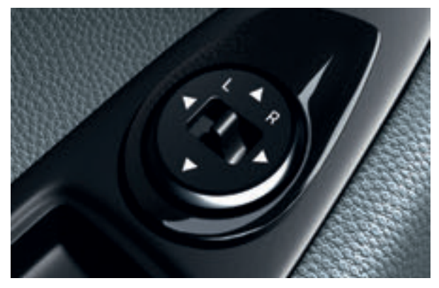
Powered and heated door mirrors. The door mirrors can be remotely adjusted and heated from the door console.