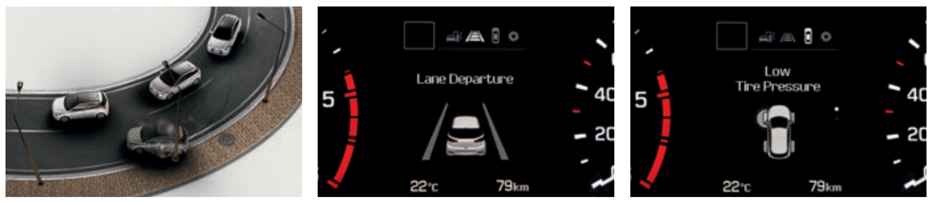
Electronic Stability Control. Works unobtrusively with Vehicle Stability Management to maintain grip and control especially on low-friction surfaces.

And we're passionate about introducing more safety to this market segment, so the chassis and body structure make extensive use of ultra-high-strength steel. Besides rain sensors and automatic lights, the new i20 also offers the sophistication of cornering lights, Lane Departure Warning System and Tyre Pressure Monitoring System.