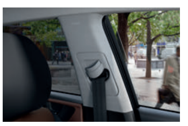
Height-adjustable seat belts. The upper front seatbelt mounts are height-adjustable for improved safety and comfort.

Tyre Pressure Monitoring System. Senses and indicates the loss of pressure in individual tyres.