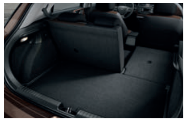
Split-fold rear seat. The rear seats can be folded flat in the ratio 60:40 Adjustable load space floor. The luggage floor can be located at to create a conveniently versatile load space.

Whatever your day has in store, your new i20 has the versatility to help you on your way. The class-leading 326-litre trunk volume can be increased to 1042 litres by folding the rear seats flat. The luggage floorboard can be moved up or down as required, and there are numerous stowage possibilities located conveniently throughout the cabin.