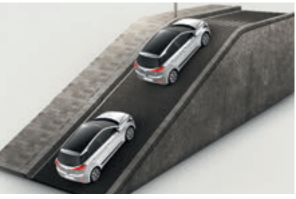
Hill Start Assist Control. Prevents unintentional rollback when starting on hills.

Lane Departure Warning System. First visual, then audible warning when leaving a traffic lane without signalling.