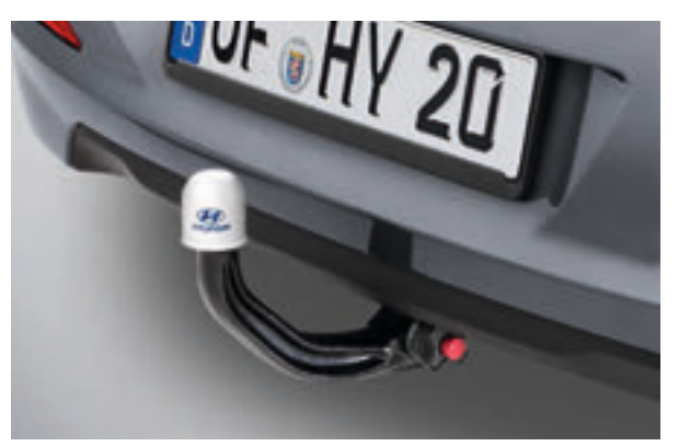
Tow bar, vertical detachable. In high-quality steel with a 3-ball locking system for easy and secure mounting. Out of sight when not in use. Maximum gross payload for bike carrier usage is 75 kg.