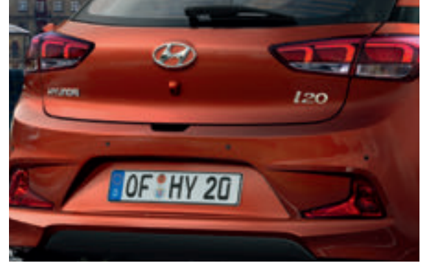
bumper and accentuates the wide-track stance of the Coupé.