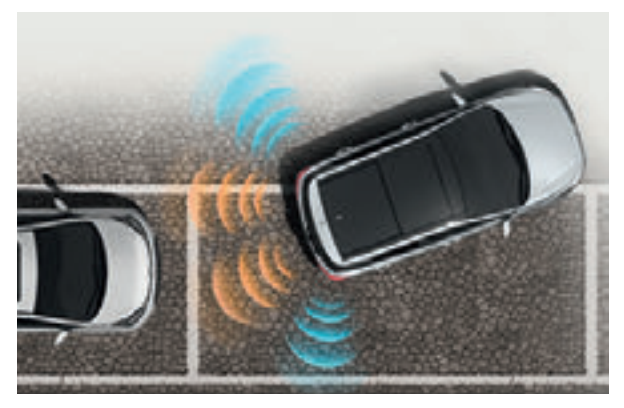
Parking sensors. Rear parking sensors make it easier to park in confined spaces.