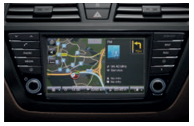
Audio system. RDS radio with CD/MP3 player and Bluetooth connectiv- Integrated navigation system. Easy-to-use navigation system with an

ity and IGB storage. The system can also be operated by controls on impressive 7" screen seamlessly integrated into the dashboard. the steering wheel. The Bluetooth brand is the property of Bluetooth SIG Inc