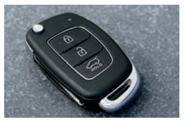
Remote locking & unlocking. Doors and tailgate can be locked or unlocked via the buttons on the key.