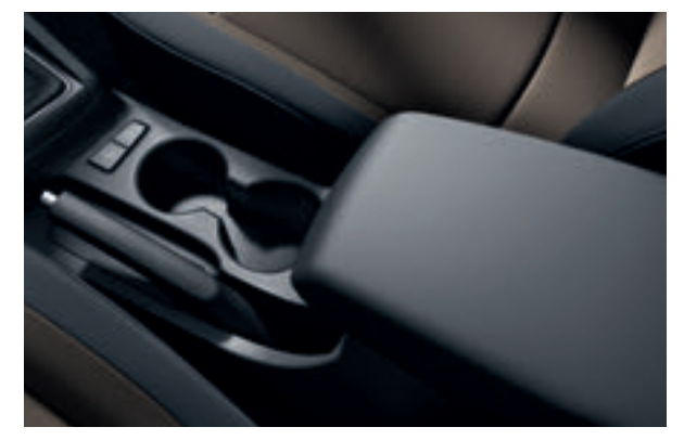
Centre console and armrest. Extra stowage in the centre console with