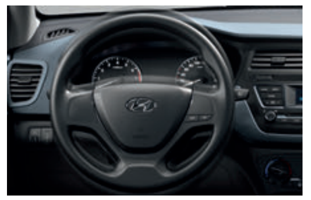
Adjustable steering wheel. The steering wheel is adjustable for both reach and rake.

See page 33 for a comprehensive overview of available exterior and interior colour combinations.