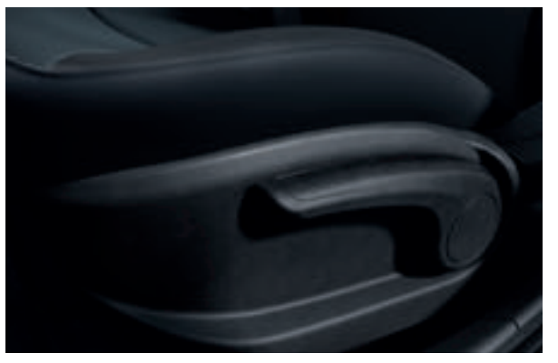
Height-adjustable driver's seat. Optimize your driving position with the height adjustable driver's seat.