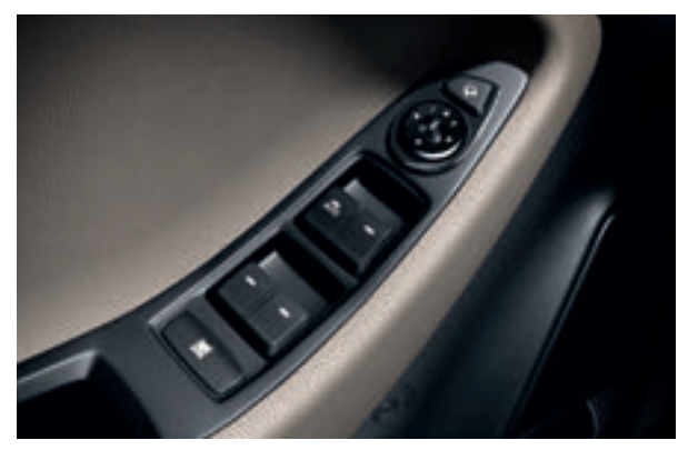
Electric windows in all doors. The driver's window has a one-touch Auto up/down function with anti-trap feature.

See page 33 for a comprehensive overview of available exterior and interior colour combinations.