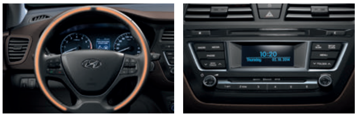
Heated steering wheel. A boon when starting your drive on a cold winter morning.