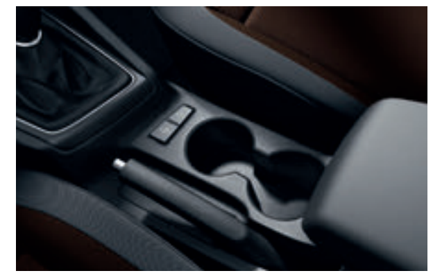
Cup-holders. Conveniently positioned between the front seats.