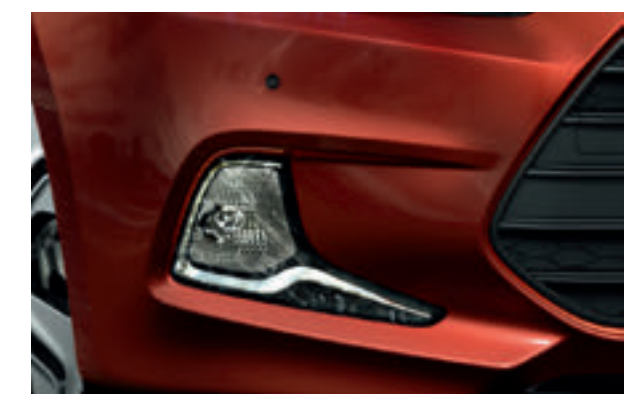
Bold design details. The front fog lamps sit in sculpted recesses that Rear bumper. The striking design echoes the styling of the front emphasize the expressive shape of the Coupé's front grille.

The New Generation i20 Coupé offers similar user-friendly practicality to the 5-door model. Easy-entry front seats with memory function provide effortless access to the rear seats, and the 336-litre trunk volume is simply the best in the class. The stylish orange accents of the optional Coupé interior pack (see left) go especially well with the "Tangerine Orange" exterior colour.