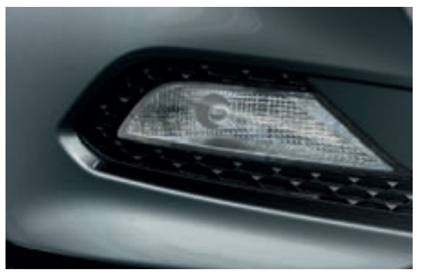
Front fog lights. Additional front lighting helps illuminate the way through fog and heavy rain.