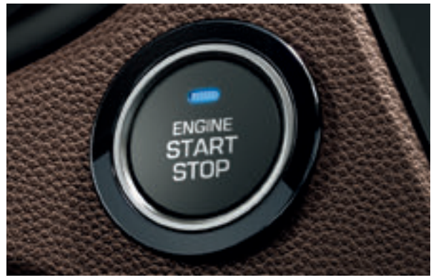
Engine start/stop button. Keyless starting when the smart key is on board in your pocket or bag.