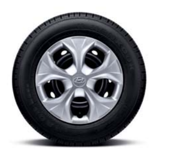
15" Steel wheels