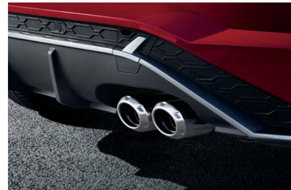
N Line-exclusive single twin tip muffler