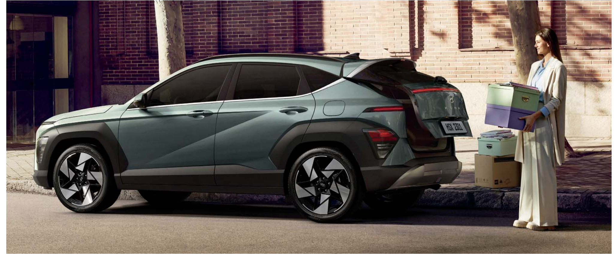
Smart power tailgate - Hands-free smart liftgate with auto-open and adjustable height setting