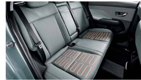
Heated rear seats