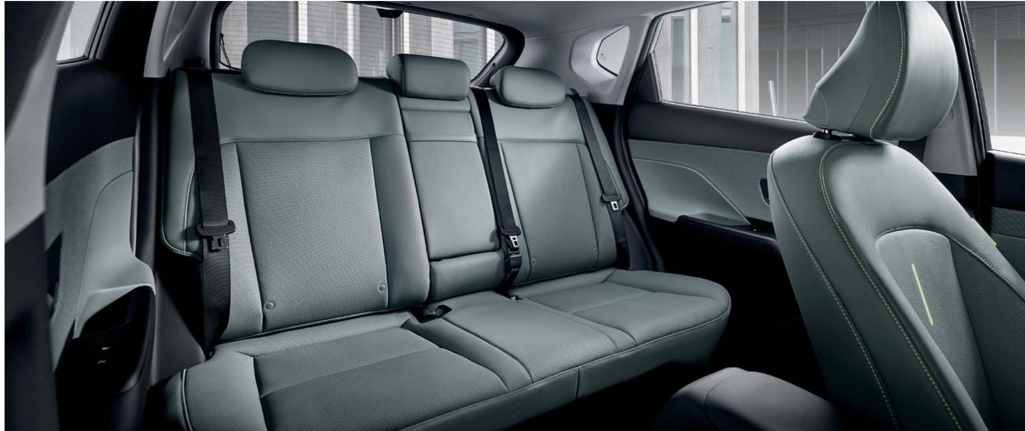
2nd row space

KONA's interior is practical and spacious, with a focus on the comfort of rear passengers and ample luggage space to cater to different lifestyles.