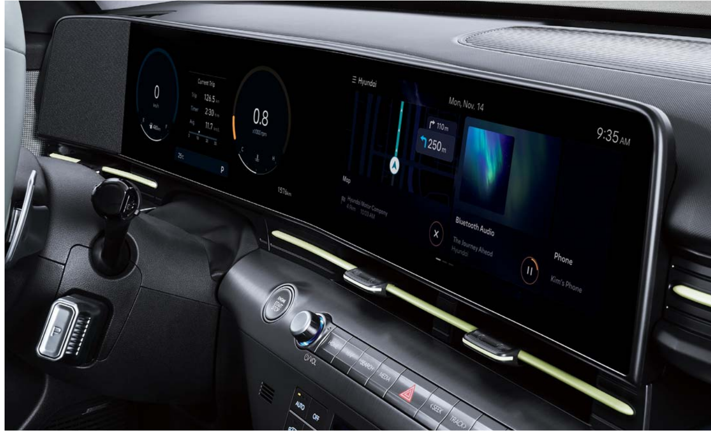
Panoramic display - 12.3-inch integrated dual screen display

The panoramic display - 12.3-inch integrated dual screen display and cutting-edge driver assistance technology offer high-tech convenience and increase user satisfaction in daily use.