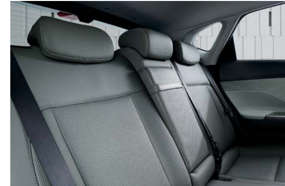
2nd-row seatback 2-step latch