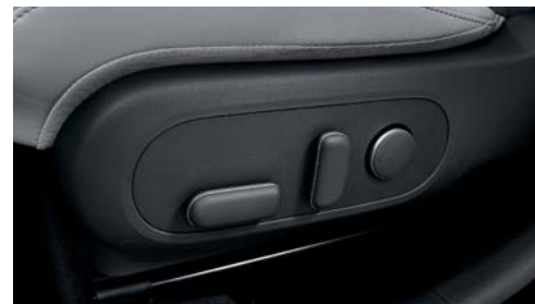
Powered driver seat