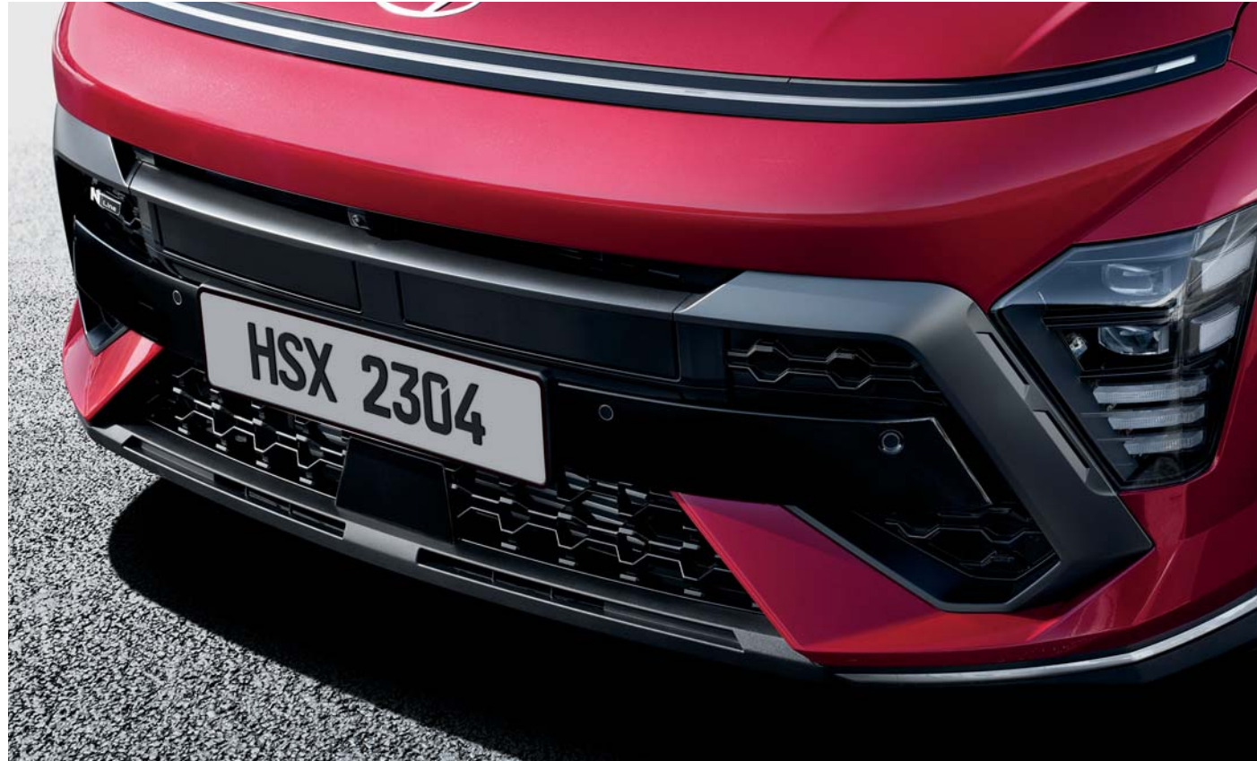
N Line-exclusive front bumper & bumper skirt

The N Line exudes boldness and dynamism, featuring a high-performance exterior design inspired by the renowned high-performance N.