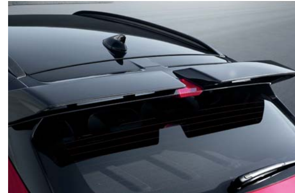
N Line-exclusive wing-type rear spoiler