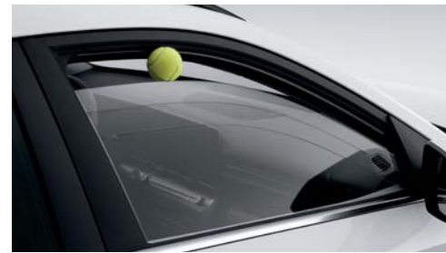
Safety power window