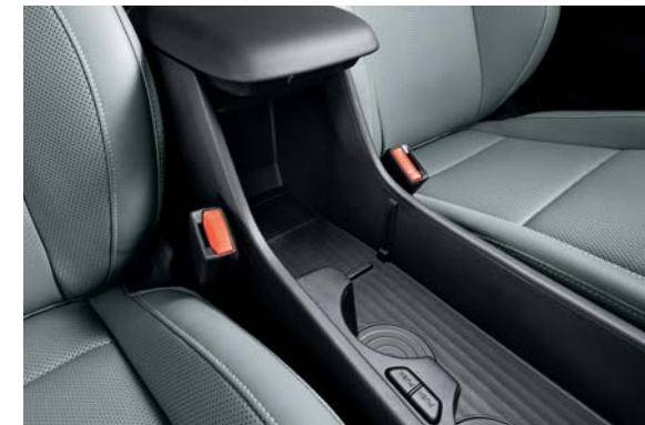
Open console storage (removable bulkhead / rotational cup holders)