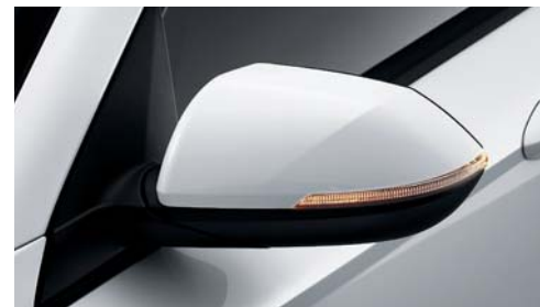
Outside mirror (Heated / Folding / Turn signal indicator LED)