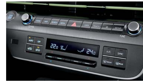
Full auto air conditioning system