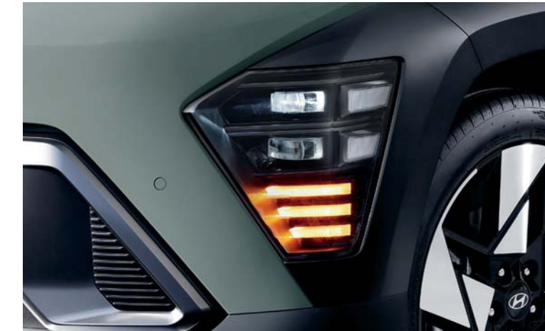
Full LED headlamps (projection type)