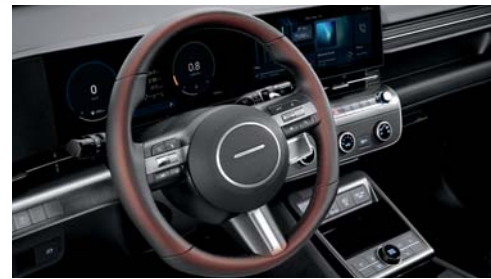
Heated steering wheel