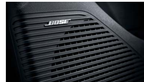
Bose premium audio system