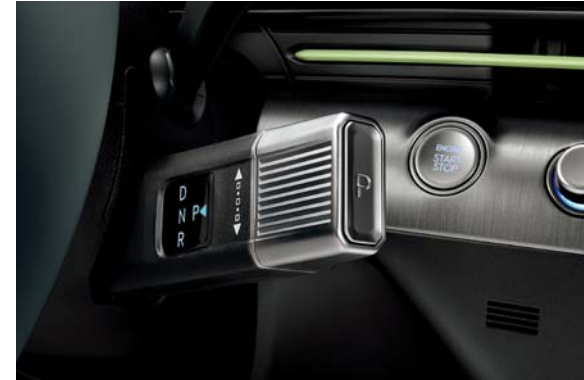
Column-Type Shift by Wire (SBW)