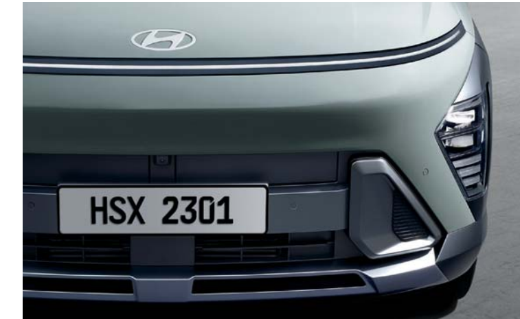
Front seamless horizon lamp, front bumper