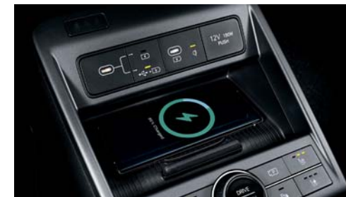
USB-C Data/Charging ports /Wireless charging pad