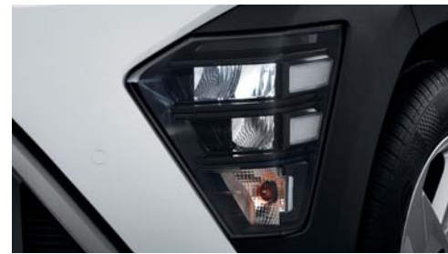
LED Headlamps (MFR)