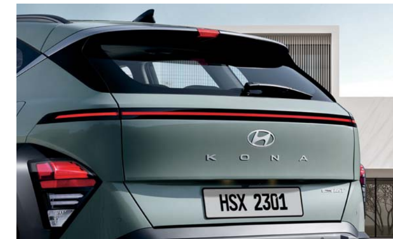
Spoiler Integrated HMSL, rear seamless horizon lamp LED brake lamps, LED turn signal lamps