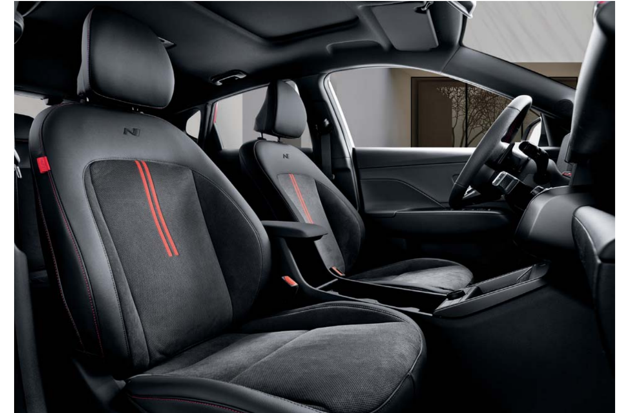
N Line-exclusive authentic leather / Alcantara combination seats