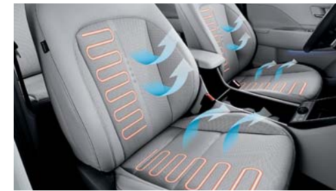
Heated & Ventilated front seats