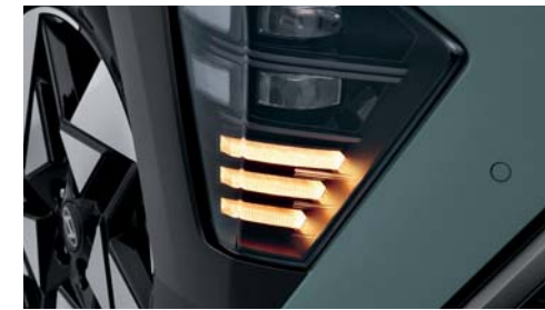
LED turn signal indicators (front/rear)