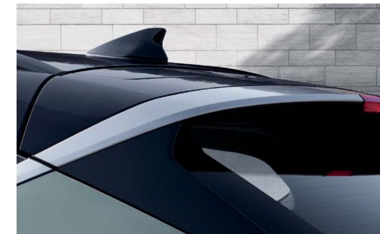
Dual tone roof, sharp connecting chrome line