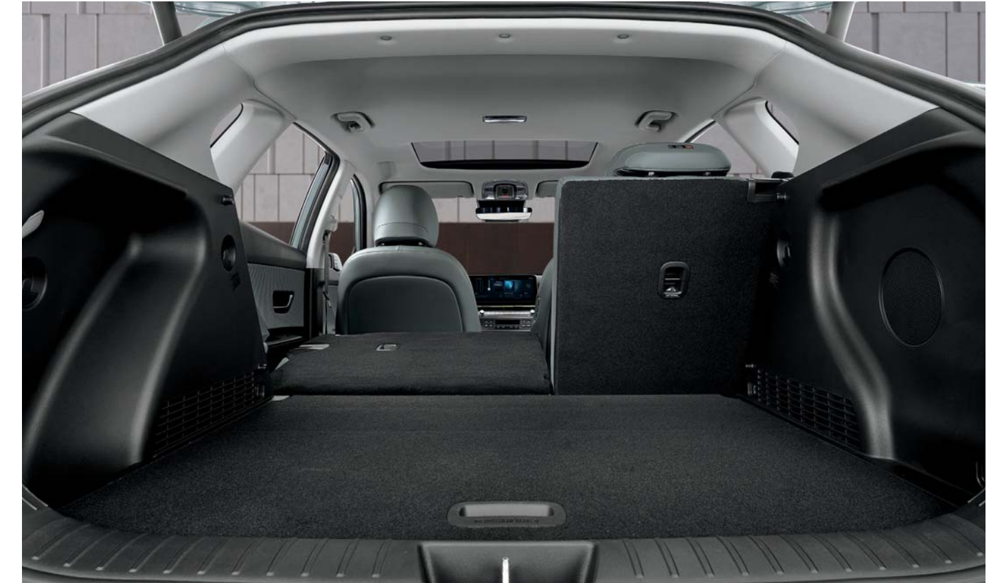
6:4 folding 2nd row seat backs