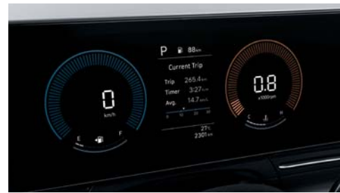
Cluster display (4-inch color LCD)