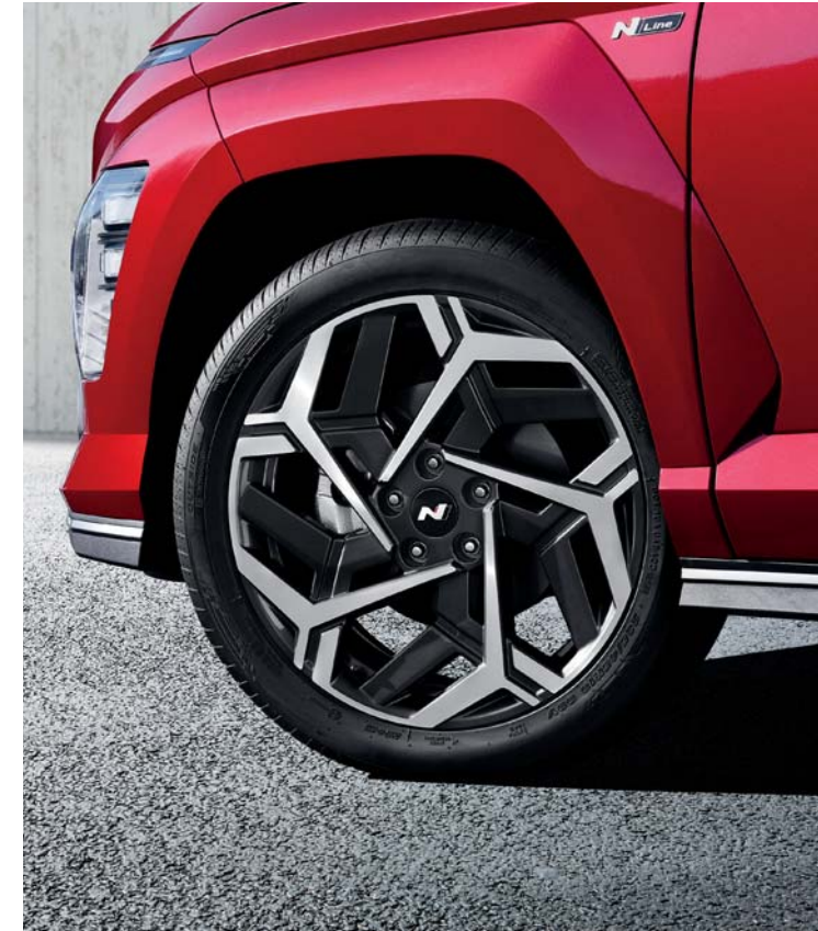
N Line-exclusive 19-Inch alloy wheels / Body-colored cladding