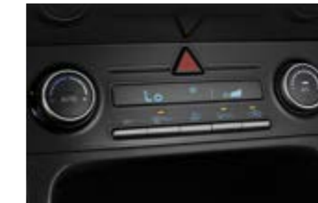
Full Automatic Temperature Controls