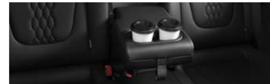
Rear Center Armrest with Cup Holders