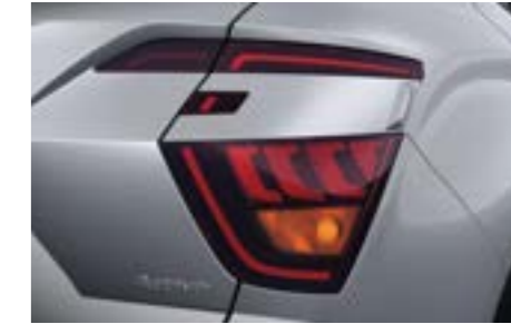
LED Rear Tube Lamp