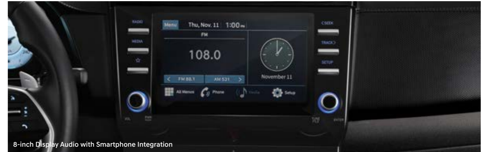
8-inch Display Audio with Smartphone Integration