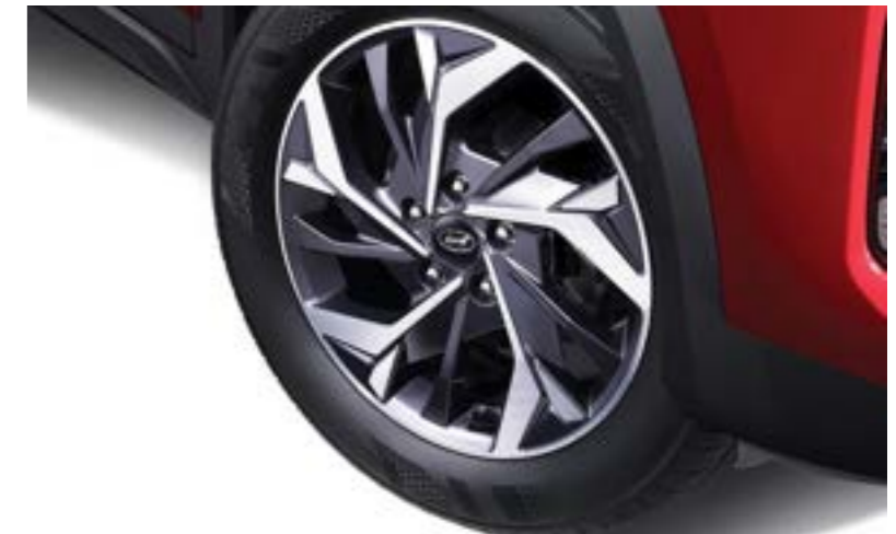
17-inch Diamond Cut Alloy Wheels