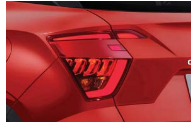
LED Rear Combination Lamp