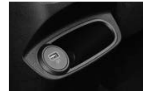
Rear USB Charging Port