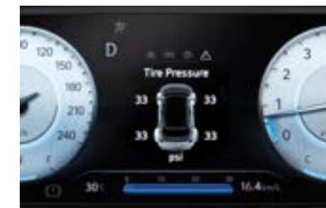
TPMS (Tire Pressure Monitoring System)