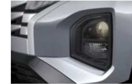
Halogen Projection Headlamps