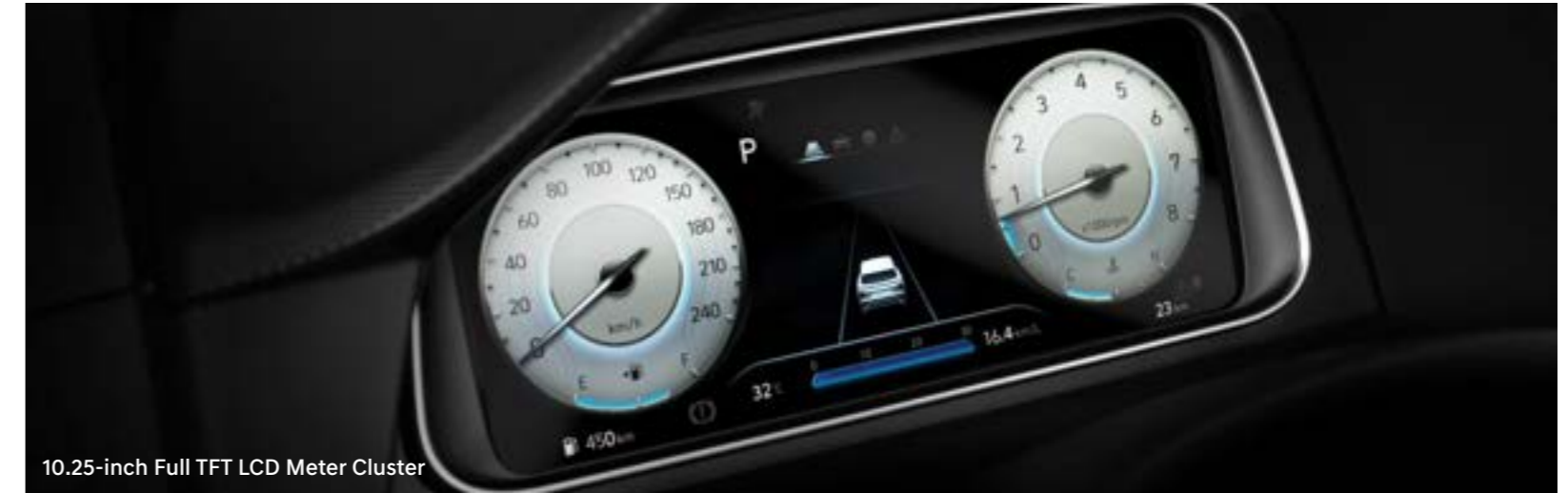
10.25-inch Full TFT LCD Meter Cluster