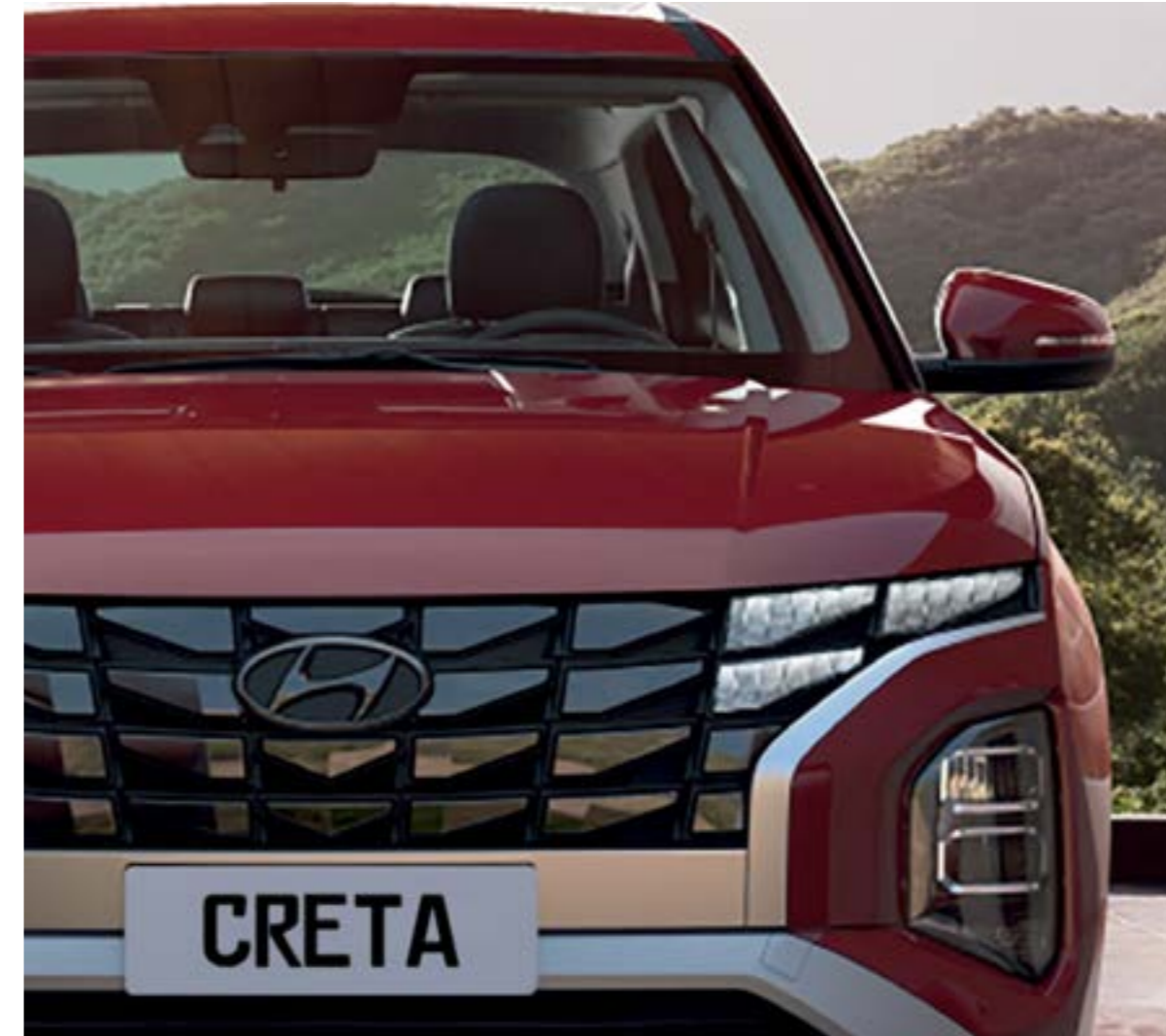
Parametric Jewel Pattern Grille & Hidden-type LED DRL