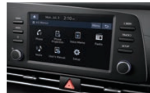
8" Display Audio System (matt, when selecting 4.2" color LCD cluster display)