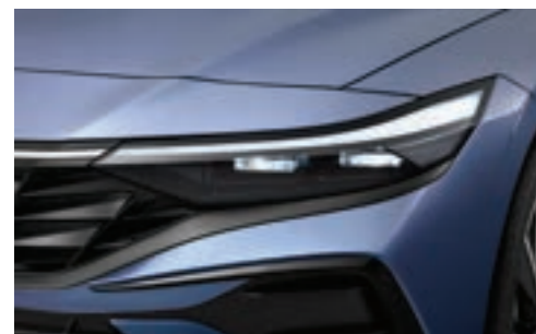
Thin-type Full LED Headlamps