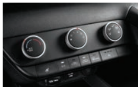
Manual Air Conditioner