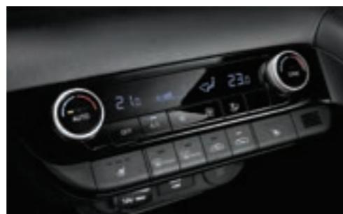
Dual Full Auto Air Conditioner