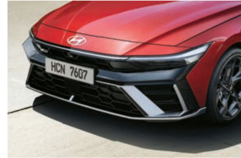
N Line Exclusive Front Bumper