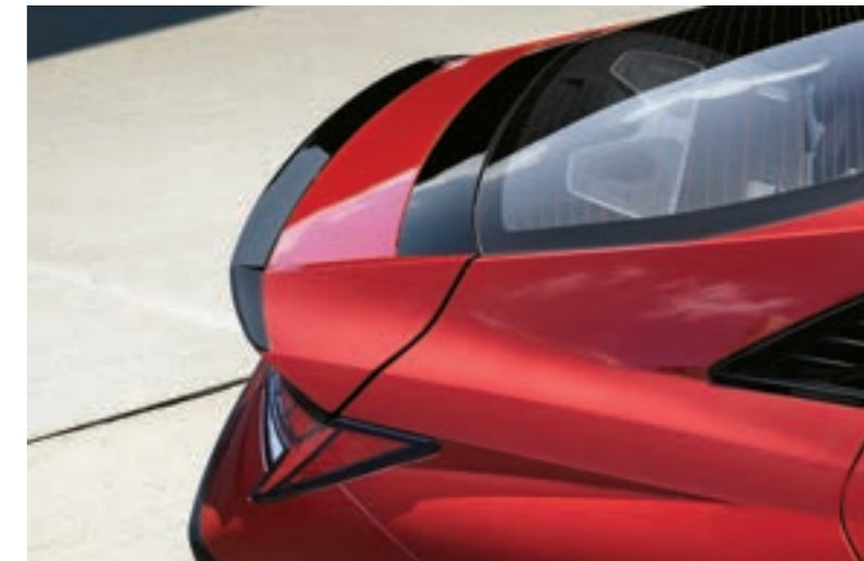
N Line Exclusive Lip-type Rear Spoiler