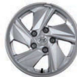
15" Alloy Wheel