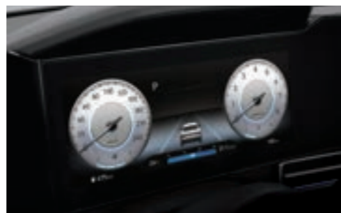
Cluster (10.25-inch color LCD)