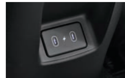
USB-C type Charger (2nd Row)