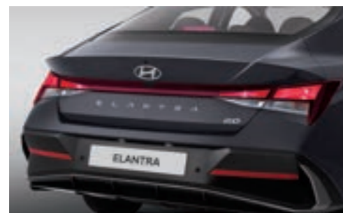
Bulb Rear Combination Lamp