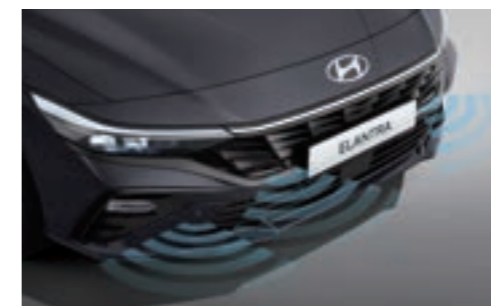
Parking Distance Warning (Forward/Reverse)