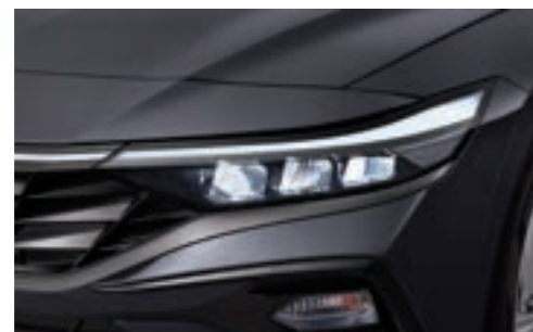
Full LED Headlamps (MFR type)