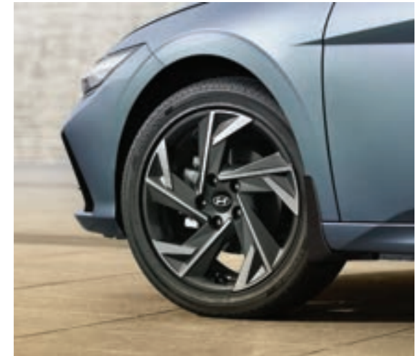
17" alloy wheels & tires