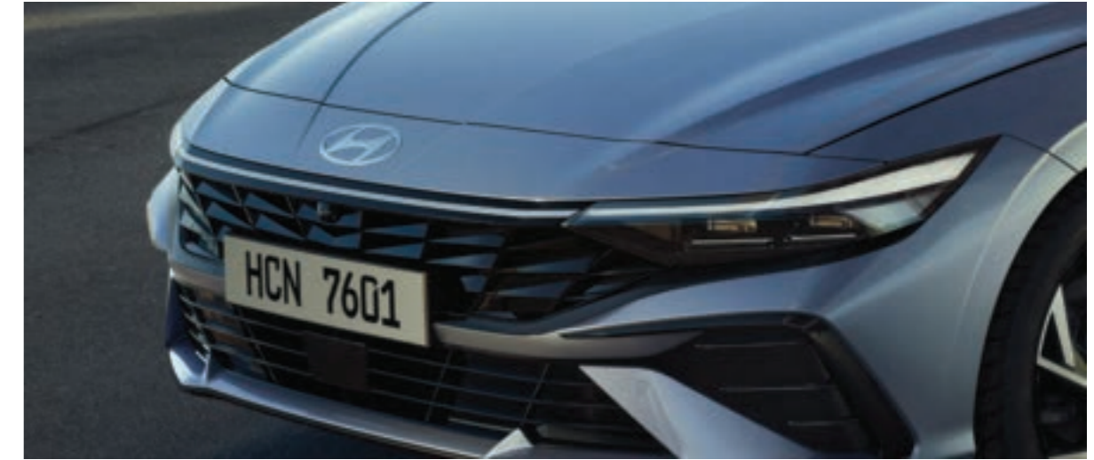
Thin-type Full LED Headlamp