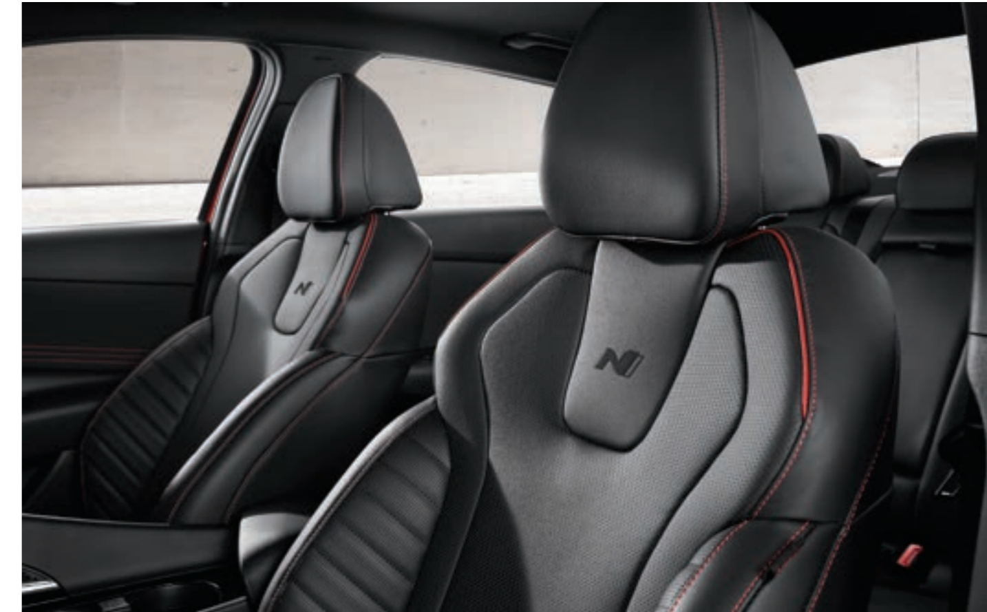
N Line Exclusive Authentic Leather Seats