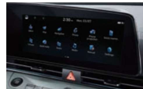
10.25-inch Navigation Display