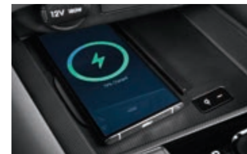
Wireless Smartphone Charger