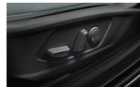
Power Driver's Seat (8-way, lumbar support)