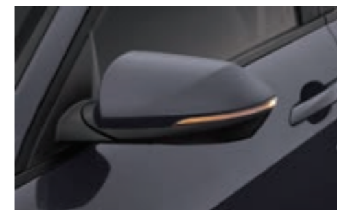
Exterior Sideview Mirrors (heated, power folding, LED turn signal indicators)