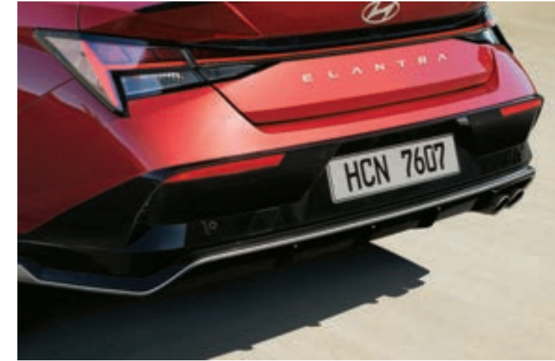
N Line Exclusive Rear Bumper