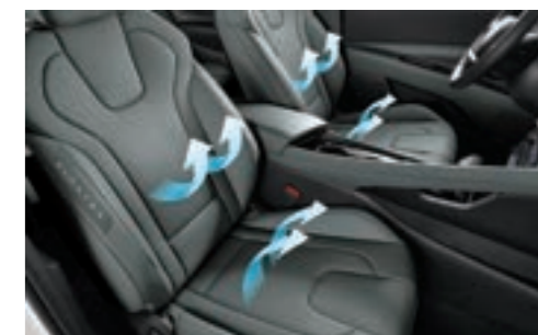
Ventilated Seats (1st Row)