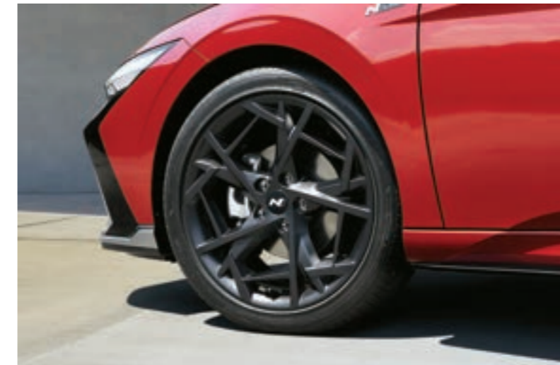
N Line Exclusive 18-inch Alloy Wheels and Tires