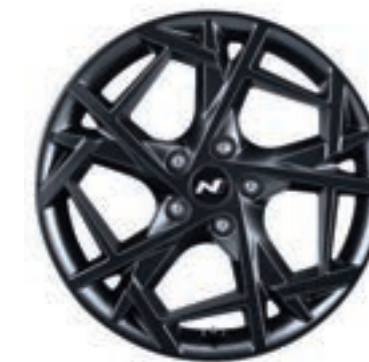
18" Alloy Wheel(N Line)