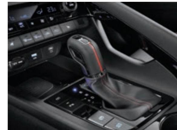
N Line Exclusive Sports Steering Wheel with Extended Paddle Shifters N Line Exclusive Leather Gear Knob