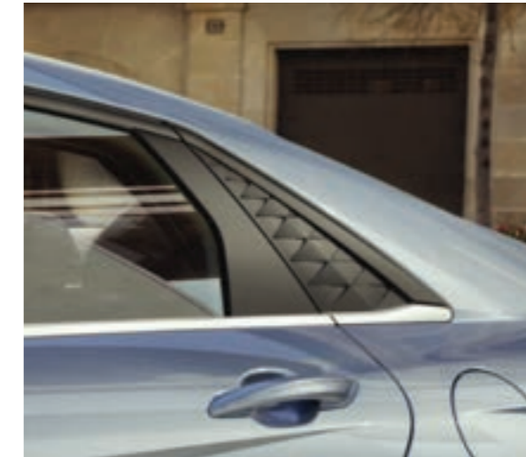
Quarter Glass Cover