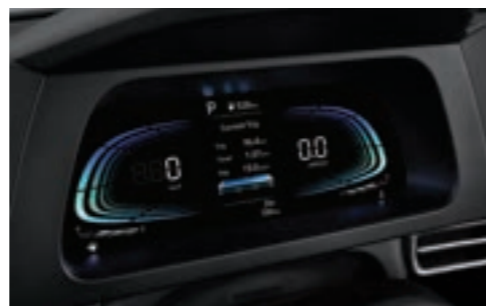
Cluster (4.2-inch color LCD)