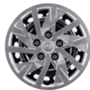
15" Steel Wheel & Wheel Cover