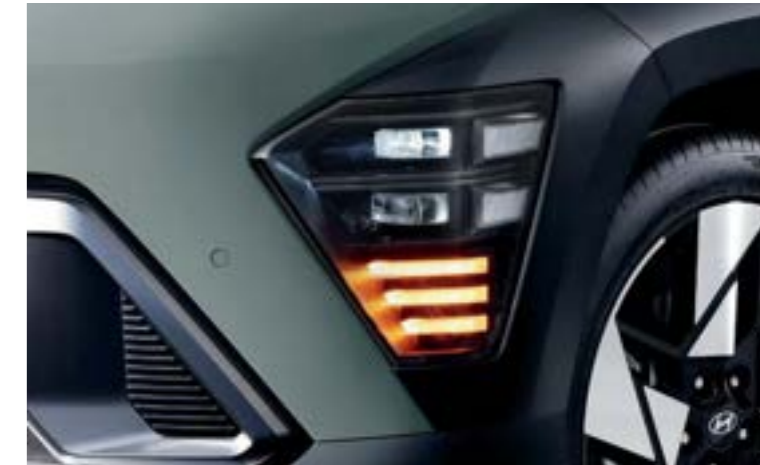
Full LED headlamps (projection type)