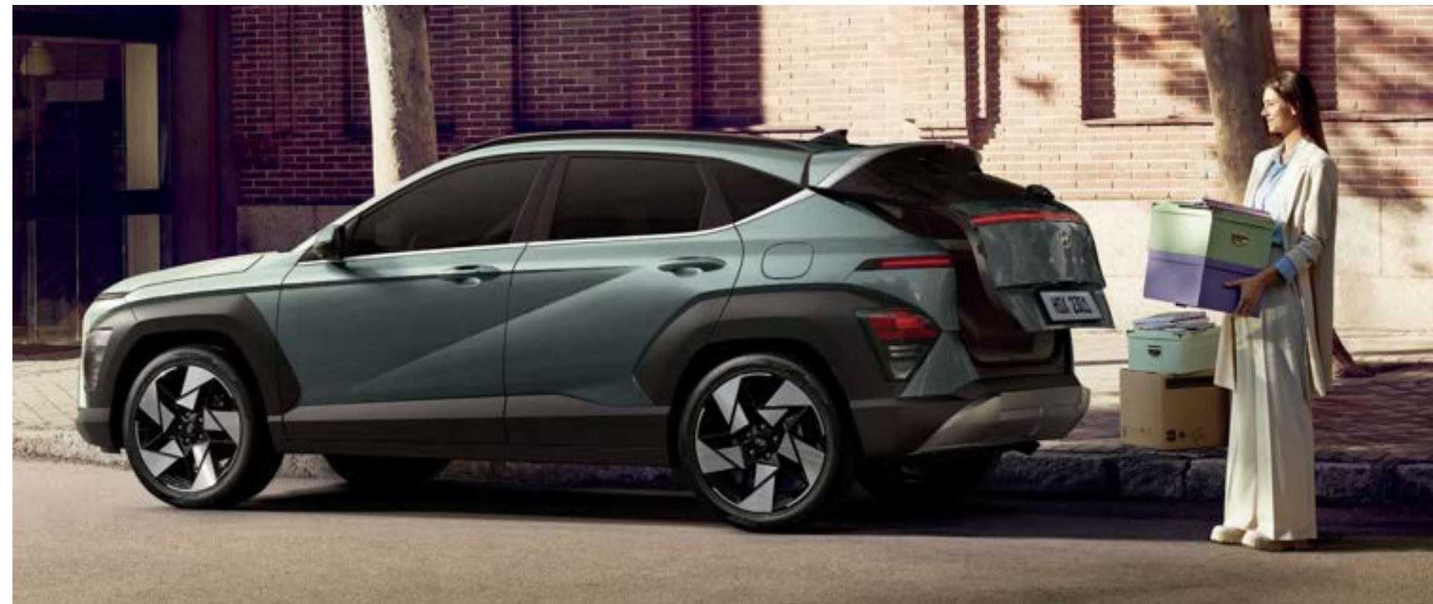
Smart power tailgate - Hands-free smart liftgate with auto-open and adjustable height setting