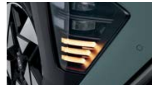
LED turn signal indicators (front/rear)