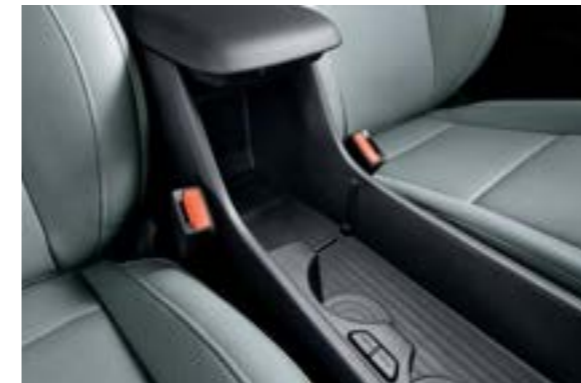
Open console storage (removable bulkhead / rotational cup holders)