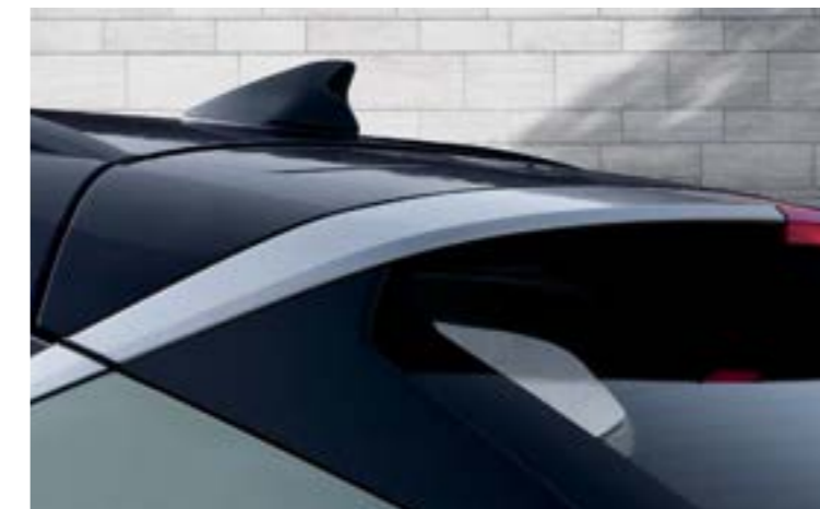
Dual tone roof, sharp connecting chrome line