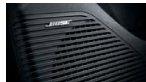
Bose premium audio system