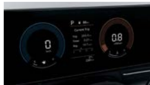
Cluster display (4-inch color LCD)