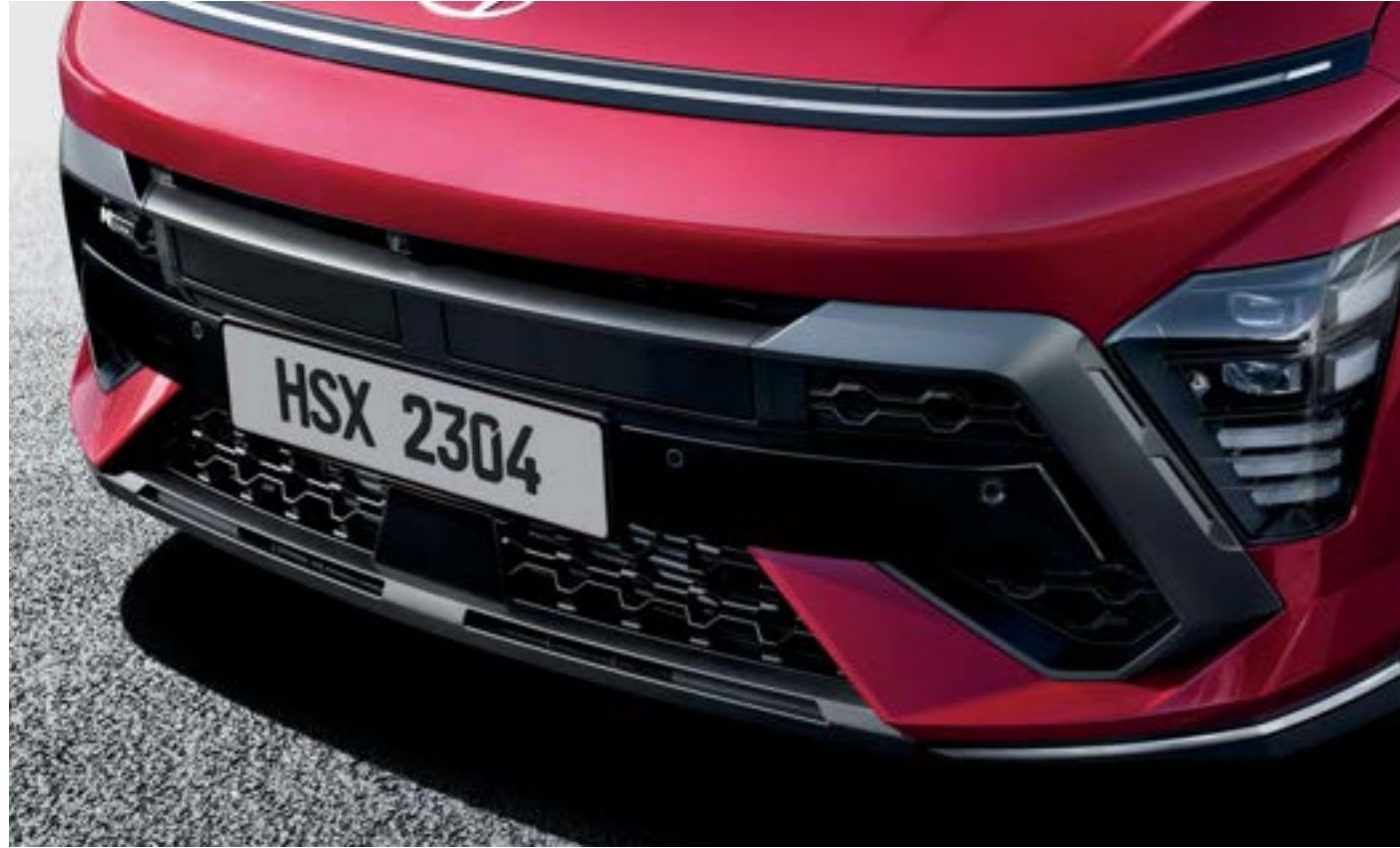
N Line-exclusive front bumper & bumper skirt

The N Line exudes boldness and dynamism, featuring a high-performance exterior design inspired by the renowned high-performance N.