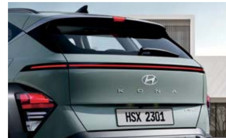
Spoiler Integrated HMSL, rear seamless horizon lamp LED brake lamps, LED turn signal lamps