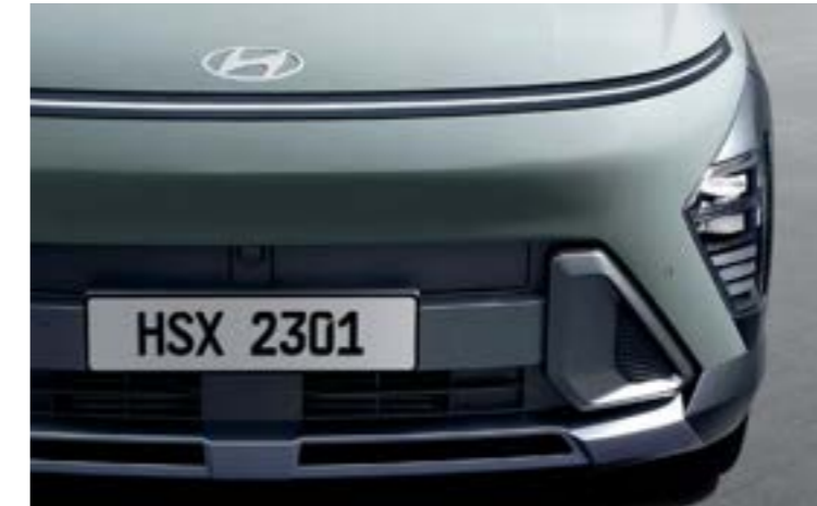
Front seamless horizon lamp, front bumper