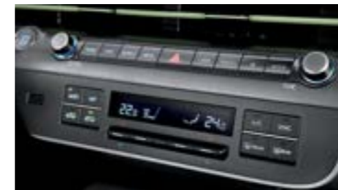
Full auto air conditioning system