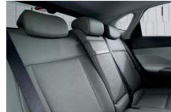
2nd-row seatback 2-step latch