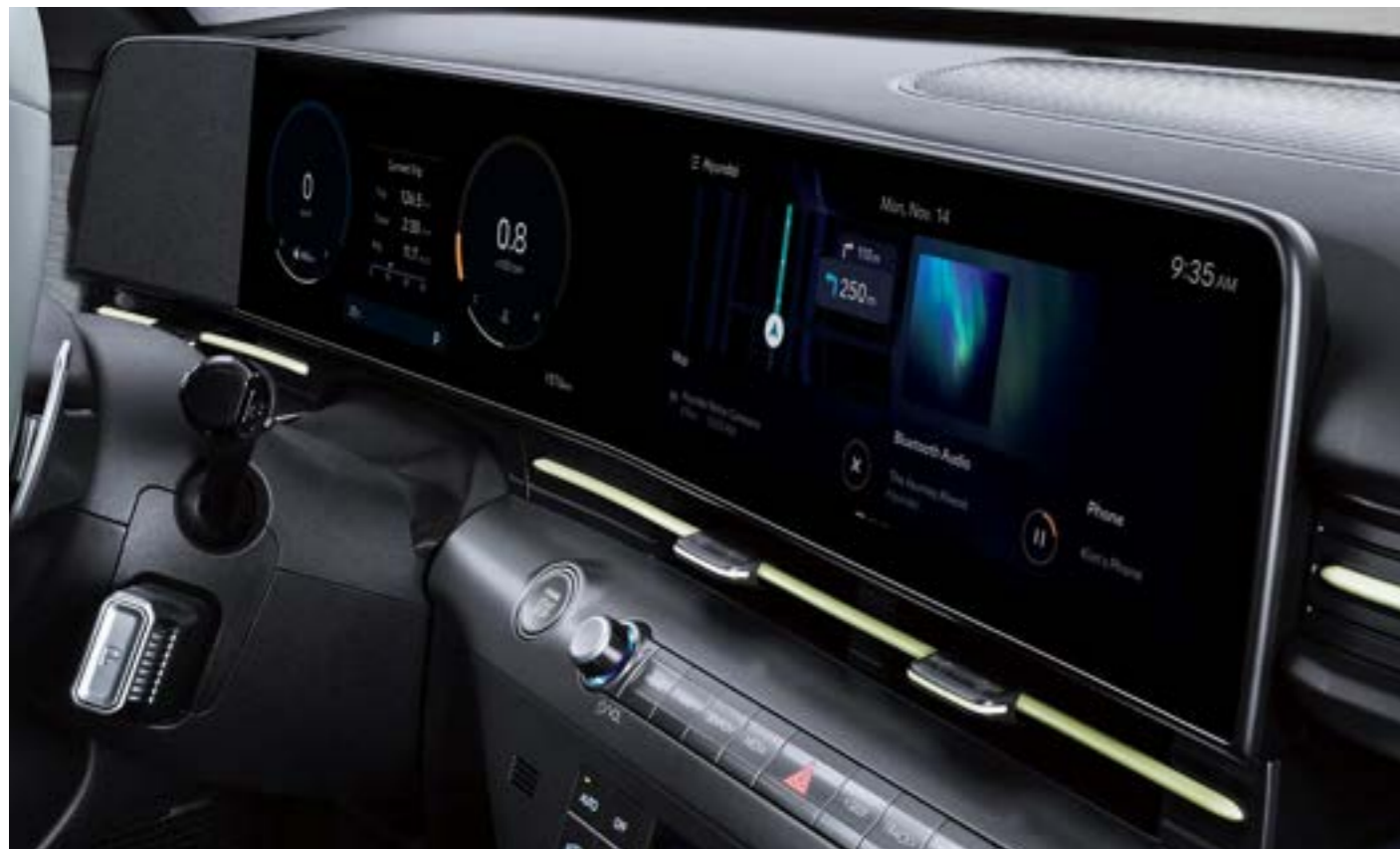
Panoramic display - 12.3-inch integrated dual screen display

The panoramic display - 12.3-inch integrated dual screen display and cutting-edge driver assistance technology offer high-tech convenience and increase user satisfaction in daily use.