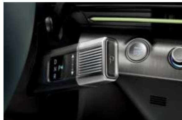
Column-Type Shift by Wire (SBW)