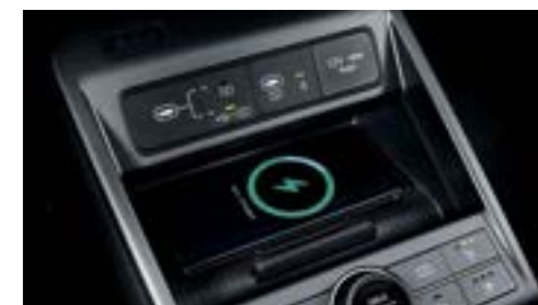
USB-C Data/Charging ports /Wireless charging pad