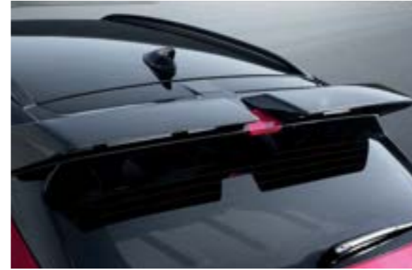
N Line-exclusive wing-type rear spoiler