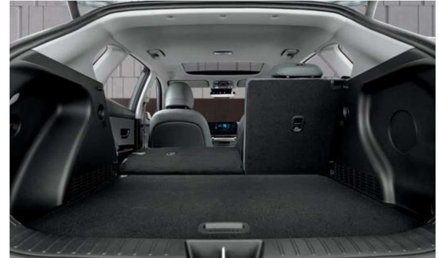
6:4 folding 2nd row seat backs