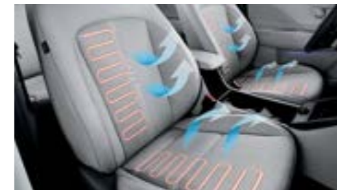
Heated & Ventilated front seats