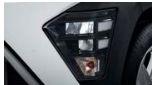
LED Headlamps (MFR)