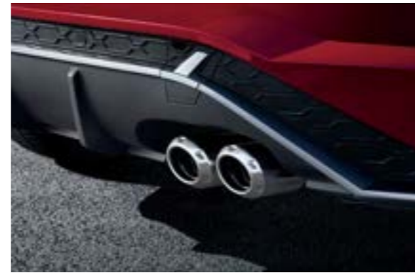
N Line-exclusive single twin tip muffler