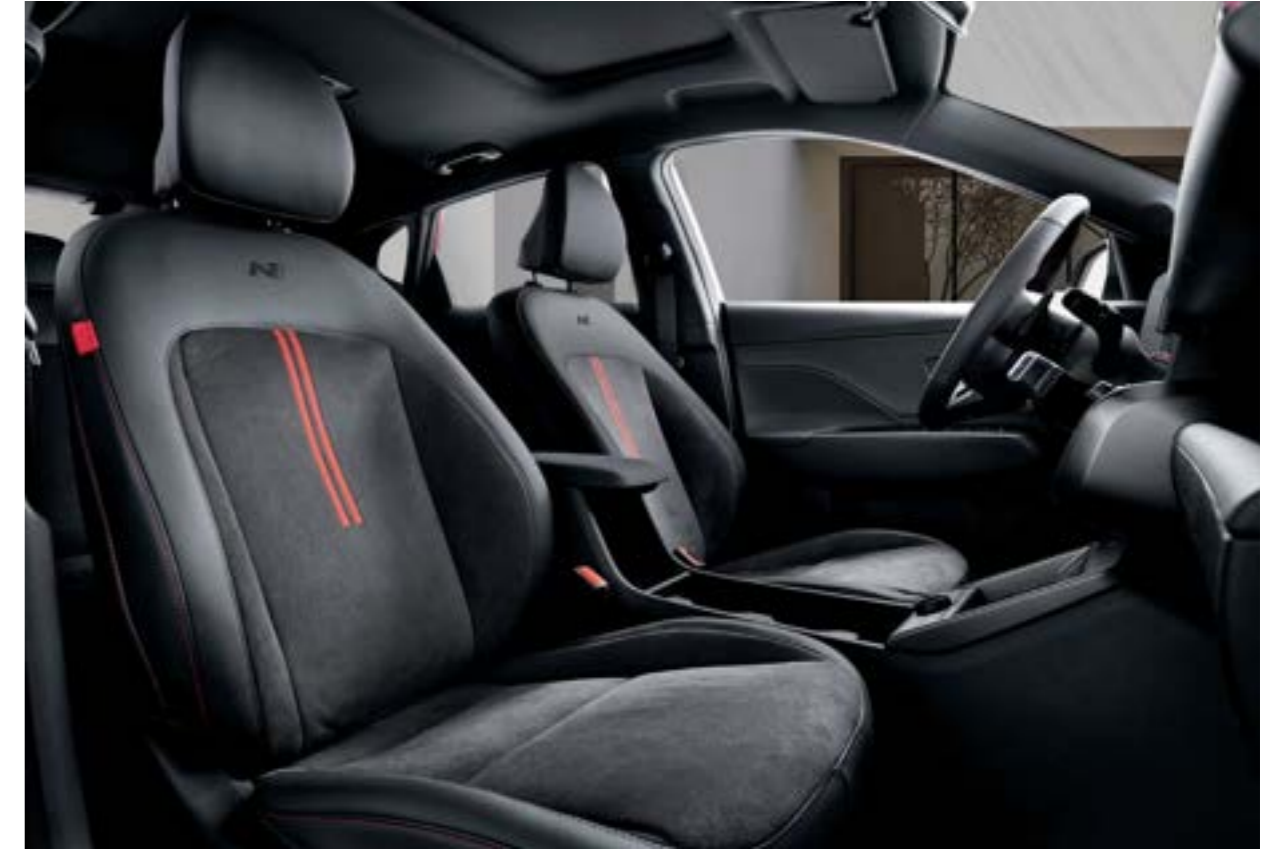
N Line-exclusive authentic leather / Alcantara combination seats