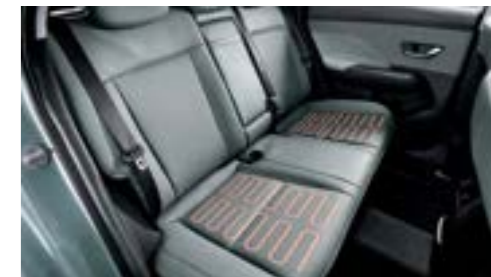
Heated rear seats