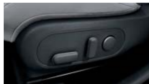
Powered driver seat