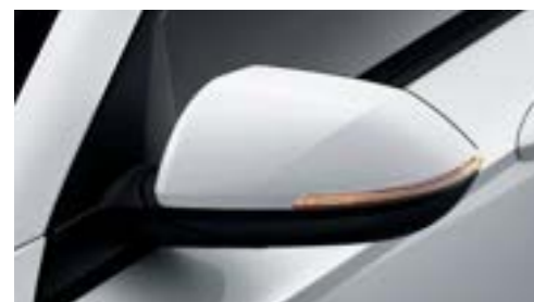
Outside mirror (Heated / Folding / Turn signal indicator LED)