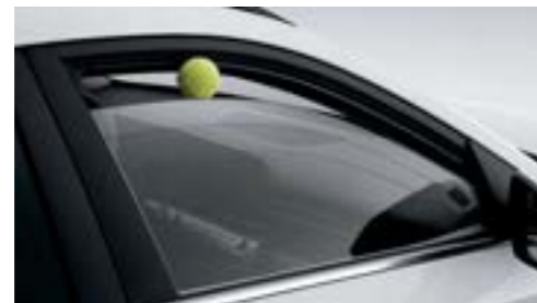
Safety power window