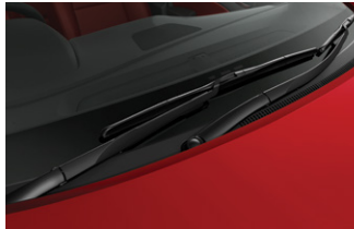
Aero blade wipers