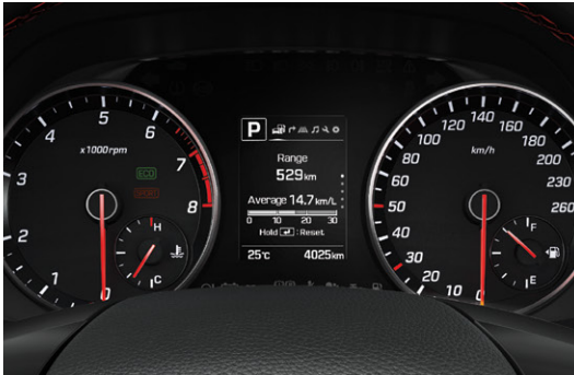
Supervision cluster with 3.5" mono TFT LCD

The audio system with an optional 5.0" color TFT touchscreen LCD offers convenience while the Bluetooth allows the drivers to listen to music and make calls while driving.