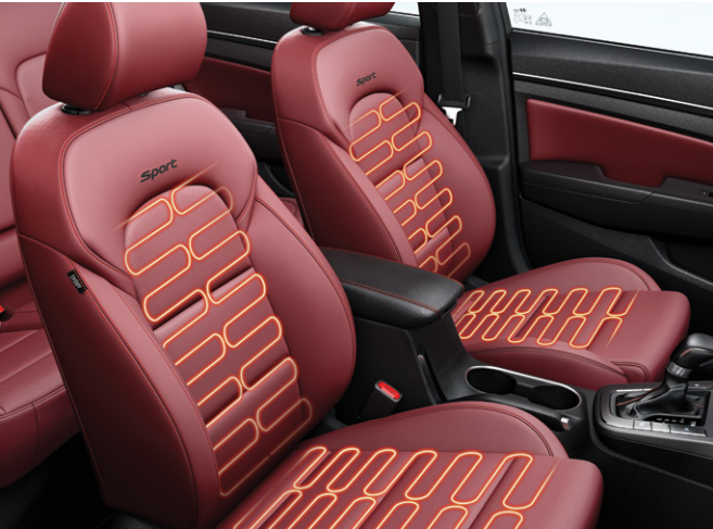
Front seat warmers