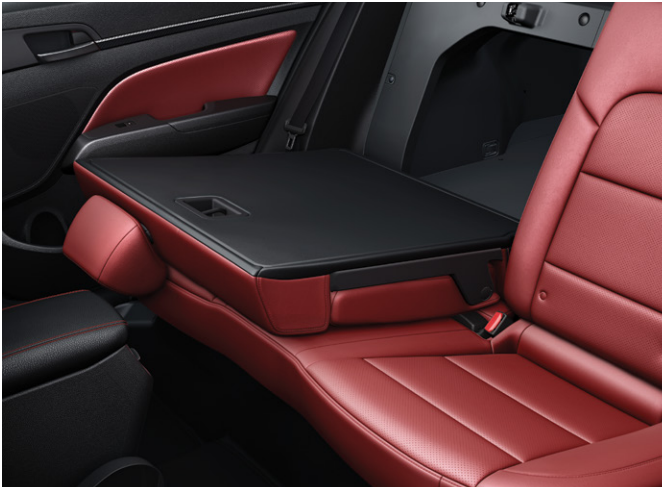
Seat folding system (6:4 type)