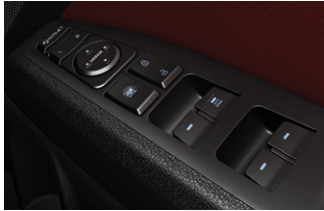
Power window controls