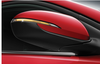
Outside mirror repeaters