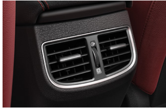
Rear air ventilation system