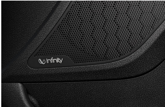
Infinity premium sound system

The supervision cluster comprehensively displays various vehicle information to provide the driver with a vehicle control that is user-centric, convenient and intuitive.