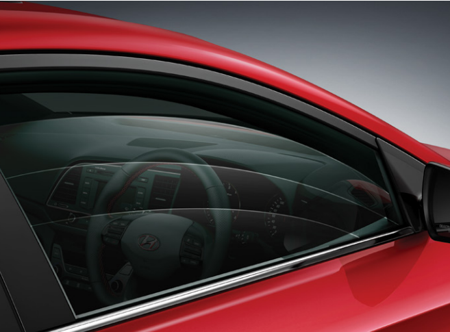
Safety window controls