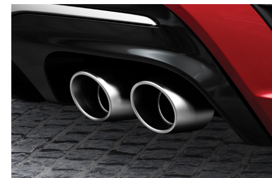
Twin tip muffler