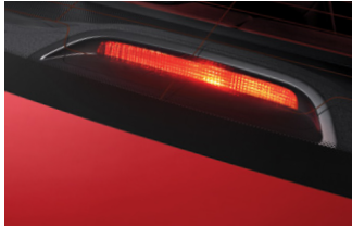
High-mounted stop lamp (HMSL)