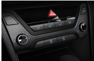
Manual air conditioning system