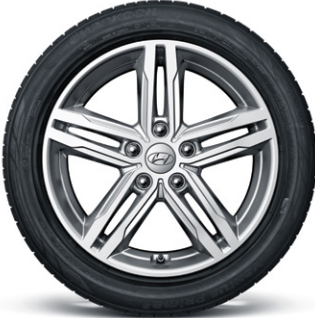
17" alloy wheels with 225 / 45R17 tires.