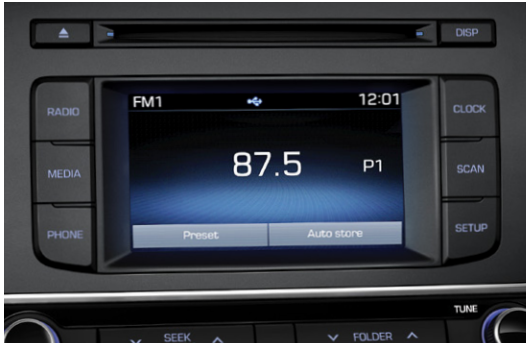
5" LCD audio system

The audio system with an optional 5.0" color TFT touchscreen LCD offers convenience while the Bluetooth allows the drivers to listen to music and make calls while driving.