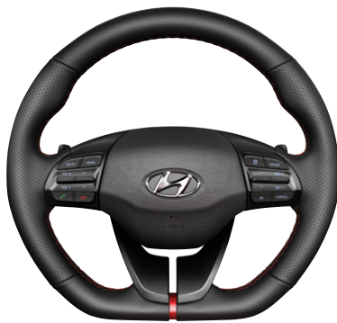
D-cut steering wheel

Carbon grey for understated cool. Leather, D-cut steering wheel for ergonomics with style. Sit yourself in the driver's seat and the tactile, modern detailing makes a lasting impression.