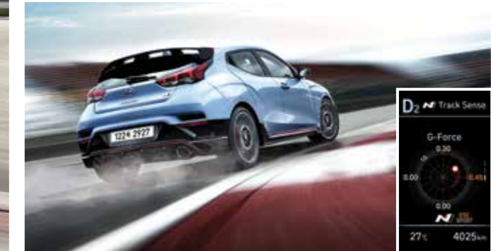
N Track Sense Shift (NTS) When road conditions are ideal for dynamic driving and cornering, NTS automatically kicks in and selects the optimal gear and shift timing for a sporty driving experience and superior performance.