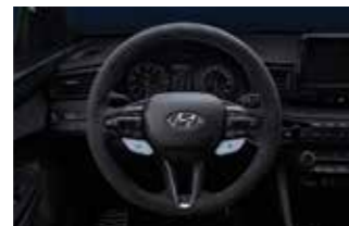
Alcantara steering wheel