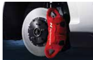
N Performance Brake System (4-piston monobloc calipers, hybrid balling discs, and low-steel pads)