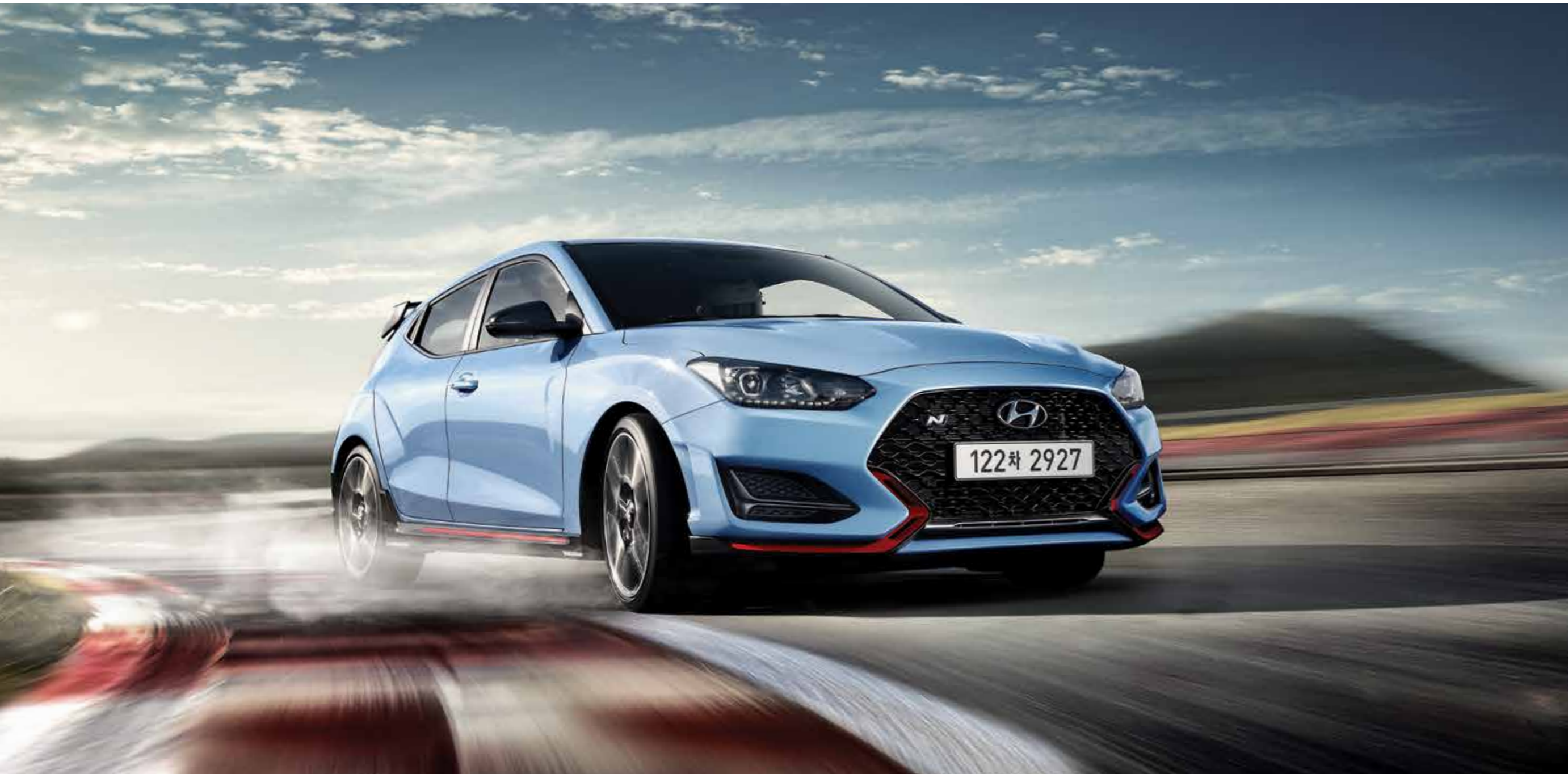
VELOSTER N Full Option (Performance Blue, excludes wide sunroof)