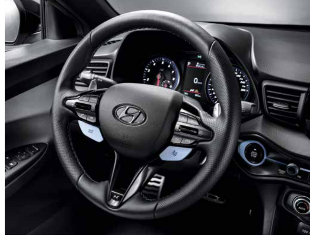
Sports steering wheel & paddle shift