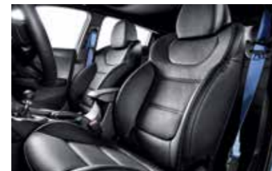
N-exclusive sports bucket seats & seatbelts in performance blue