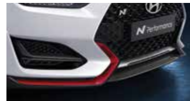
Carbon fiber front lip and fog light garnish