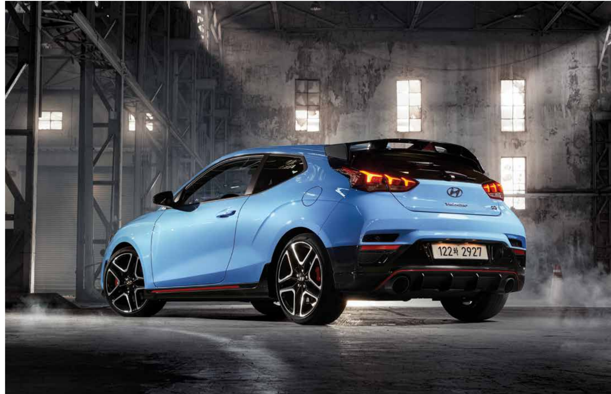
VELOSTER N Full Option (Performance Blue, excludes wide sunroof)