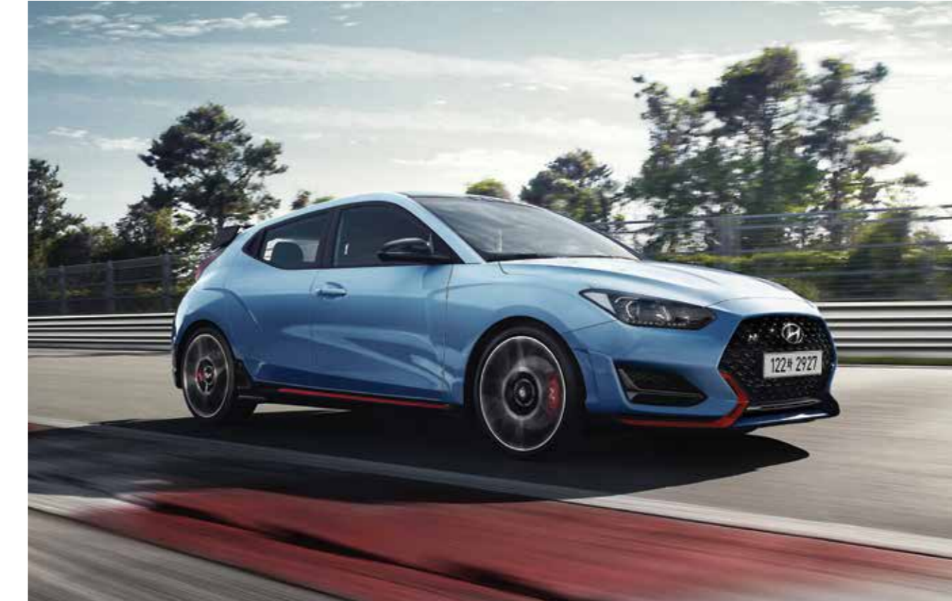
N Power Shift (NPS) NPS controls RPM to enhance acceleration and deliver greater torque when shifting - previously available only on manual transmissions.