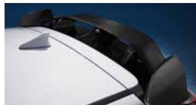
Carbon fiber rear spoiler