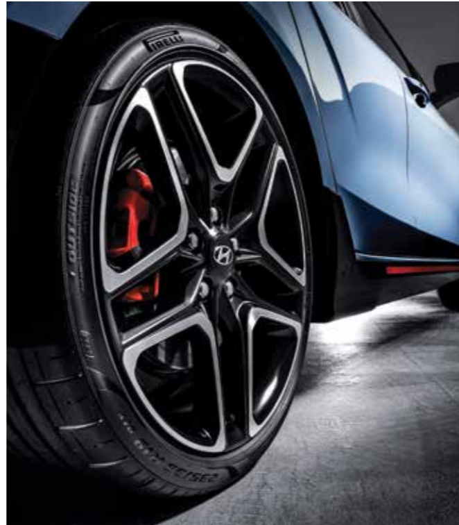
19" alloy wheels & side sill