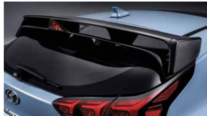
Rear diffuser with large air flow fins Rear wing spoiler