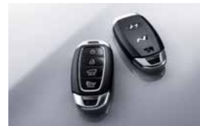
Smart keys with the N logo