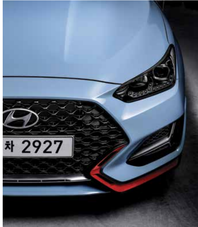
Wide radiator grille & air curtains

A performance-optimizing design and fiery red trim give more power and character to this high-performance hot hatch back.