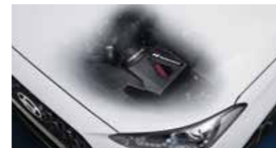
High-performance air intake system