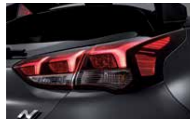
LED rear combination lamps