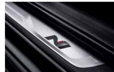
N-exclusive metal door scuff