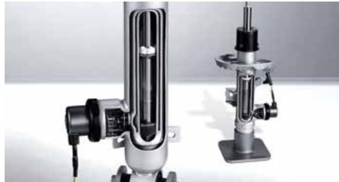
Electronic Control Suspension (ECS) The damping force of the shock absorber on each wheel is controlled according to changing road surfaces to ensure distinct performance in all driving conditions, both on race track and during everyday driving.