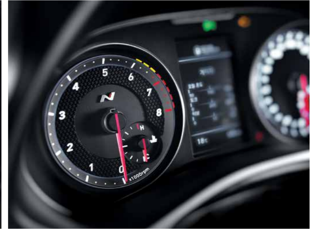
Supervision cluster display