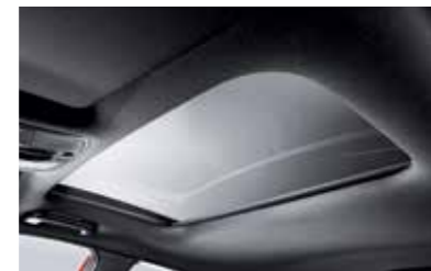
Wide sunroof (including cloth headlining)