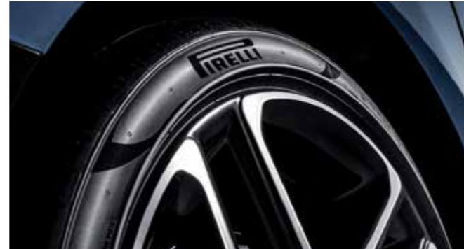
Pirelli P Zero tires The exclusively engineered high-performance Pirelli P Zero tires complement VELOSTER N's power.