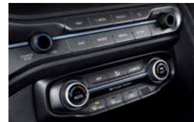
Fully automatic air conditioner