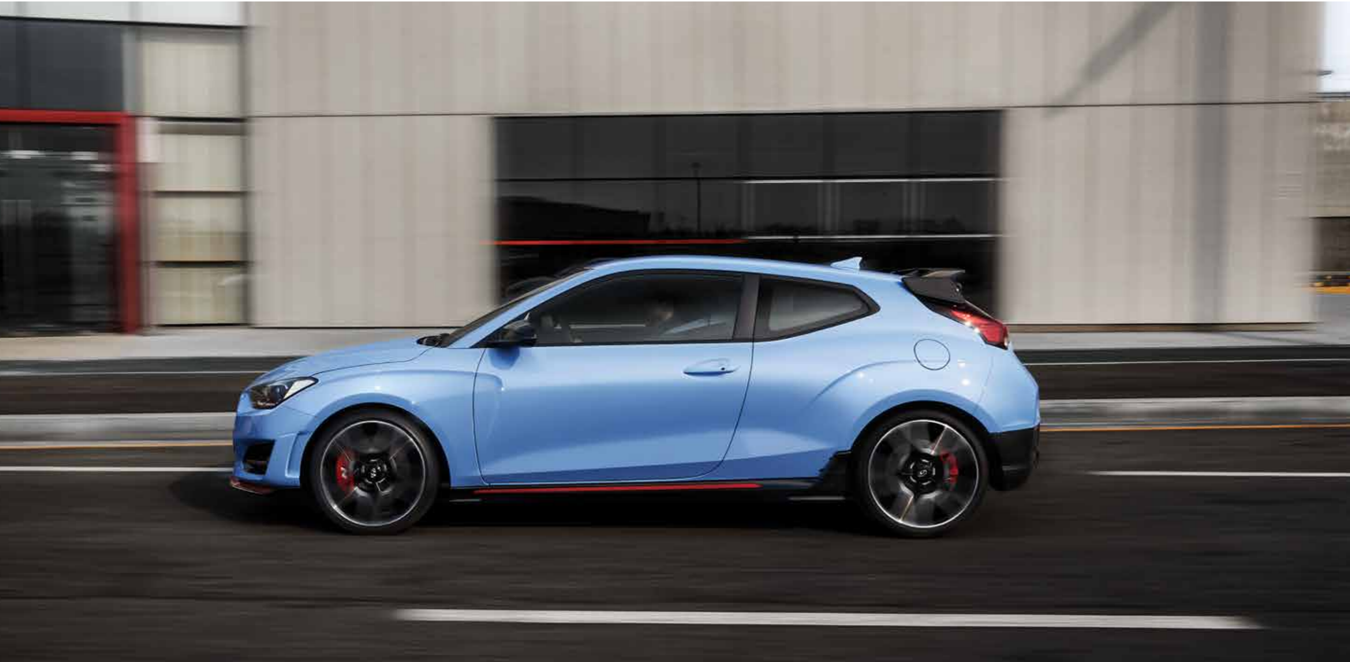
VELOSTER N Full Option (Performance Blue, excludes wide sunroof)