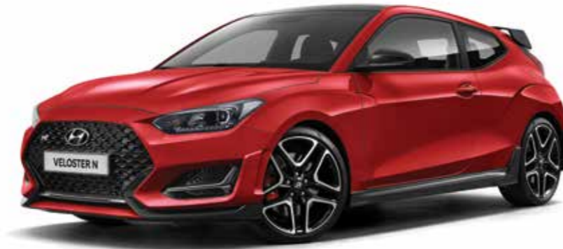
VELOSTER N (Ignite Flame)