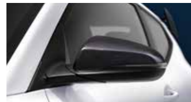
Carbon fiber side mirror cover