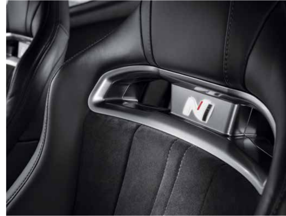
N Light Sports Bucket Seat (N light with the N logo, Alcantara suede)