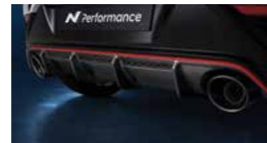
Carbon fiber rear diffuser