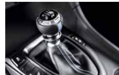
N-exclusive 6-speed manual transmission