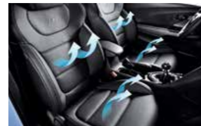
Ventilated & heated front seats