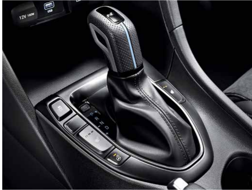
N DCT shift knob & boot

The N Light Sports Bucket Seat grants the perfect fit for the driver while the tight grips on the gear shift and steering wheel provide superior control.