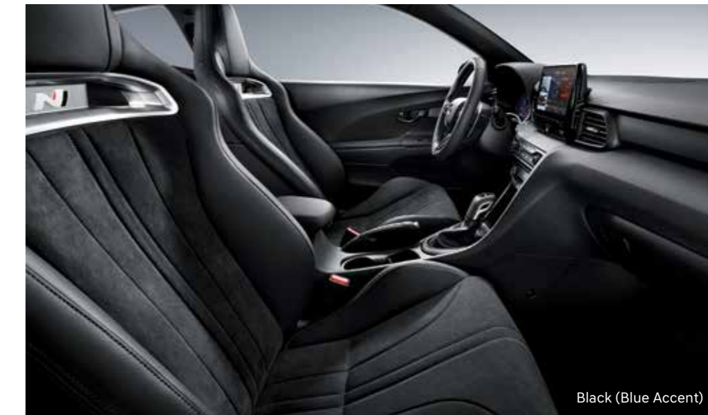
Black (Blue Accent)