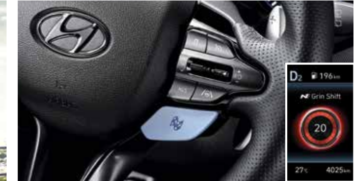
N Grin Shift (NGS) When greater acceleration is needed while driving, use the NGS button to overboost for 20 seconds and maximize engine performance and transmission response.