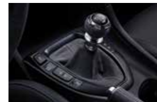
Alcantara manual gear shift knob and boot * Available on N DCT