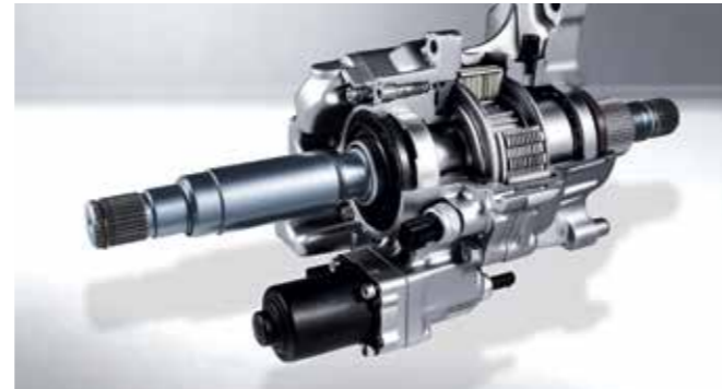
N Corner Carving Differential The driving power of wheels on either side is electronically controlled and distributed, ensuring acceleration without slippage when cornering.