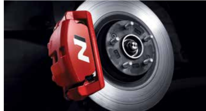
N-exclusive high-performance brakes & calipers with the N logo Stopping is as important as speed when it comes to high-performance vehicles, and VELOSTER N's high-capacity braking system delivers stability in changing driving conditions.