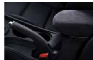
Alcantara parking brake lever and center console