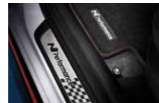
N Performance exclusive mats and metal door scuff