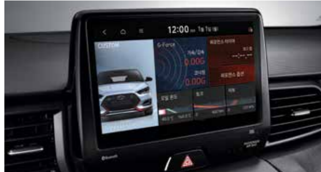
N Grin Control System The N Grin Control System comes with a choice of five distinct driving modes to match your driving situation: Eco, Normal, Sport, N and N Custom.