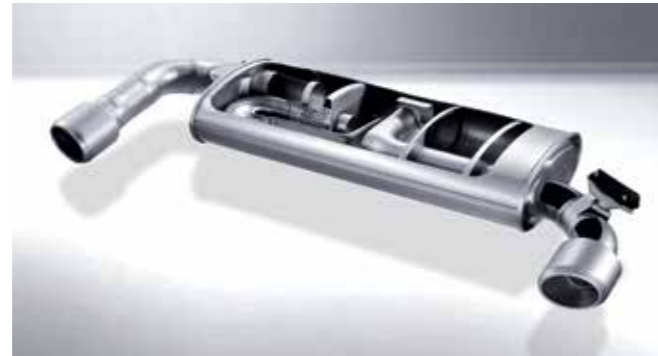
Variable exhaust valve Shaped exhaust pipes and electronic variable valves give you a choice of quiet driving or sporty engine sound for different driving conditions.