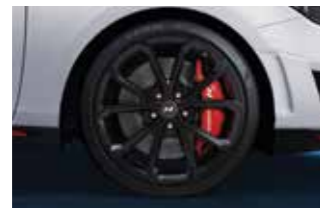
19" lightweight wheels * Also available outside of packages